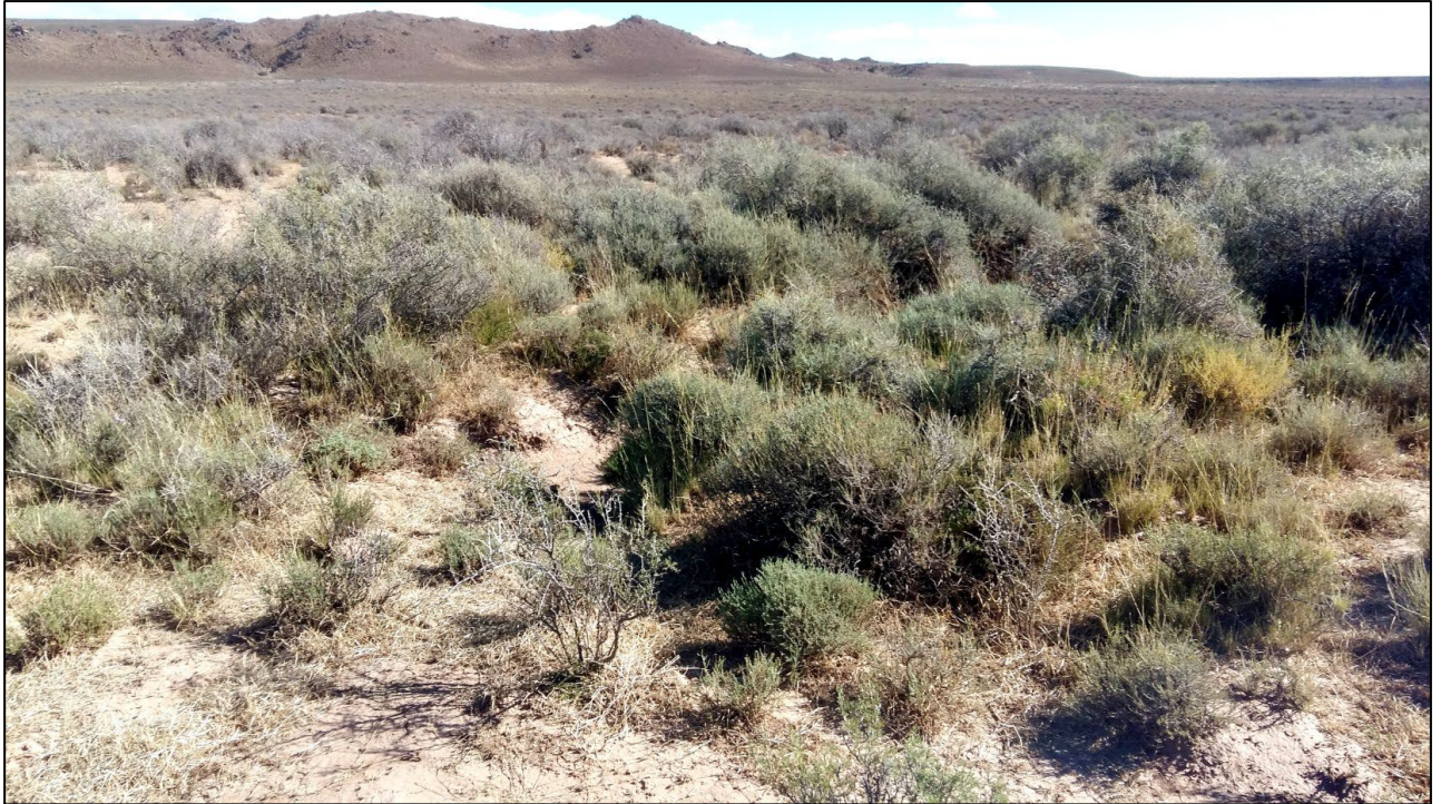
Figure 6. Riparian area within the Klipkraal Wind Energy Facility 2 with vegetation that can be considered allied with the Southern Karoo Riviere vegetation type.