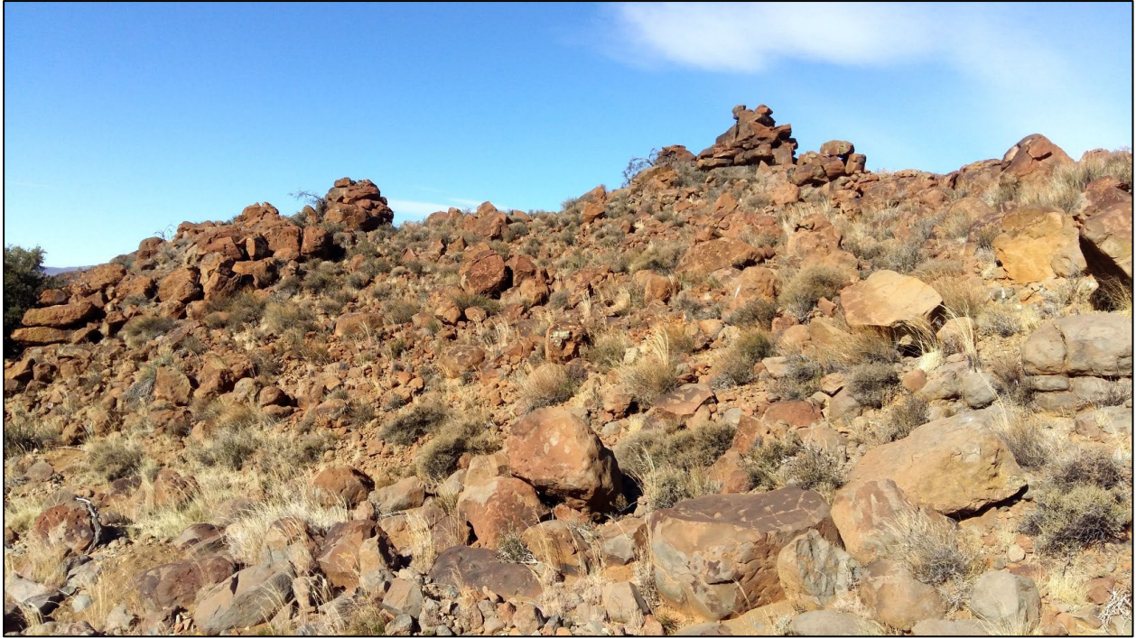
Figure 5. Typical example of a dolerite ridge from within the Klipkraal 2 site, representative of the Upper Karoo Hardeveld vegetation type.

Although not all areas associated with this vegetation type have been mapped in the VegMap, the vegetation along the major rivers within the Klipkraal 2 site corresponds with the Southern Karoo Riviere vegetation type. In the area, the riparian areas are mapped as Bushmanland Vloere in the VegMap, but this is not an appropriate designation for these areas and the riparian areas within the site, correspond better with the Southern Karoo Riviere vegetation type. The Southern Karoo Riviere vegetation type is associated with the rivers of the central karoo such as the Buffels, Bloed, Dwyka, Gamka, Sout, Kariega and Sundays Rivers. About 12% has been transformed as a result of intensive agriculture and the construction of dams. Although it is classified as Least Threatened, it is associated with rivers and drainage lines and as such represents areas that are considered ecologically significant. Common and dominant species in the drainage lines and within the adjacent floodplain vegetation include Sporobolus ioclados , Helichrysum pentzioides , Drosanthemum lique , Pentzia globosa , Salsola aphylla , Tribulis terrestris , Felicia muricata , Atriplex vestita , Zygophyllum retrofractum , Cynodon dactylon , Chrysocoma ciliata , Stipagostis namaquensis , Lycium pumilum , Lycium cinereum , Artemisia africana , Tripteris spinescens , Exomis microphylla and Derrera denudata . No plant species of concern were observed within these areas.