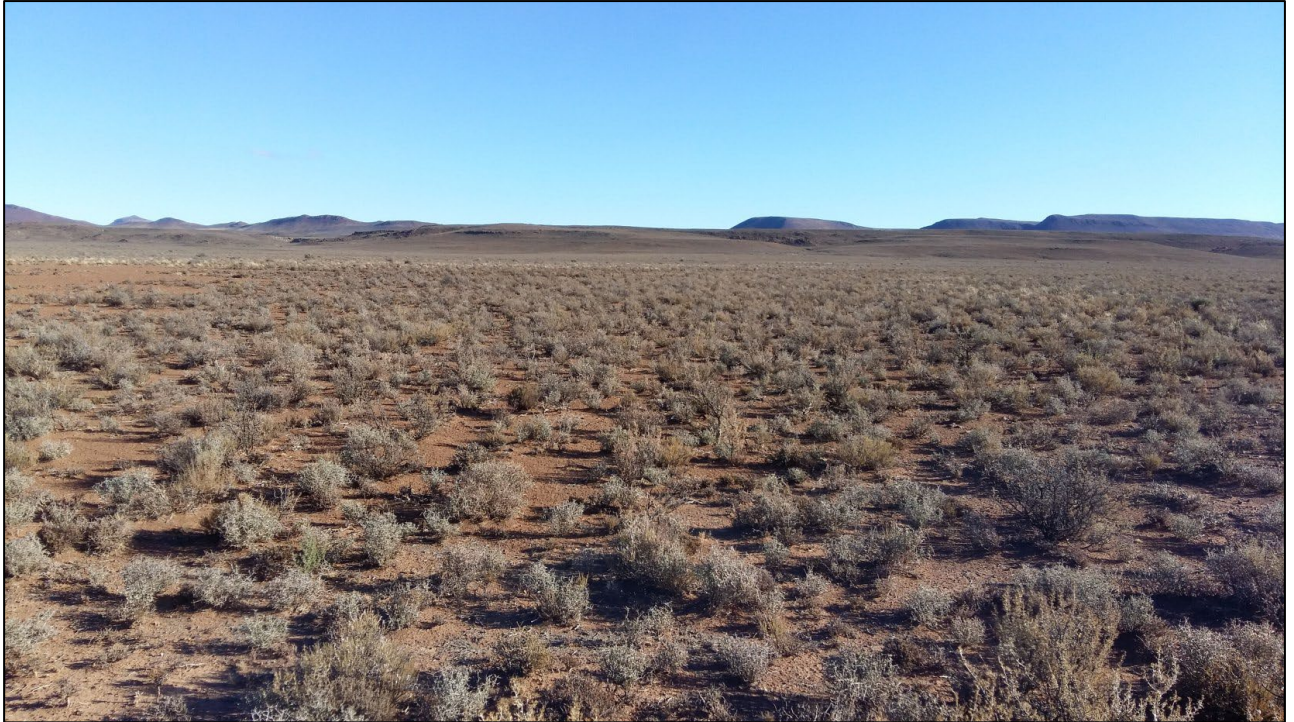
Figure 4. Typical open plains vegetation from the west of the Klipkraal 2 project area, representative of the Western Upper Karoo vegetation type showing the homogenous nature of the site and lack of significant features within large parts of the project area.

The areas mapped under the VegMap as Upper Karoo Hardeveld in the area are very coarsely mapped and there are some additional areas of Upper Karoo Hardeveld present within the Klipkraal Cluster and especially within the Klipkraal 2 site that have not been mapped. The Upper Karoo Hardeveld vegetation type is associated with 11 734 km 2 of the steep slopes of koppies, buttes mesas and parts of the Great Escarpment covered with large boulders and stones. The vegetation type occurs as discrete areas associated with slopes and ridges from Middelpoort in the west and Strydenburg, Richmond and Nieu-Bethesda in the east, as well as most south-facing slopes and crests of the Great Escarpment between Teekloofpas and eastwards to Graaff-Reinet. Altitude varies from 1000-1900m. Mucina & Rutherford (2006) list 17 species known to be endemic to the vegetation type. This is a high number given the wide distribution of most karoo species and illustrates the relative sensitivity of this vegetation type compared to the surrounding Eastern Upper Karoo.