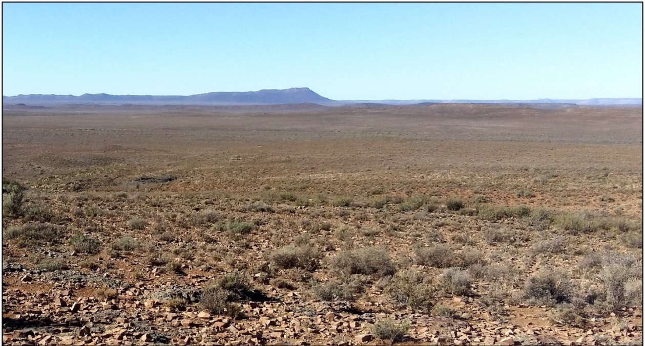
Figure 3. Typical open plains within the southwest of Klipkraal 2 project area, representative of the Eastern Upper Karoo vegetation type, showing the homogenous nature of the site and affected vegetation.

cinereum , Tripteris sinuata , Chrysocoma ciliata , Eriocephalus ericoides subsp. ericoides , Helichrysum lucilioides , Pentzia globosa , Tetragonia arbuscula , Asparagus capensis var. capensis , Berkheya annectens , Eriocephalus decussatus , Euryops multifidus , Felicia muricata , Hermannia cuneifolia , H. spinosa , Melolobium candicans , Pegolettia retrofracta , Pentzia incana , Pteronia adenocarpa , P. glauca , P. mucronata , P. sordida , Rosenia glandulosa , Selago albida and Zygophyllum microphyllum . Succulent shrubs include Ruschia intricata , Aridaria noctiflora subsp. straminea , Brownanthus ciliata subsp. ciliatus , Drosanthemum lique , Euphorbia rectirama , Galenia sarcophylla , Salsola calluna , S. glabrescens , S. rabieana , S. tuberculata , Sarcocaulon patersonii and Psilocaulon coriarium . Grasses include Aristida congesta , Enneapogon desvauxii , Stipagrostis ciliata , S. obtusa , Aristida adscensionis , A. diffusa , Eragrostis obtusa , Fingerhuthia africana , Tragus berteronianus and T. koelerioides .