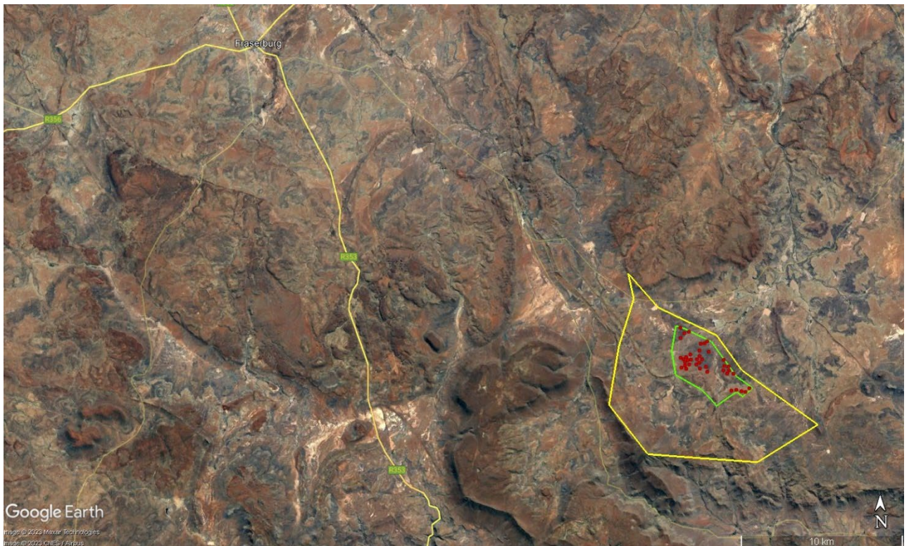
Figure 1. Satellite image showing the location of the proposed Klipkraal 2 Wind Farm, southeast of Fraserburg.

The Klipkraal Wind Energy Facility 2 is part of the Klipkraal Cluster and is located approximately 30 km southeast of Fraserburg in the Northern Cape. The layout and location of the Klipkraal Wind Energy Facility 2 is illustrated below in Figure 1 and includes up to 40 potential turbine locations with a maximum output of 240 MW.