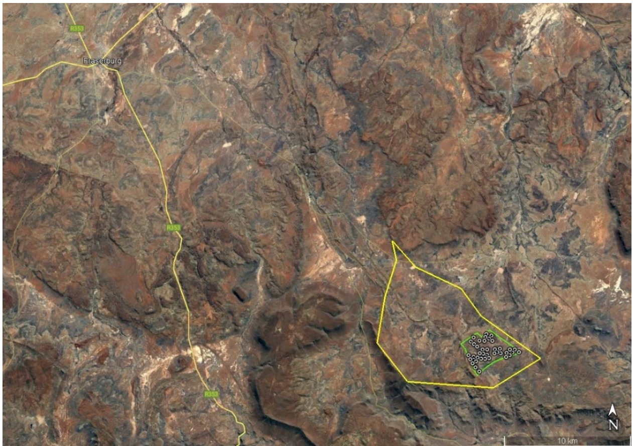
Figure 1. Satellite image showing the location of the proposed Klipkraal 3 Wind Farm, southeast of Fraserburg.

The Klipkraal Wind Energy Facility 2 is part of the Klipkraal Cluster and is located approximately 30 km southeast of Fraserburg in the Northern Cape. The layout and location of the Klipkraal Wind Energy Facility 2 is illustrated below in Figure 1 and includes up to 40 potential turbine locations with a maximum output of 240 MW.