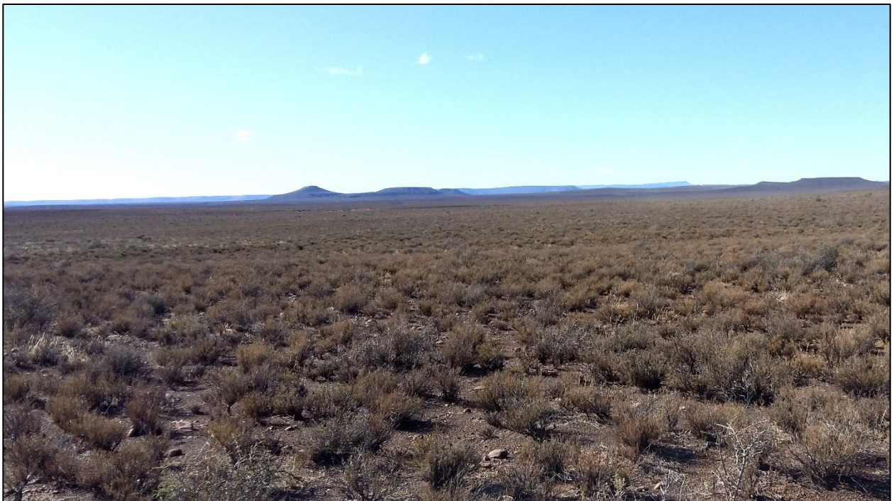
Figure 3. Typical open plains within the southwest of Klipkraal 3 project area, representative of the Western Upper Karoo vegetation type, showing the homogenous nature of the site and affected vegetation.

cinereum , Tripteris sinuata , Chrysocoma ciliata , Eriocephalus ericoides subsp. ericoides , Helichrysum lucilioides , Pentzia globosa , Tetragonia arbuscula , Asparagus capensis var. capensis , Berkheya annectens , Eriocephalus decussatus , Euryops multifidus , Felicia muricata , Hermannia cuneifolia , H. spinosa , Melolobium candicans , Pegolettia retrofracta , Pentzia incana , Pteronia adenocarpa , P. glauca , P. mucronata , P. sordida , Rosenia glandulosa , Selago albida and Zygophyllum microphyllum . Succulent shrubs include Ruschia intricata , Aridaria noctiflora subsp. straminea , Brownanthus ciliata subsp. ciliatus , Drosanthemum lique , Euphorbia rectirama , Galenia sarcophylla , Salsola calluna , S. glabrescens , S. rabieana , S. tuberculata , Sarcocaulon patersonii and Psilocaulon coriarium . Grasses include Aristida congesta , Enneapogon desvauxii , Stipagrostis ciliata , S. obtusa , Aristida adscensionis , A. diffusa , Eragrostis obtusa , Fingerhuthia africana , Tragus berteronianus and T. koelerioides .