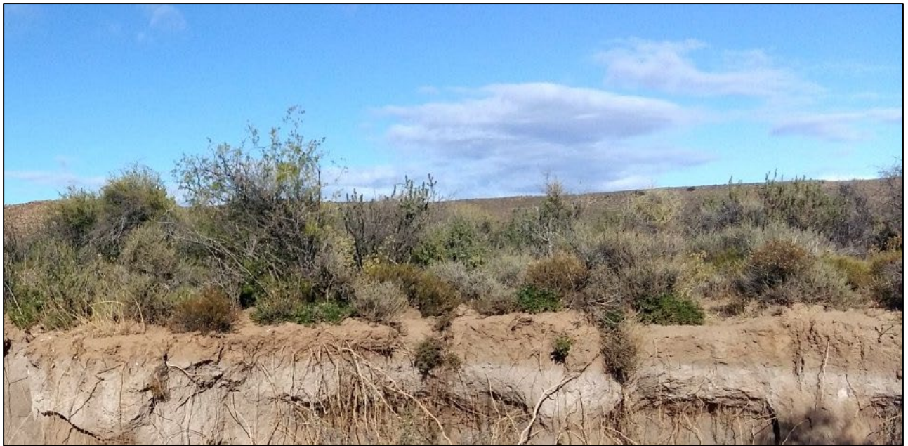
Figure 6. Riparian floodplain vegetation within the Klipkraal 3 site with vegetation that can be considered allied with the Southern Karoo Riviere vegetation type.