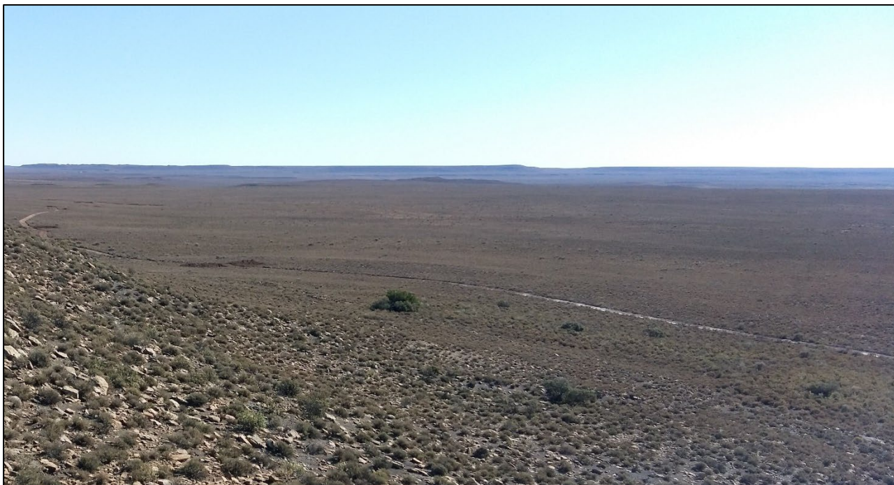
Figure 4. Typical open plains vegetation from the Klipkraal 3 project area, representative of the Eastern Upper Karoo vegetation type showing the homogenous nature of the site and lack of significant features within large parts of the project area.

The areas mapped under the VegMap as Upper Karoo Hardeveld in the area are very coarsely mapped and there are some additional areas of Upper Karoo Hardeveld present within the Klipkraal Cluster that have not been mapped. The majority of the hills within the Klipkraal 3 site are however capped with mudstone and there are only a few areas of the more typical dolerite outcrops that characterise the Upper Karoo Hardeveld present. The Upper Karoo Hardeveld vegetation type is associated with 11 734 km 2 of the steep slopes of koppies, buttes mesas and parts of the Great Escarpment covered with large boulders and stones. The vegetation type occurs as discrete areas associated with slopes and ridges from Middelpos in the west and Strydenburg, Richmond and Nieu-Bethesda in the east, as well as most south-facing slopes and crests of the Great Escarpment between Teekloofpas and eastwards to Graaff-Reinet. Altitude varies from 1000-1900m. Mucina & Rutherford (2006) list 17 species known to be endemic to the vegetation type. This is a high number given the wide distribution of most karoo species and illustrates the relative sensitivity of this vegetation type compared to the surrounding Eastern Upper Karoo.