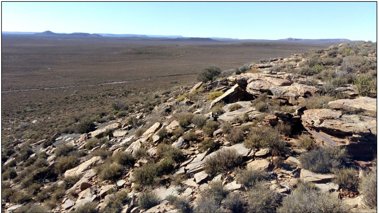
Figure 5. Typical example of a low hill and associated slope from within the Klipkraal 3 site, capped with mudstone.

Although not all areas associated with this vegetation type have been mapped in the VegMap, the vegetation along the major rivers within the Klipkraal 3 site corresponds with the Southern Karoo Riviere vegetation type. In the area, the riparian areas are mapped as Bushmanland Vloere in the VegMap, but this is not an appropriate designation for these areas and the riparian areas within the site, correspond better with the Southern Karoo Riviere vegetation type. The Southern Karoo Riviere vegetation type is associated with the rivers of the central karoo such as the Buffels, Bloed, Dwyka, Gamka, Sout, Kariega and Sundays Rivers. About 12% has been transformed as a result of intensive agriculture and the construction of dams. Although it is classified as Least Threatened, it is associated with rivers and drainage lines and as such represents areas that are considered ecologically significant. Common and dominant species in the drainage lines and within the adjacent floodplain vegetation include Sporobolus ioclados , Helichrysum pentzioides , Drosanthemum lique , Pentzia globosa , Salsola aphylla , Tribulus terrestris , Felicia muricata , Atriplex vestita , Zygophyllum retrofractum , Cynodon dactylon , Chrysocoma ciliata , Stipagostis namaquensis , Lycium pumilum , Lycium cinereum , Artemisia africana , Tripteris spinescens , Exomis microphylla and Derrera denudata . No plant species of concern were observed within these areas.