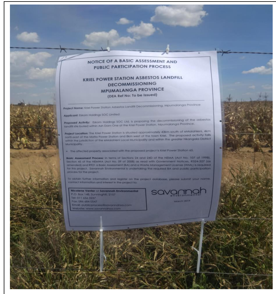
Figure 2: Site notices No.2: Placed on fence of the Farm Nooitgedaght along the R545, north of the turn-off to Kriel and Matla Power Stations.

Co-ordinates: 26°14'27.42"S; 29°12'23.18"E