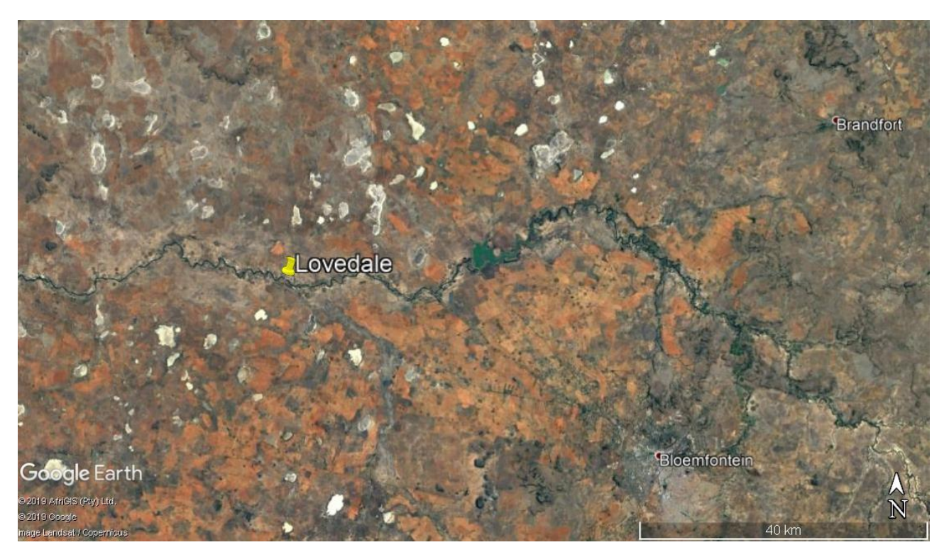
Figure 1. Map showing the location of Lovedale in the western Free State. The meandering green line running from east to west is the Modder River.