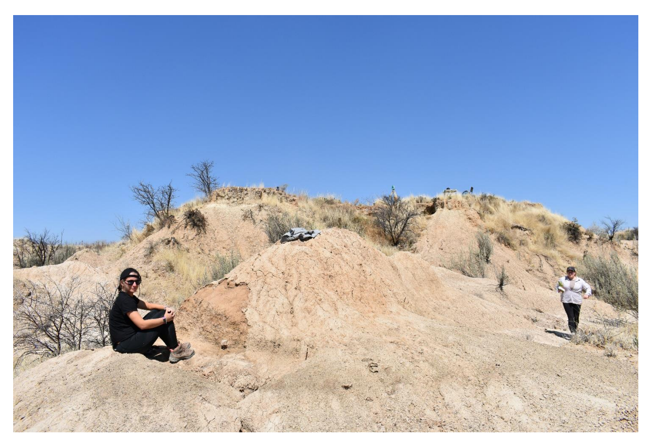
Figure 5. Unit 9 gravel layer during excavation, 2021 season. Note Area A at the top.