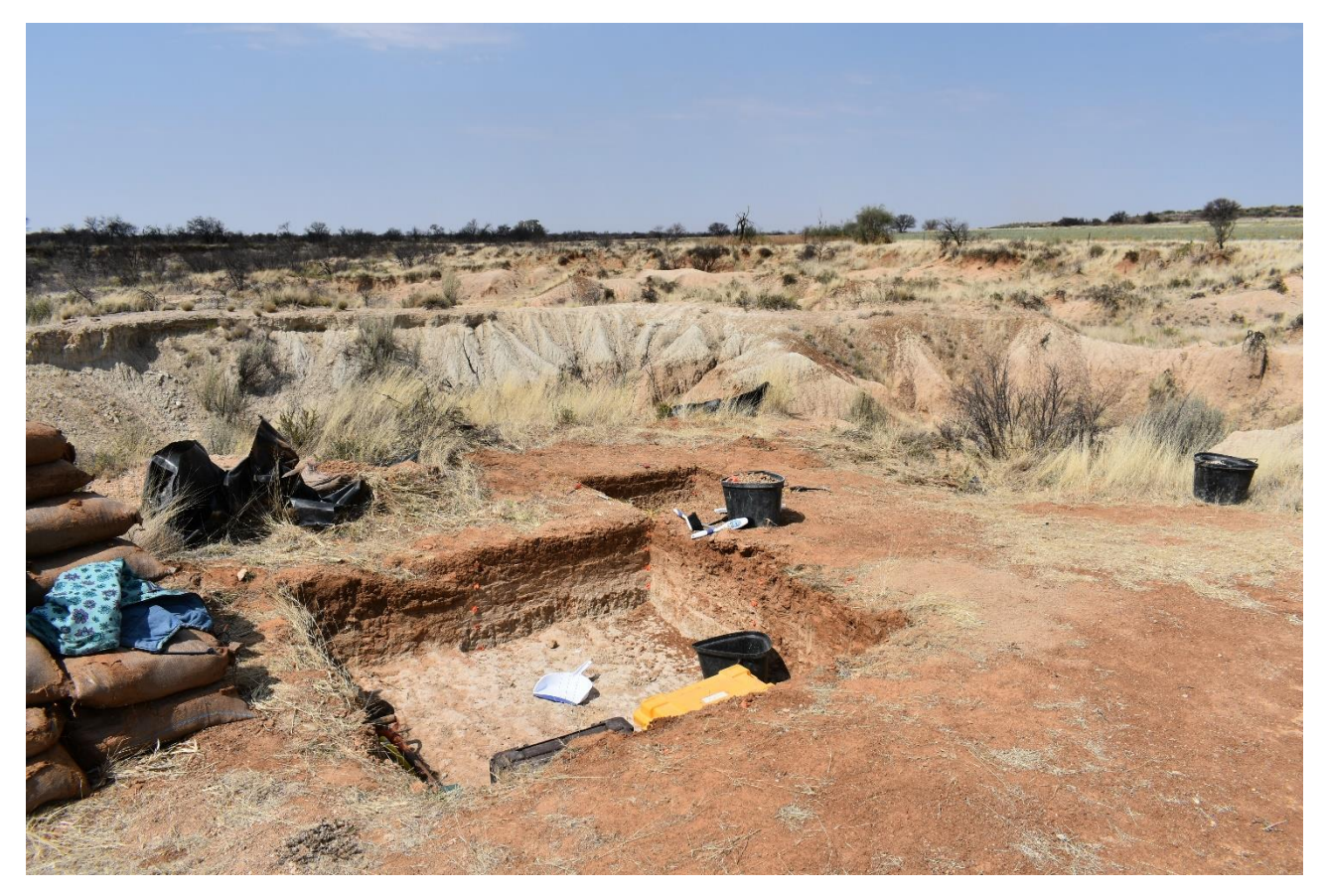
Figure 4. Area A during excavation, 2021 season.