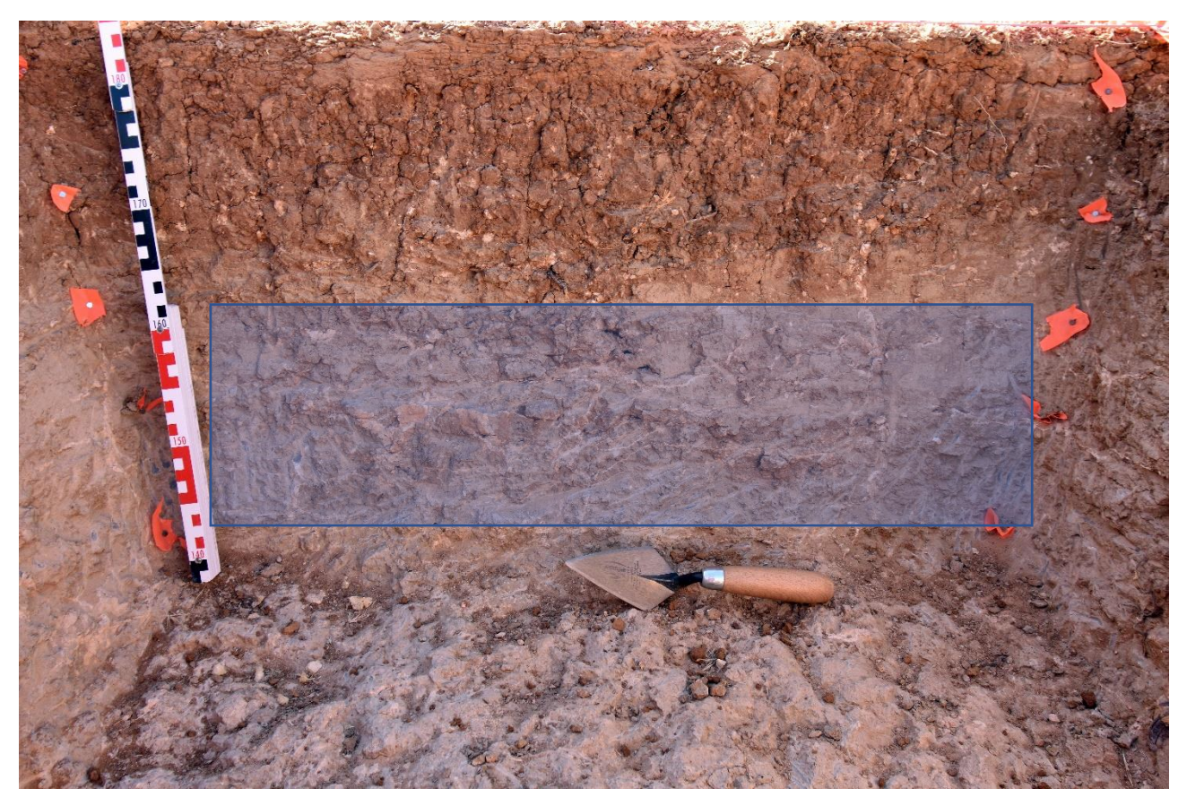
Figure 6. Photo of the east section of Unit 7 after excavation (2019). The shaded rectangle marks the excavation levels with the highest concentration of artifacts.