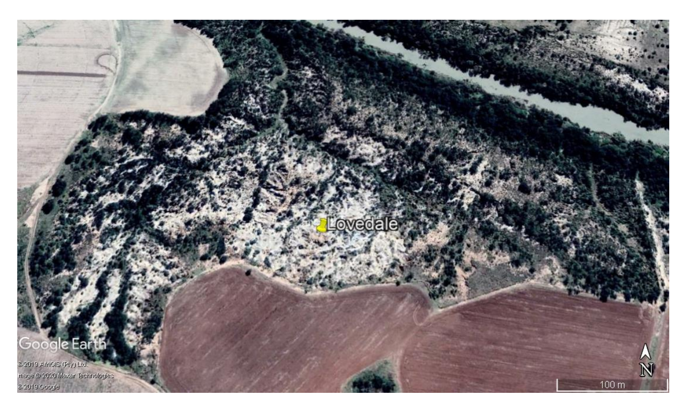
Figure 2. Aerial photo showing the location of the excavation site in the Lovedale donga. The grey line in the top-right corner is the Modder River.

Figure 1. Map showing the location of Lovedale in the western Free State. The meandering green line running from east to west is the Modder River.