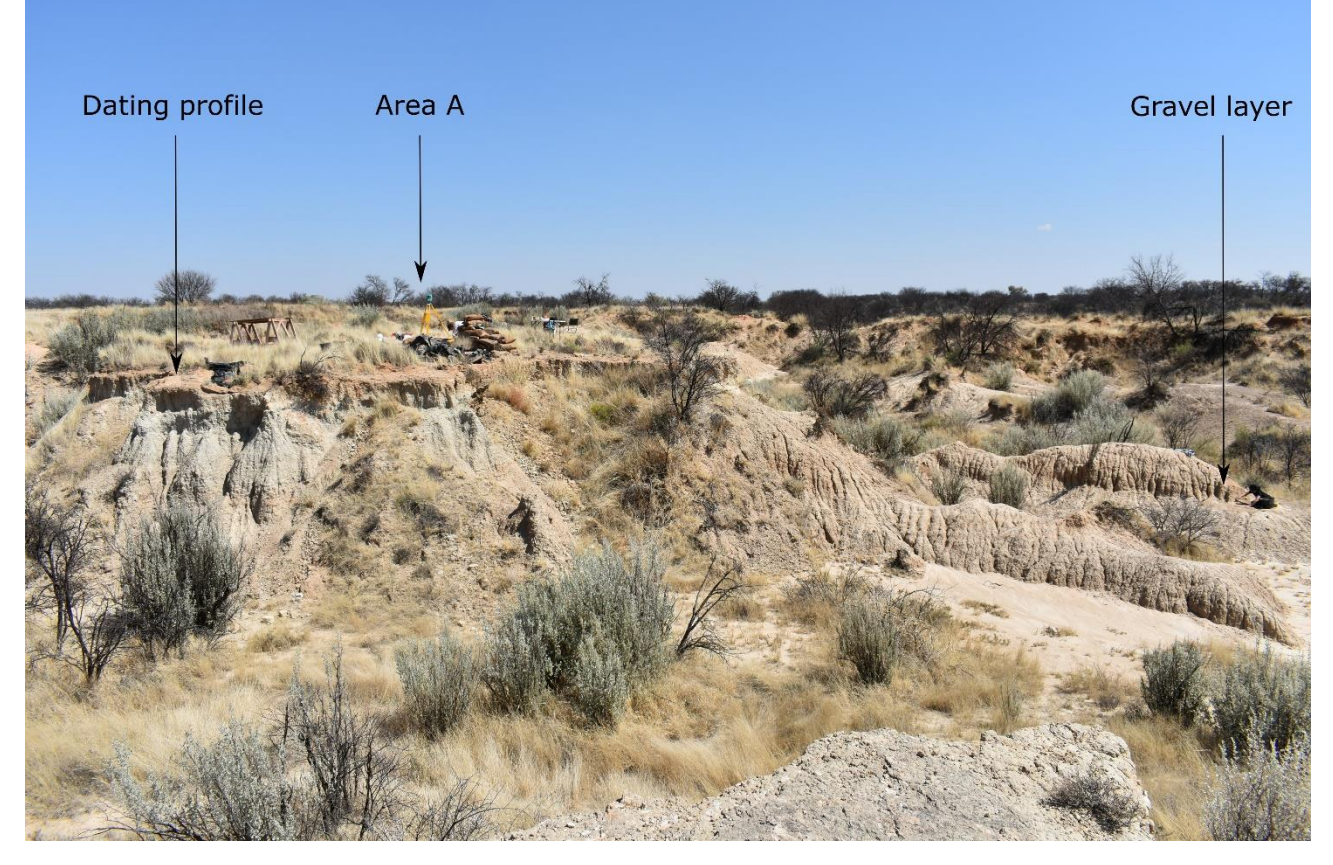
Figure 3. General view of the site, taken from the top of Area B.