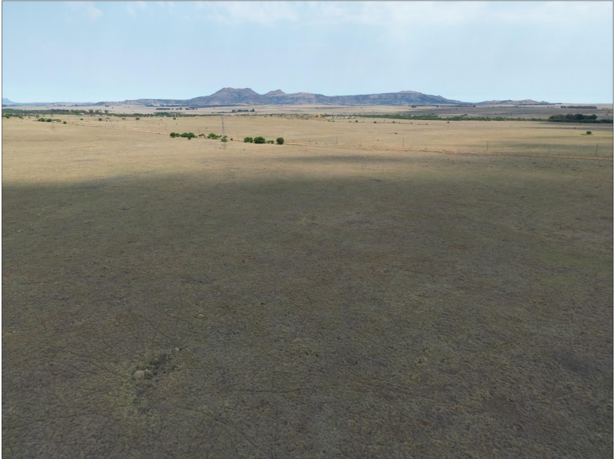
Plate 7: The site (taken towards the west).