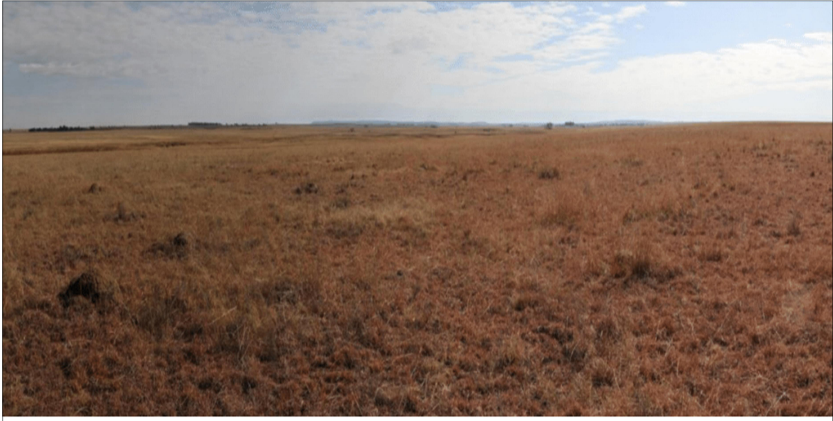
Plate 10: The low sandstone hill clearly differs from the surrounding habitats and will likely contain elements of high conservation value

Lengana Solar Power Plant (RF) (Pty) Ltd.