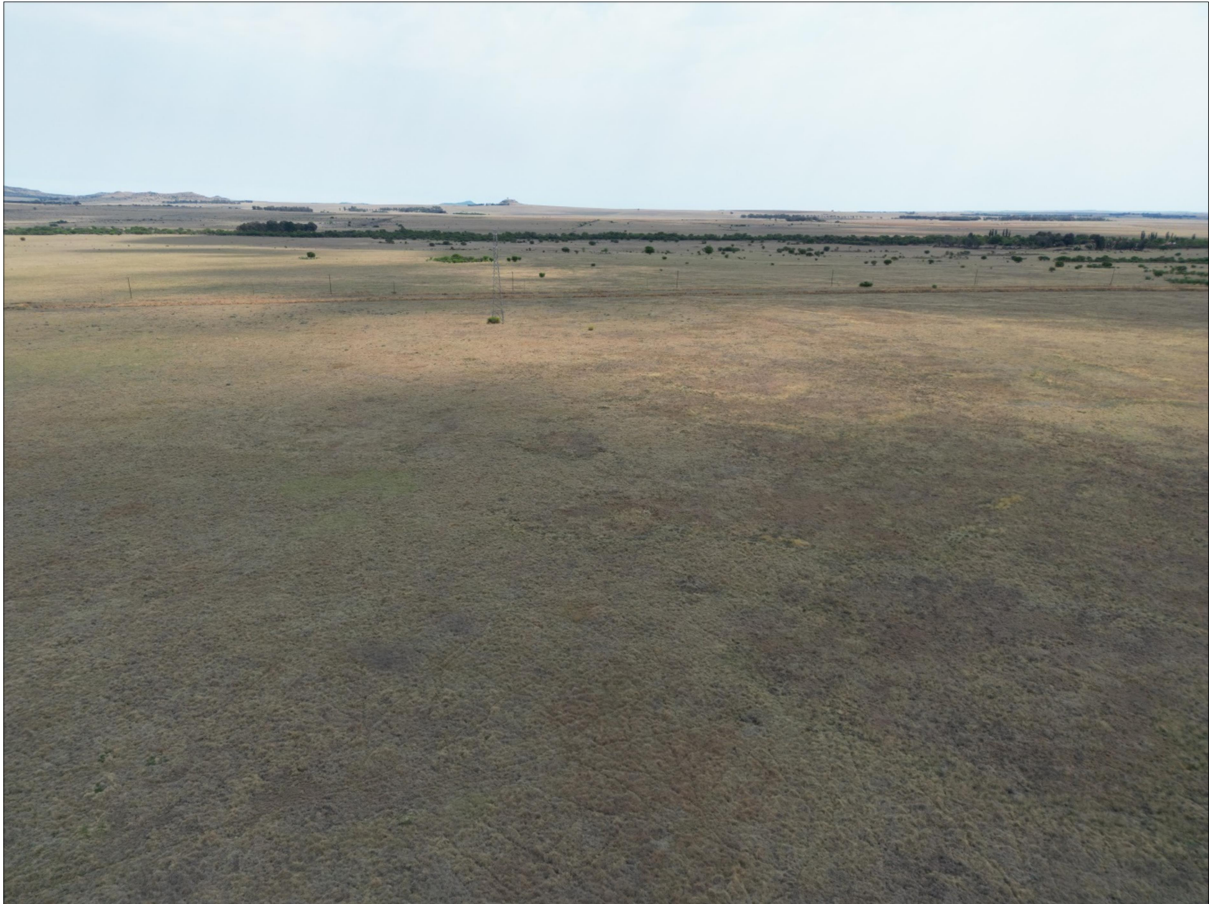
Plate 8: The site (taken towards the north west).