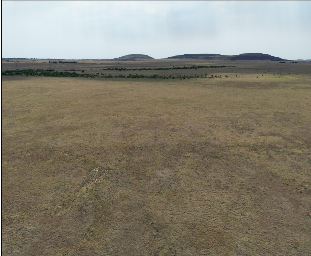
Plate 1: The site (taken towards the north)