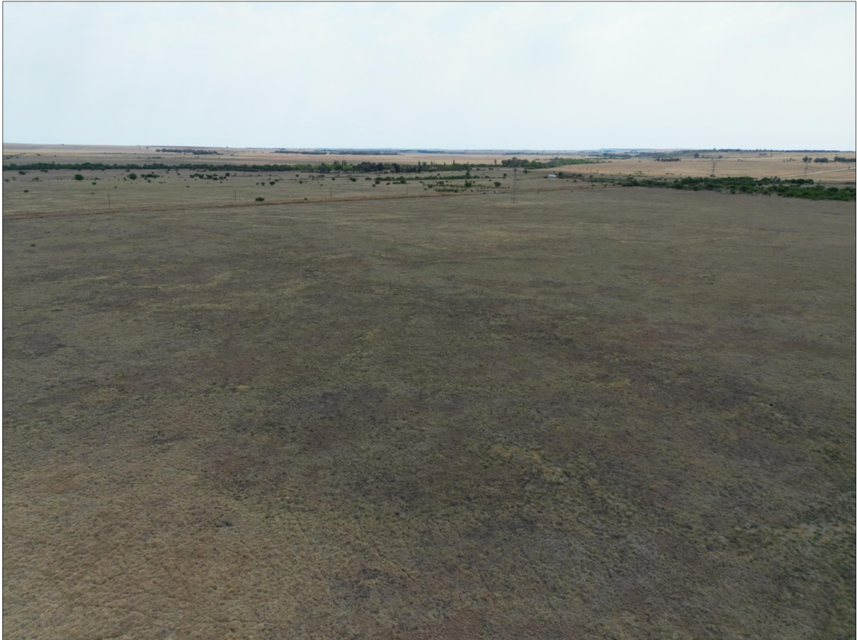
Plate 9: Significant portions of remaining natural grassland are dominated by a dense grass layer and though it only has a moderate diversity, is still in a relatively good condition.