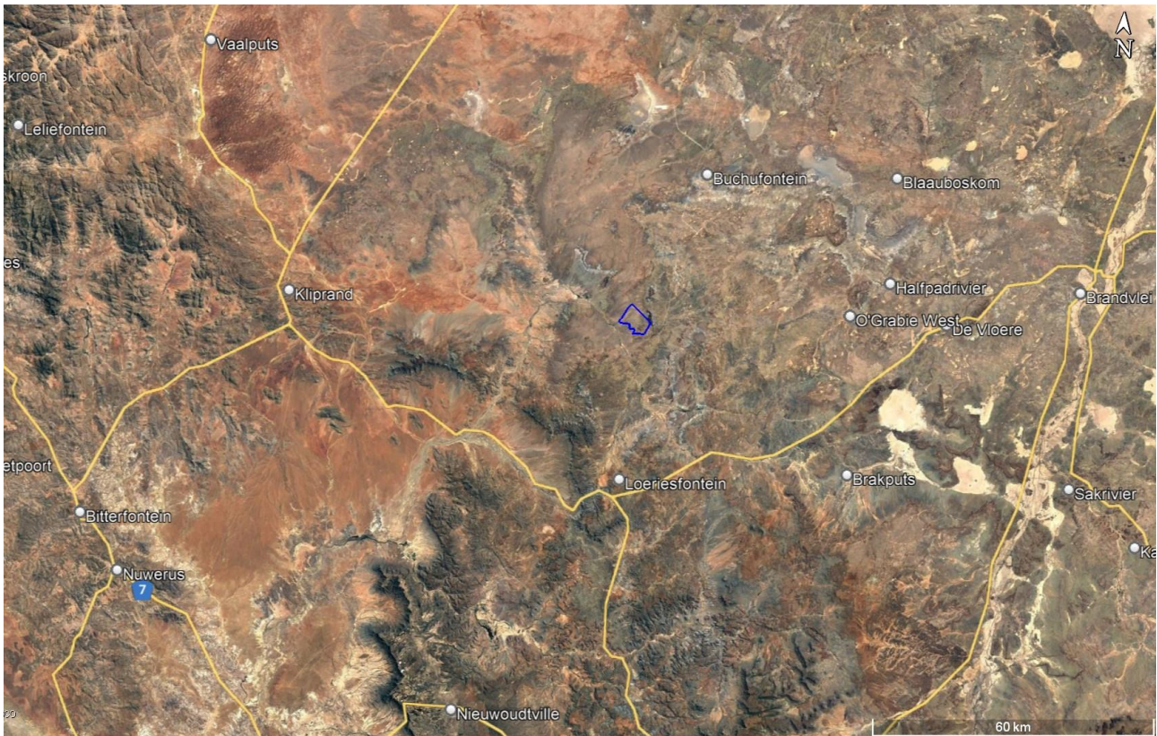
Figure 1. Locality map of the site boundary of the proposed SEF (dark blue outline) north of the town of Loeriesfontein.

Environmental authorisation is being sought for the proposed construction and operation of the Lesaka 1 Solar Energy Facility (SEF) near Loeriesfontein in the Northern Cape Province (see location in Figure 1). In terms of the National Environmental Management Act (Act No 107 of 1998 - NEMA), an application for environmental authorisation requires an agricultural assessment. In this case, based on the verified low sensitivity of the site (see Section 7), the level of agricultural assessment required is an Agricultural Compliance Statement.