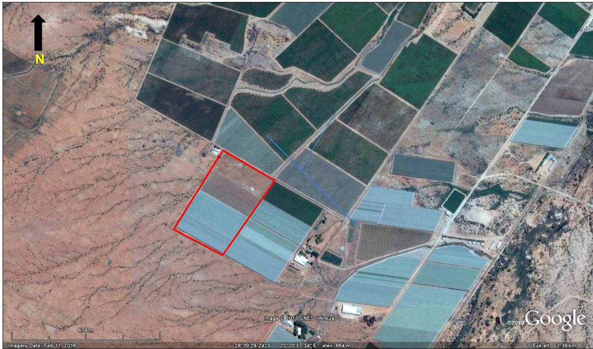
Figure 1. Orange Falls Farm 16/13. Red polygon illustrates the Section24G Application area