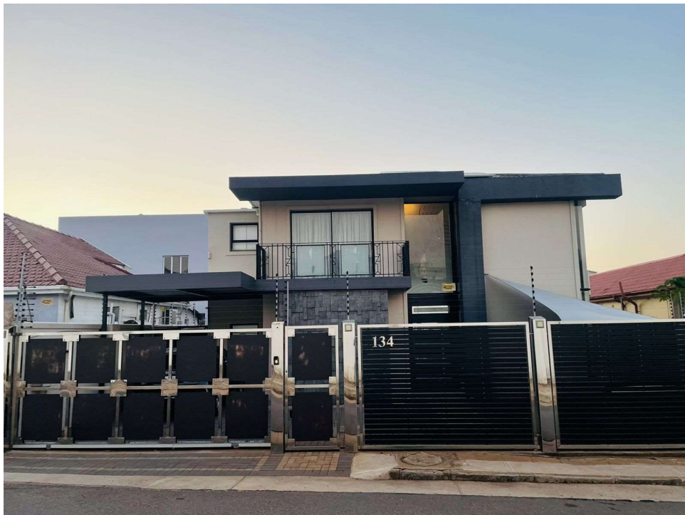
134 JUNIPER ROAD – PHOTOGRAPHIC PICTURE FROM ROAD