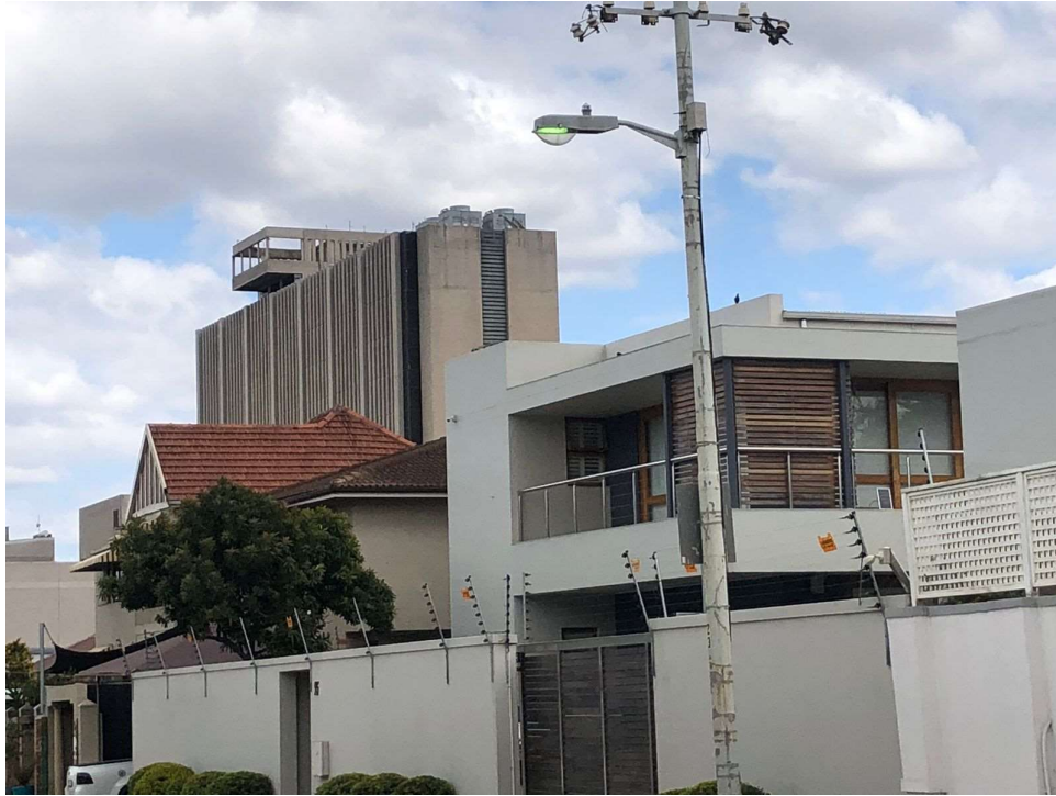
95 JUNIPER ROAD – PHOTOGRAPHIC PICTURE FROM ROAD