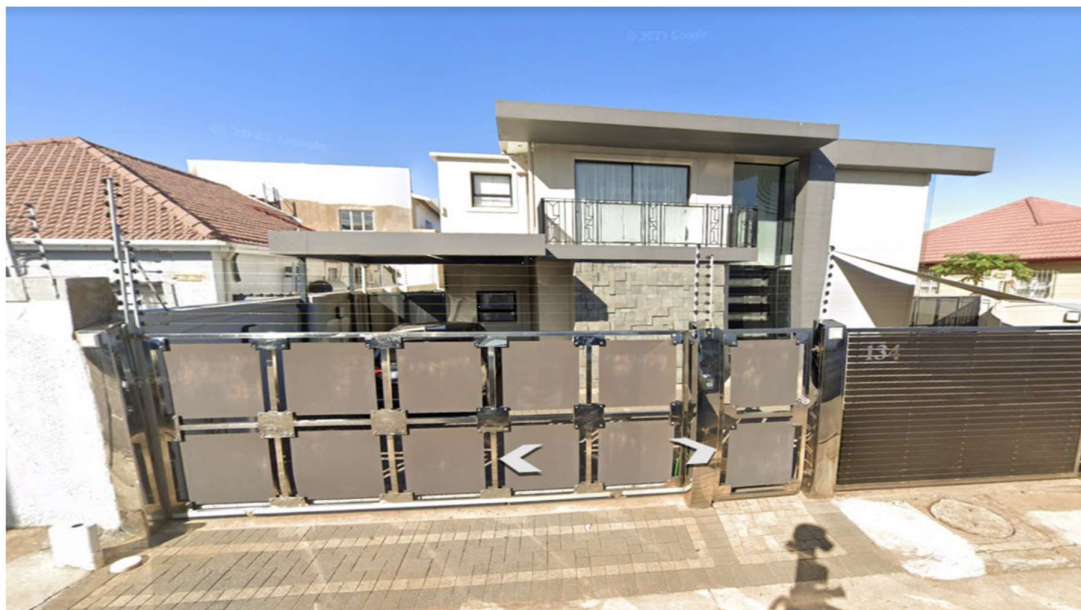
134 JUNIPER ROAD – GIS PICTURE