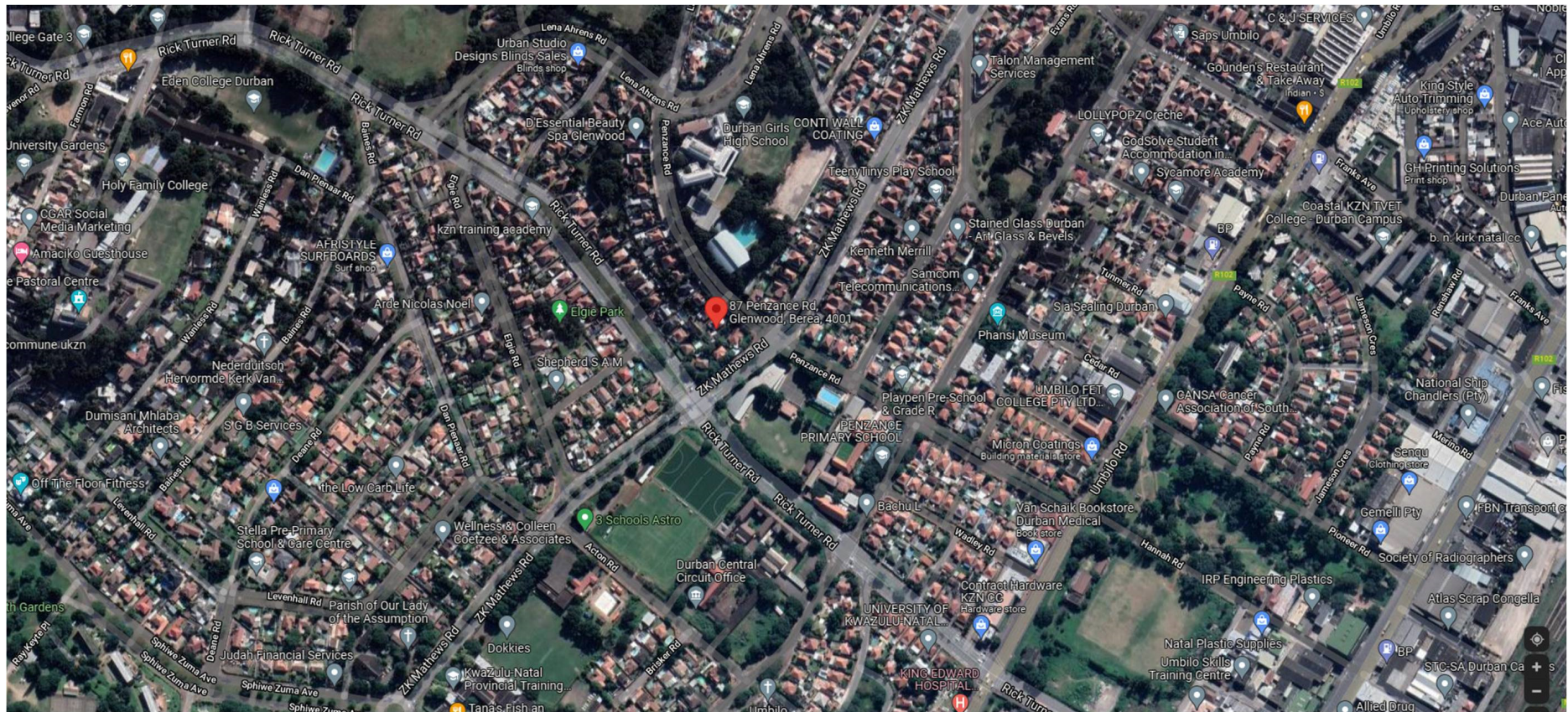
87 PENZANCE ROAD, GLENWOOD – AMAFA APPLICATION 29/11/2021