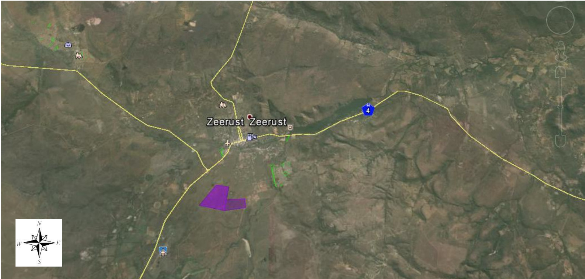
Locality Map No 2: Location of the Site (Purple Area B and Area C)