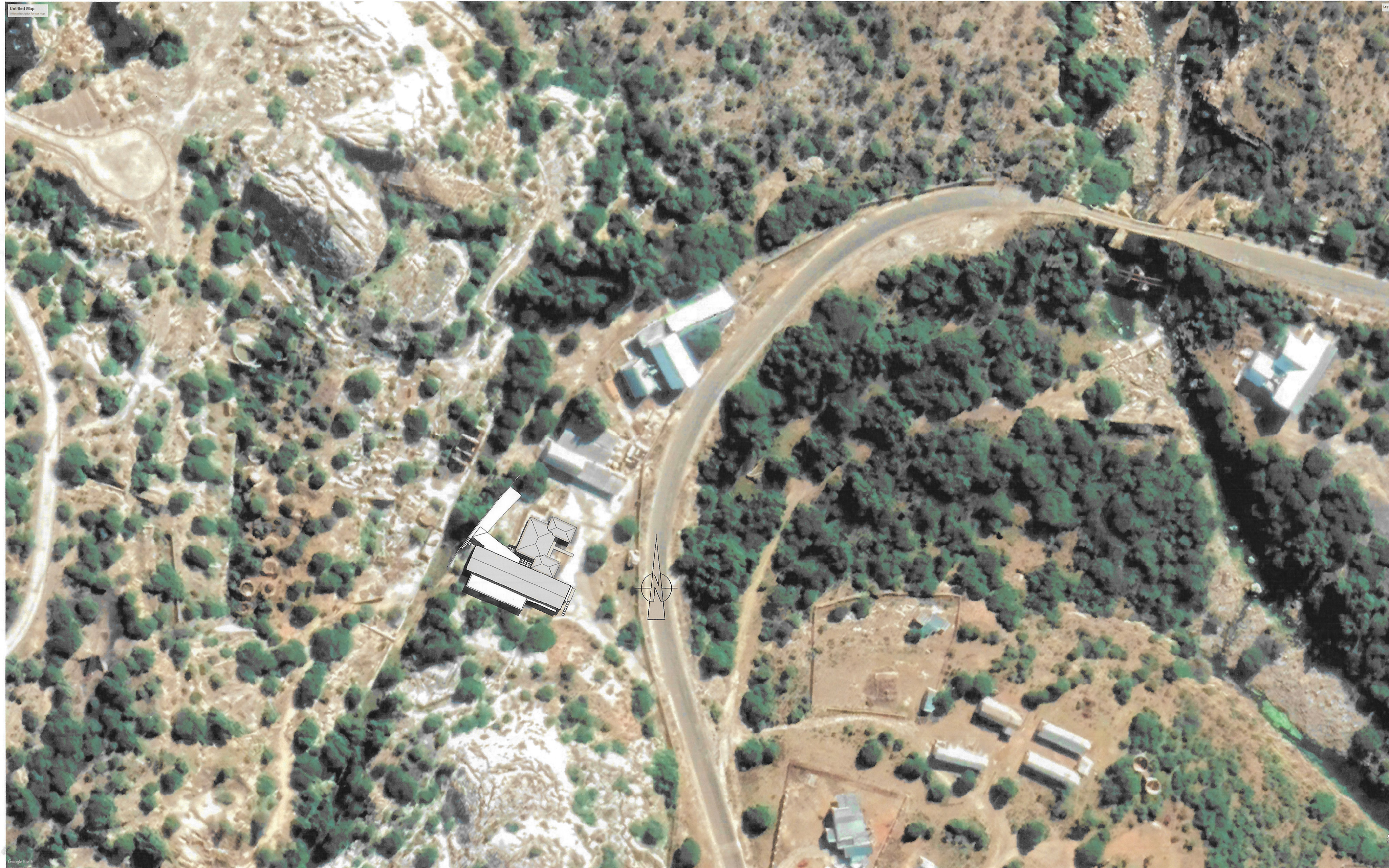
C_100 - Location Plan