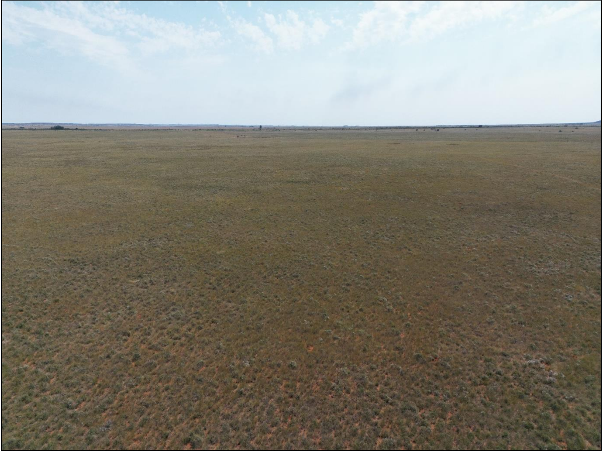
Plate 1: The site (taken towards the north)