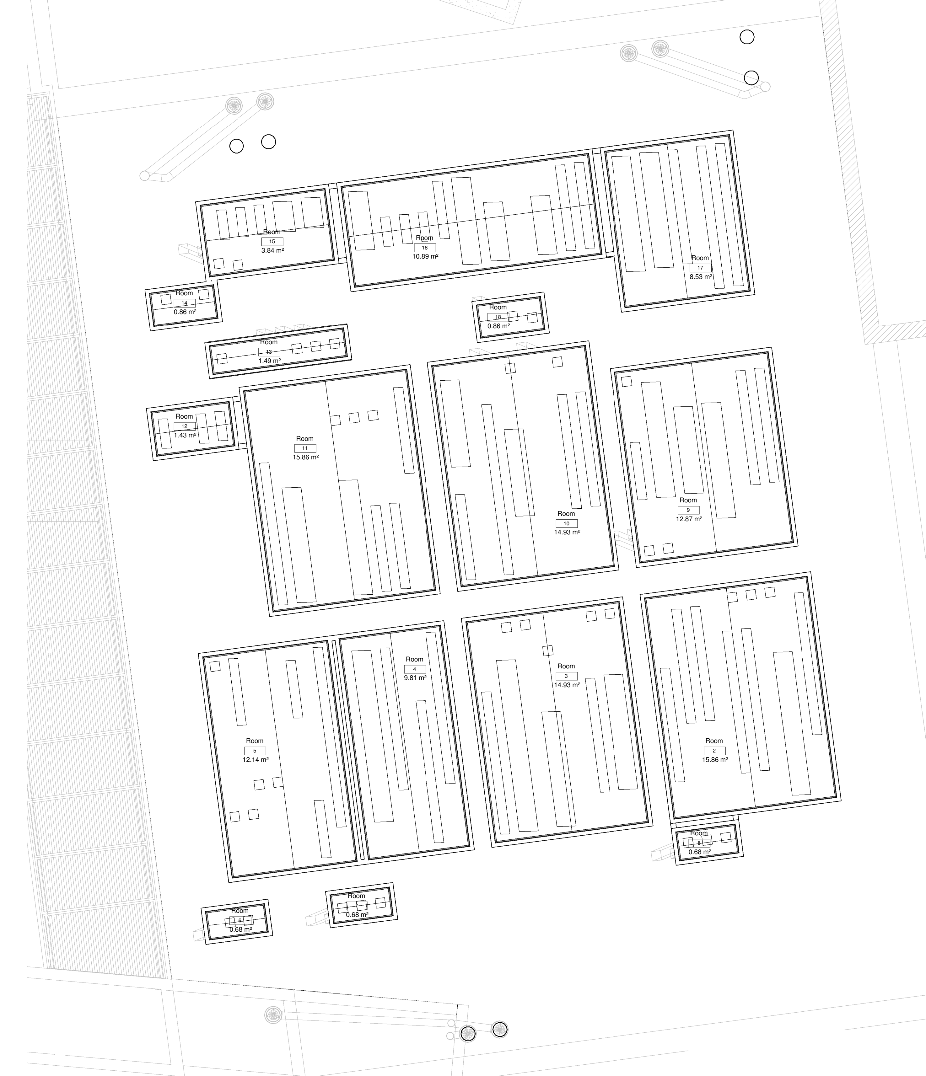
Roof Plan - Skylights Entrance Foyer FR6

Lightweight cellular concrete to fall of edge of box gutter