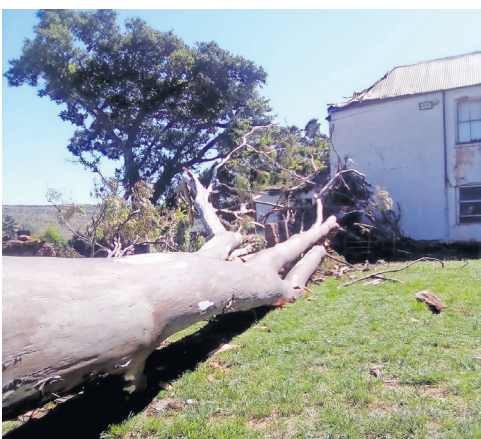
The massive tree that fell onto the Ntuli's family home.