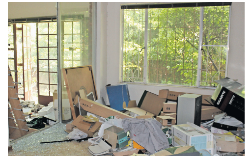
The house in Gholfsig was looted and vandalised by vagrants.