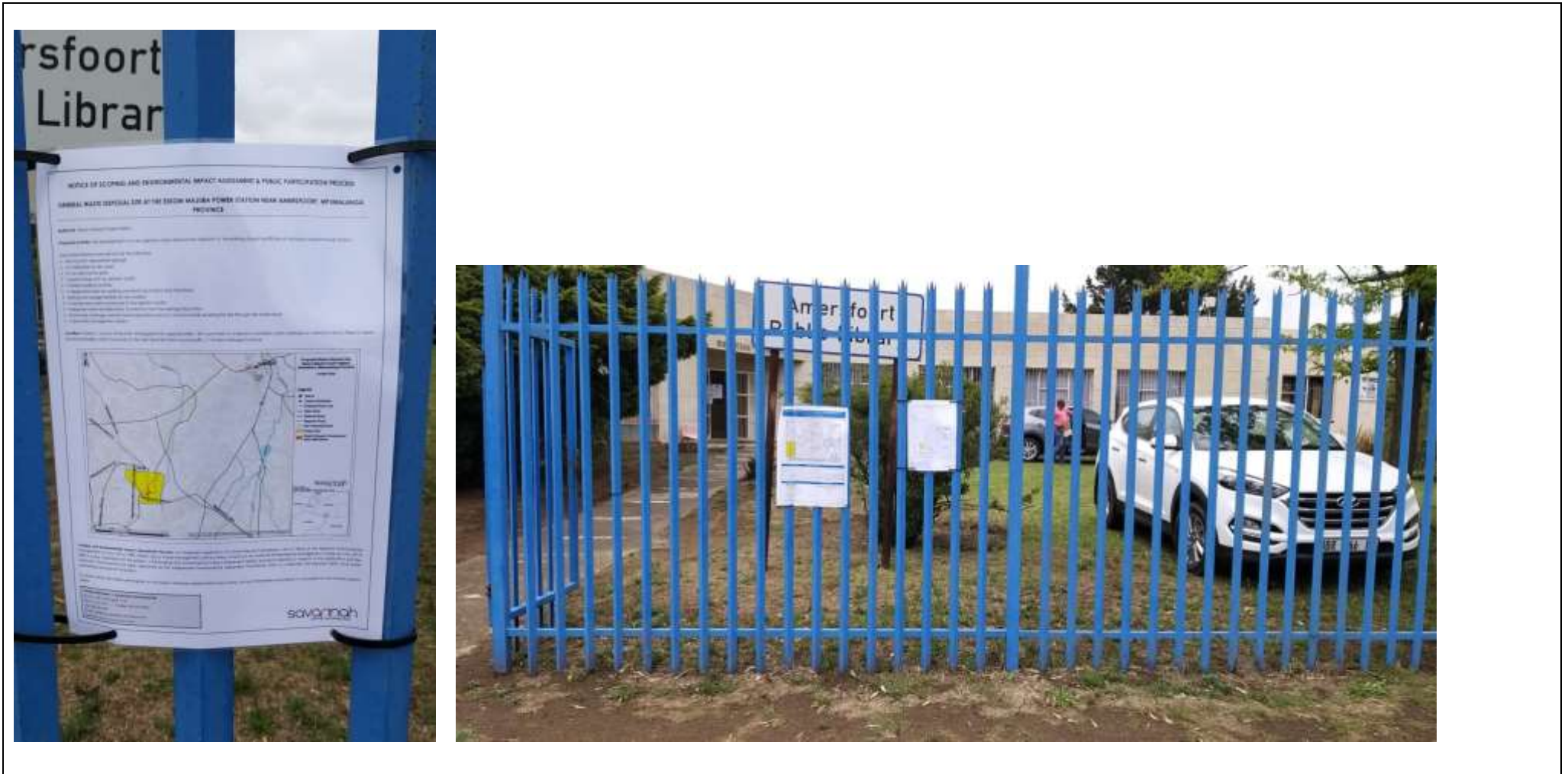
Co-ordinates: 27°00'24.0"S ; 29°52'10.8"E Placed at Amersfoort Public Library