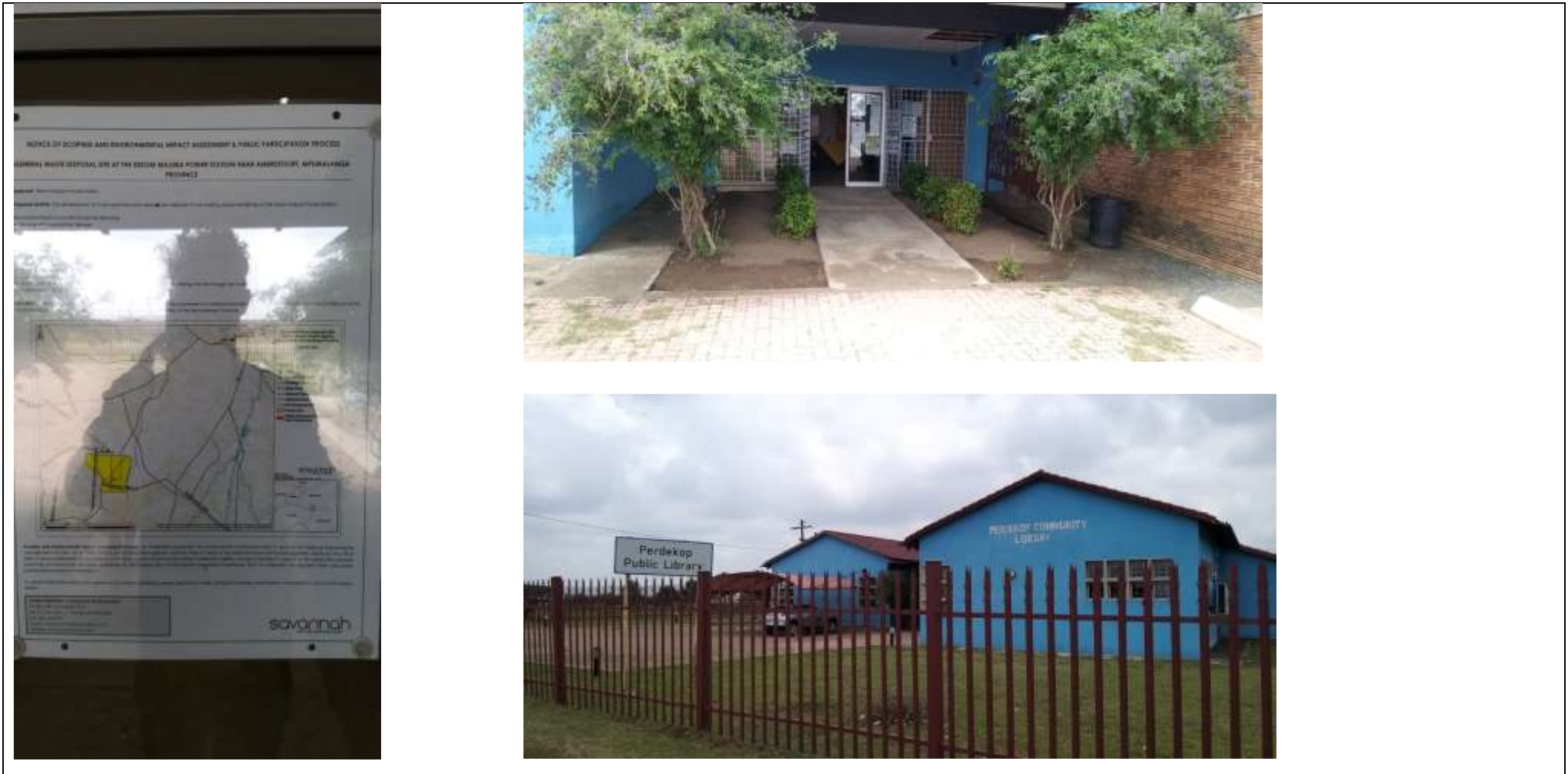
Co-ordinates: 27°09'40.7"S ; 29°37'36.4"E Placed at Perdekop Public Library