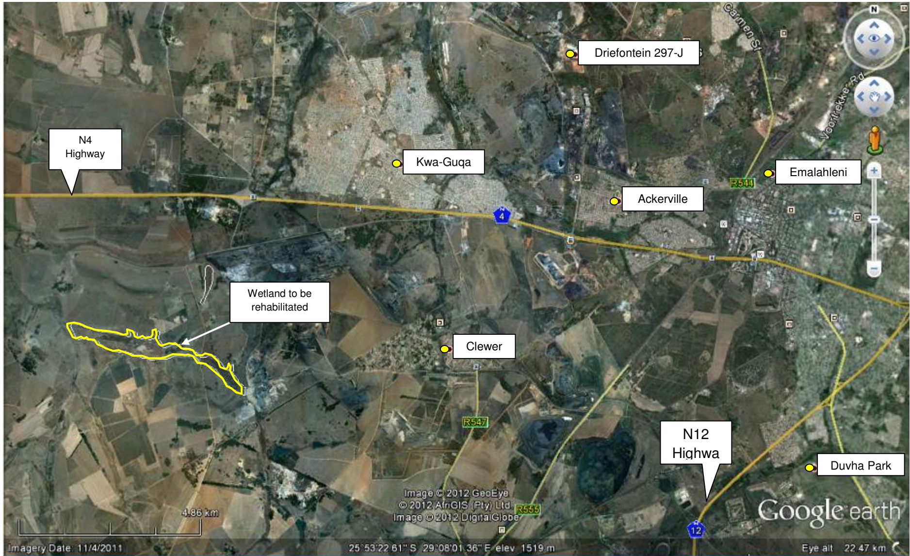
Figure 2: Aerial map showing the location of the wetland and the surrounding areas.