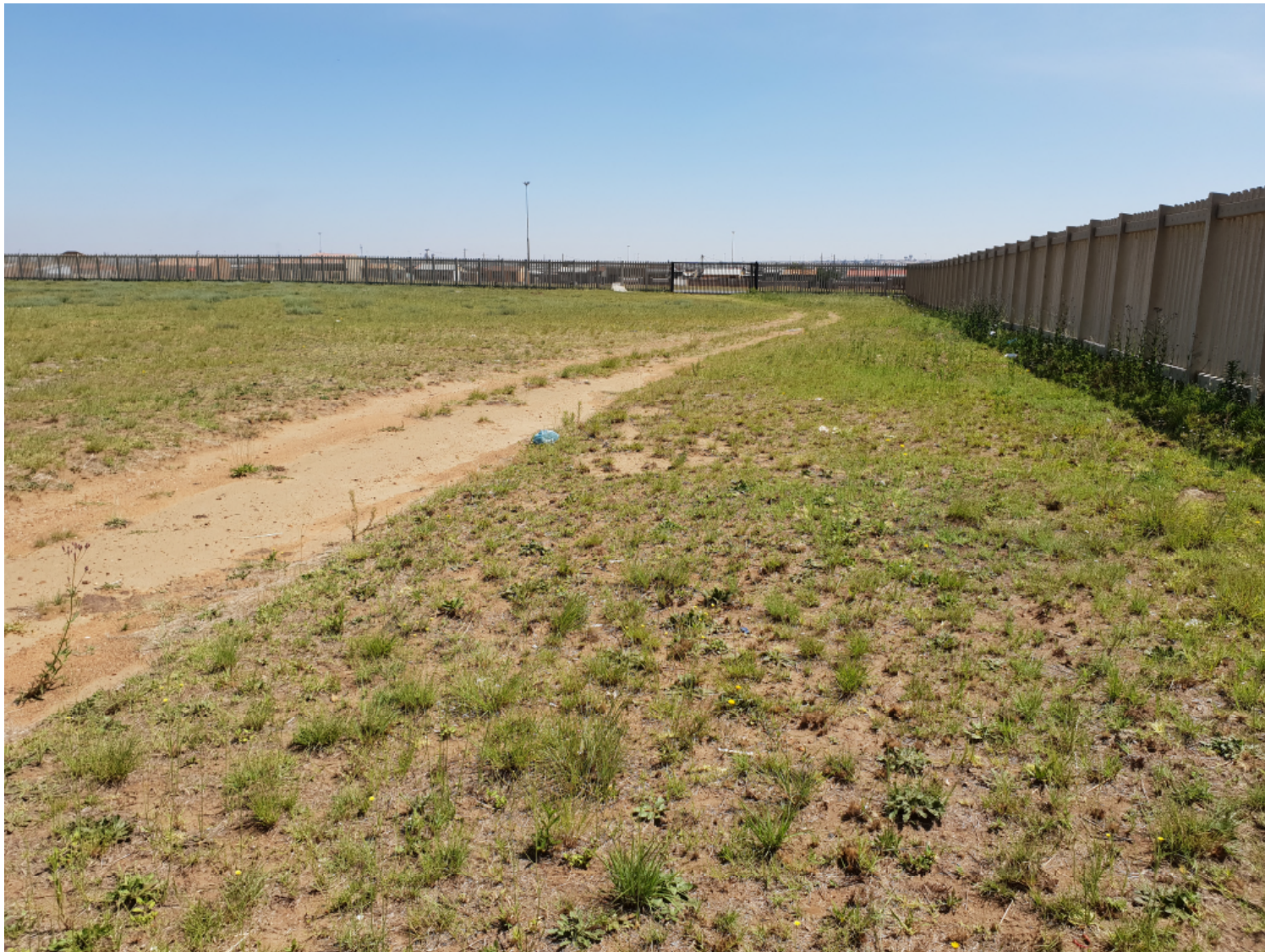
Figure 1: Photograph of the existing access road within the project site