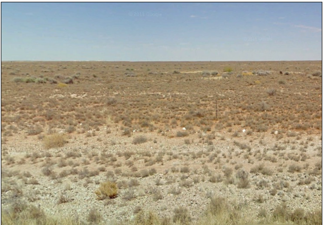
Figure 1: Typical vegetation of the study area, as observed from a nearby property.

Google Earth provides historical aerial imagery that can be used to evaluate changes in a landscape over time. For the current site, detailed imagery is available as far back as 2006. Examples for the site from various dates going back in time are shown in Figure 2. At the time that the original ecological assessment was undertaken, imagery from Google Earth shows that the site was in a natural state, with no obvious impacts. The vegetation appears from the imagery to be sparse with underlying topography and drainage showing through strongly. This pattern extends in all directions and for some distance away from the site. The relative uniformity of the area is confirmed from these images.