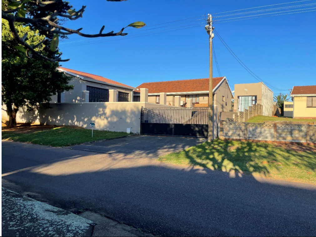
Existing adjacent Dwelling

I hope you find all the above in order and to our favor.