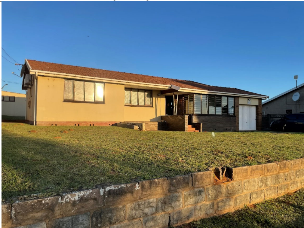
Existing Dwelling 169 Hillhead Road