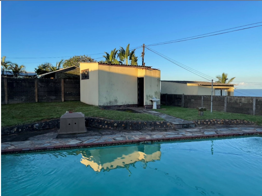
Existing out Building