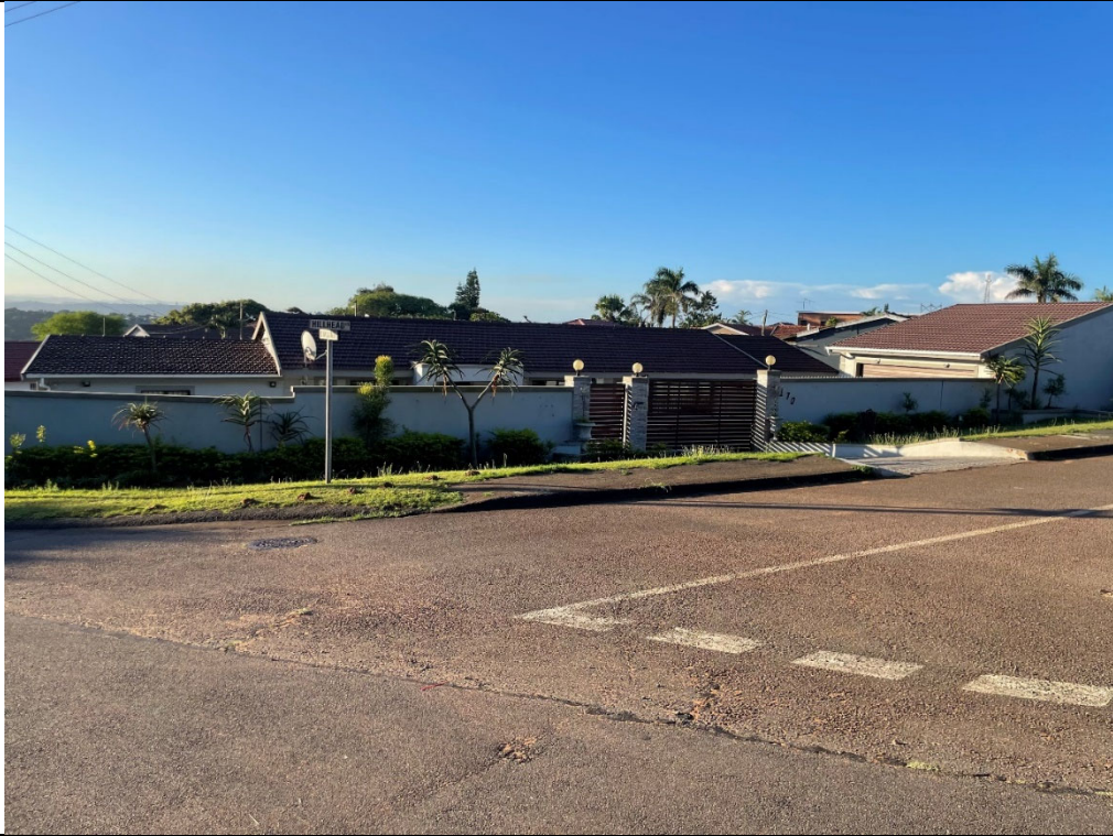
Existing adjacent Dwelling