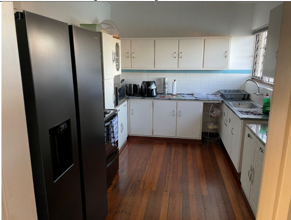
Existing Internal Dwelling 169 Hillhead Road