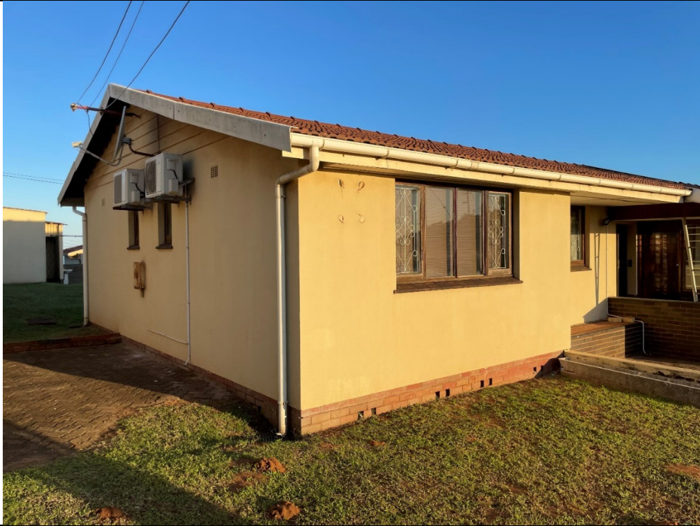
Existing Dwelling 169 Hillhead Road