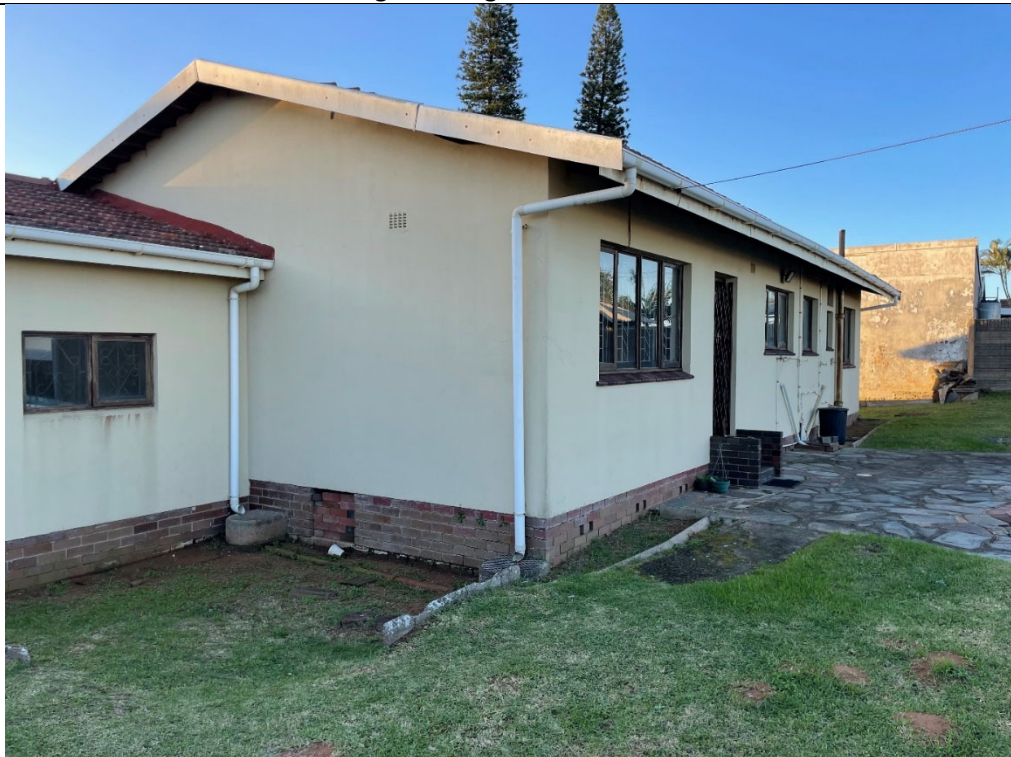
Existing Dwelling 169 Hillhead Road