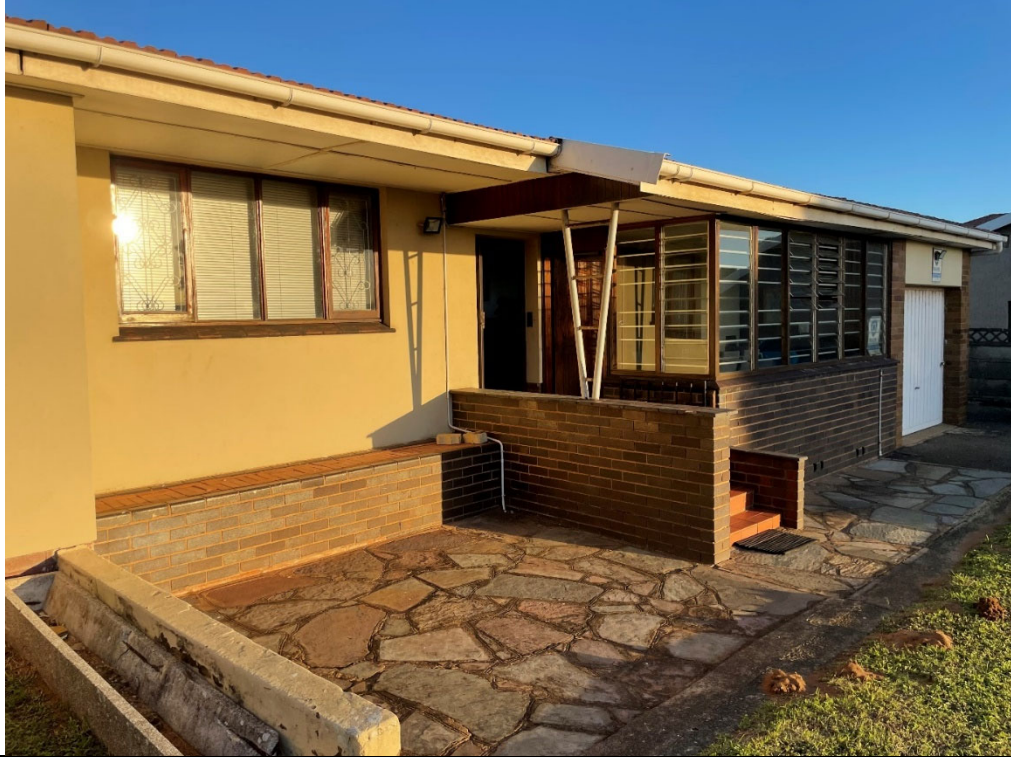
Existing Dwelling 169 Hillhead Road