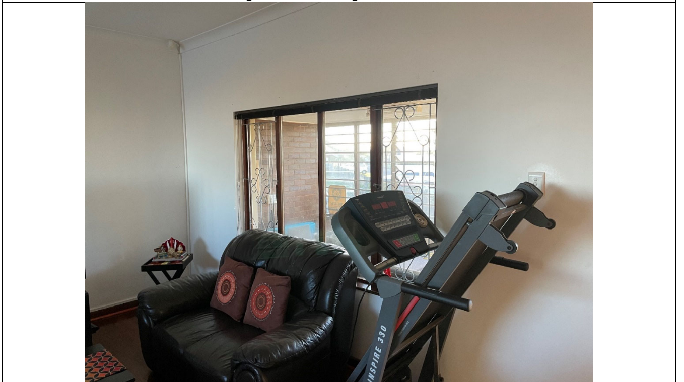
Existing Internal Dwelling 169 Hillhead Road