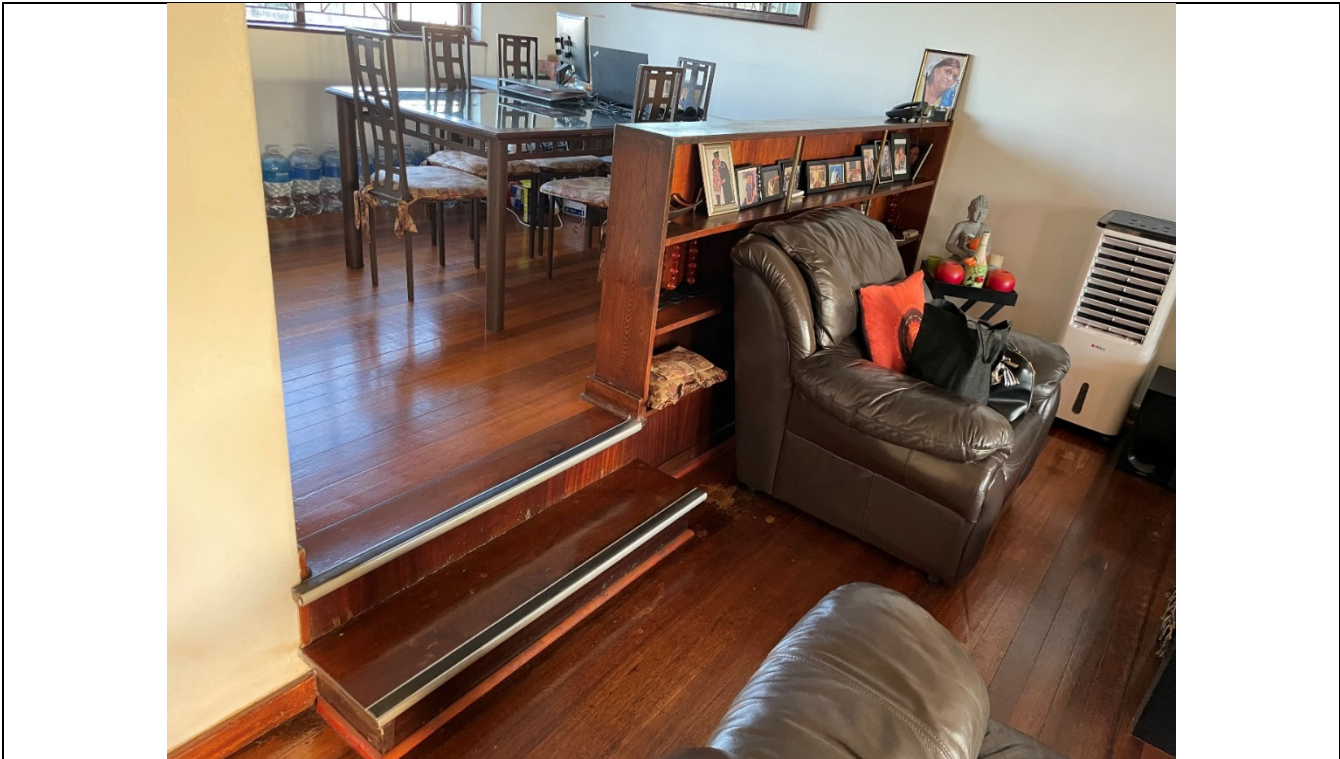
Existing Internal Dwelling 169 Hillhead Road

HEREWITH PICTURES BELOW FOR THE APPLICATION SITE AND ADJACENT PROPERTIES.