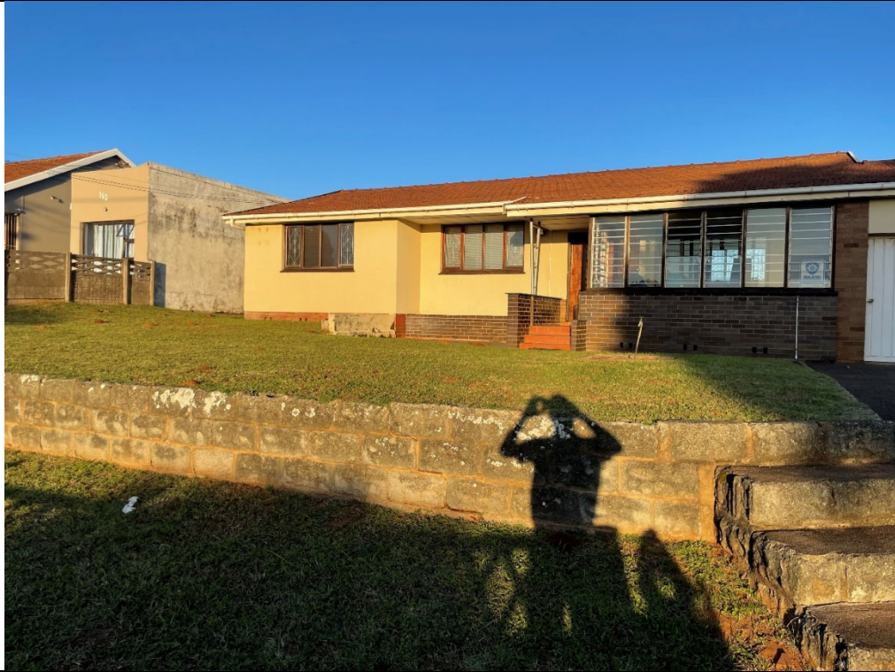
Existing Dwelling 169 Hillhead Road