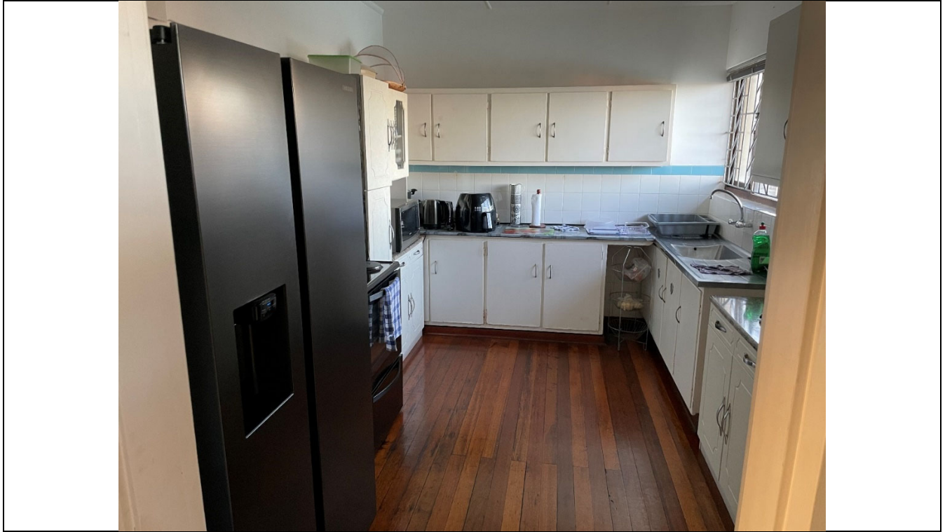
Existing Internal Dwelling 169 Hillhead Road