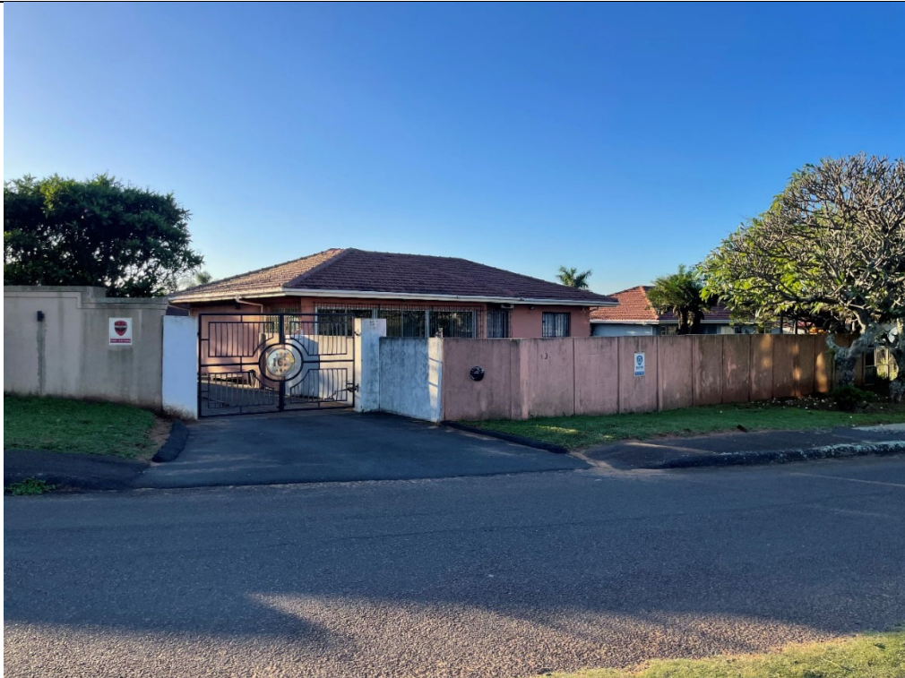
Existing adjacent Dwelling