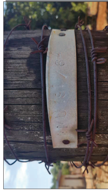
Closest 3-Phase Eskom Pole – MMU 191 / 64