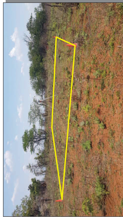
New Vodacom Site Position