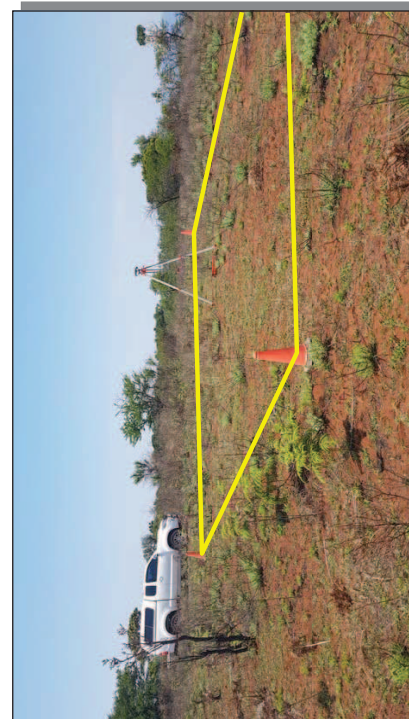
New Vodacom Site Position