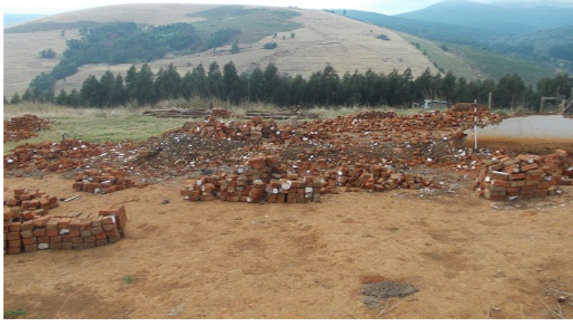
Fig 2. Remains of the old NG church.