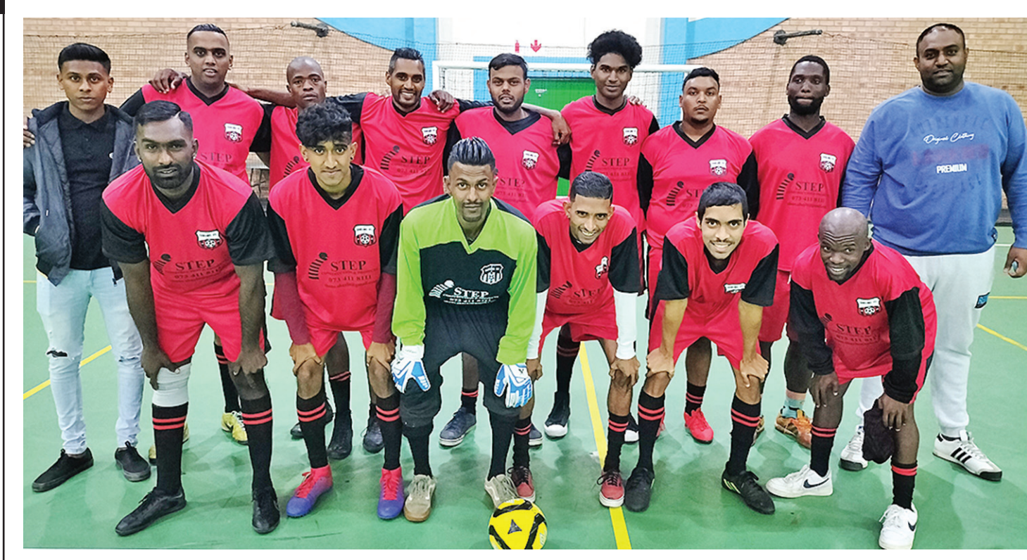
The Chelms FC team need to bounce back soon to have any hopes of clinching the league title.

For All Your Legal Notices Email: legalrs@dbn.caxton.co.za Contact: 084 887 8695