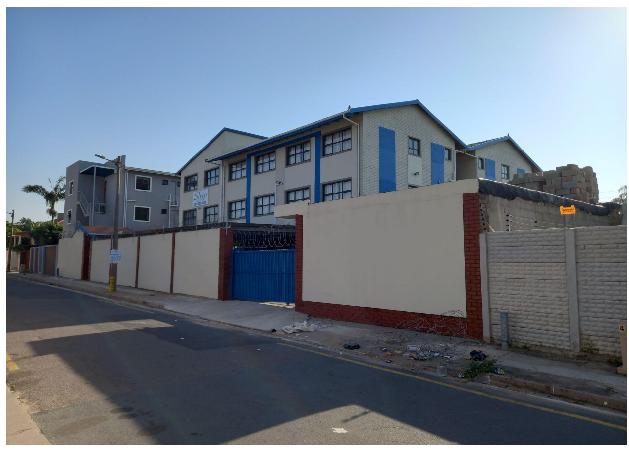
TWO TRIPLE STOREY DEVELOPMENTS FOUR PROPERTIES AWAY FROM 32 CHESTNUT ROAD