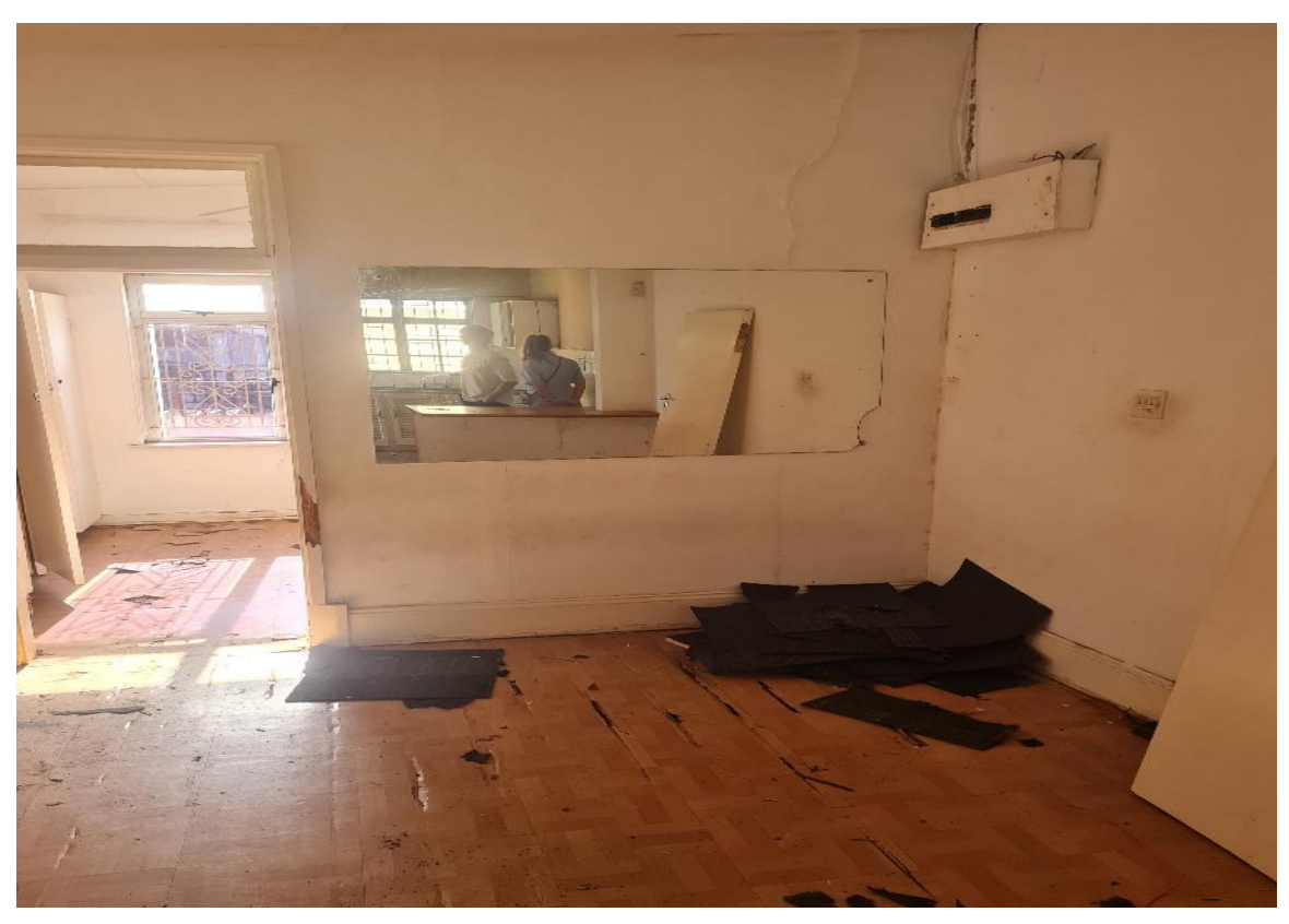
DINING ROOM TO KITCHEN