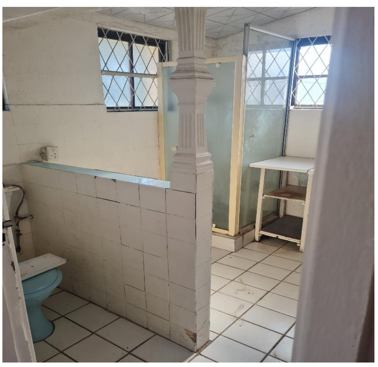
ENSUITE OFF MAIN BEDROOM