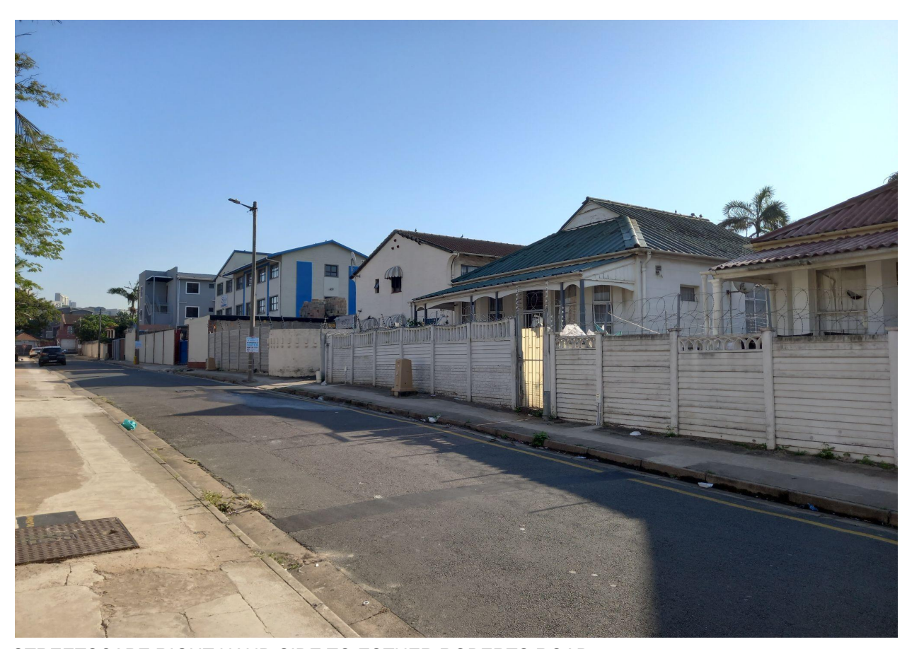
STREETSCAPE RIGHT HAND SIDE TO ESTHER ROBERTS ROAD