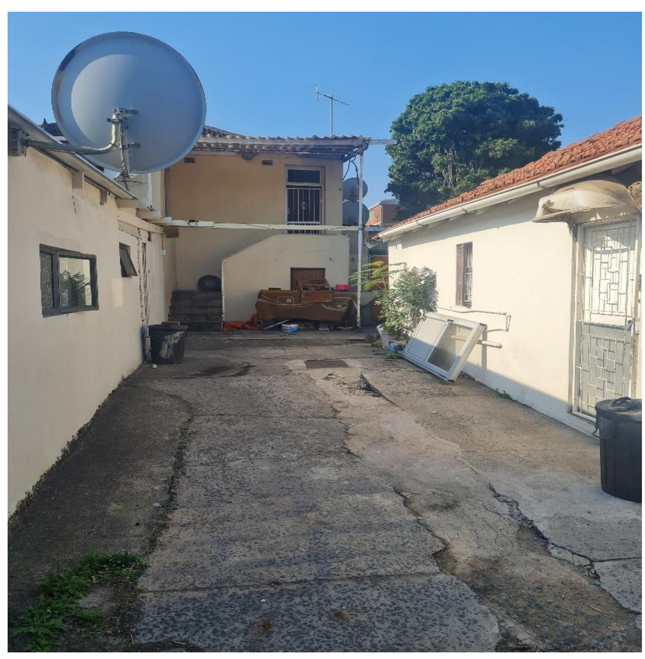
REAR ELEVATION OF MAIN DWELLING AND OUTBUILDING