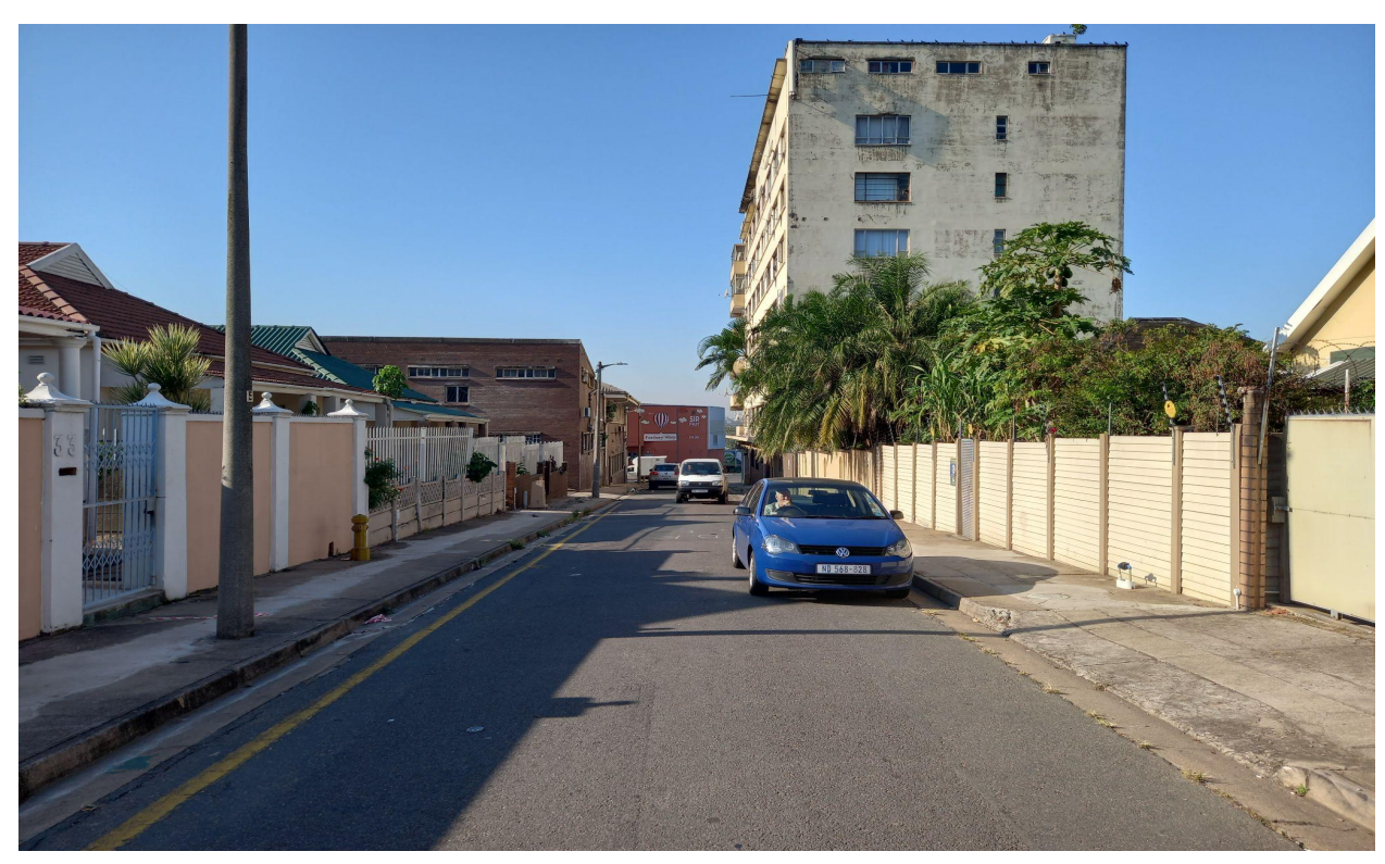
MULTI STOREY BUILDING TOWARDS UMBILO ROAD 2 PROPERTIES AWAY FROM OURS