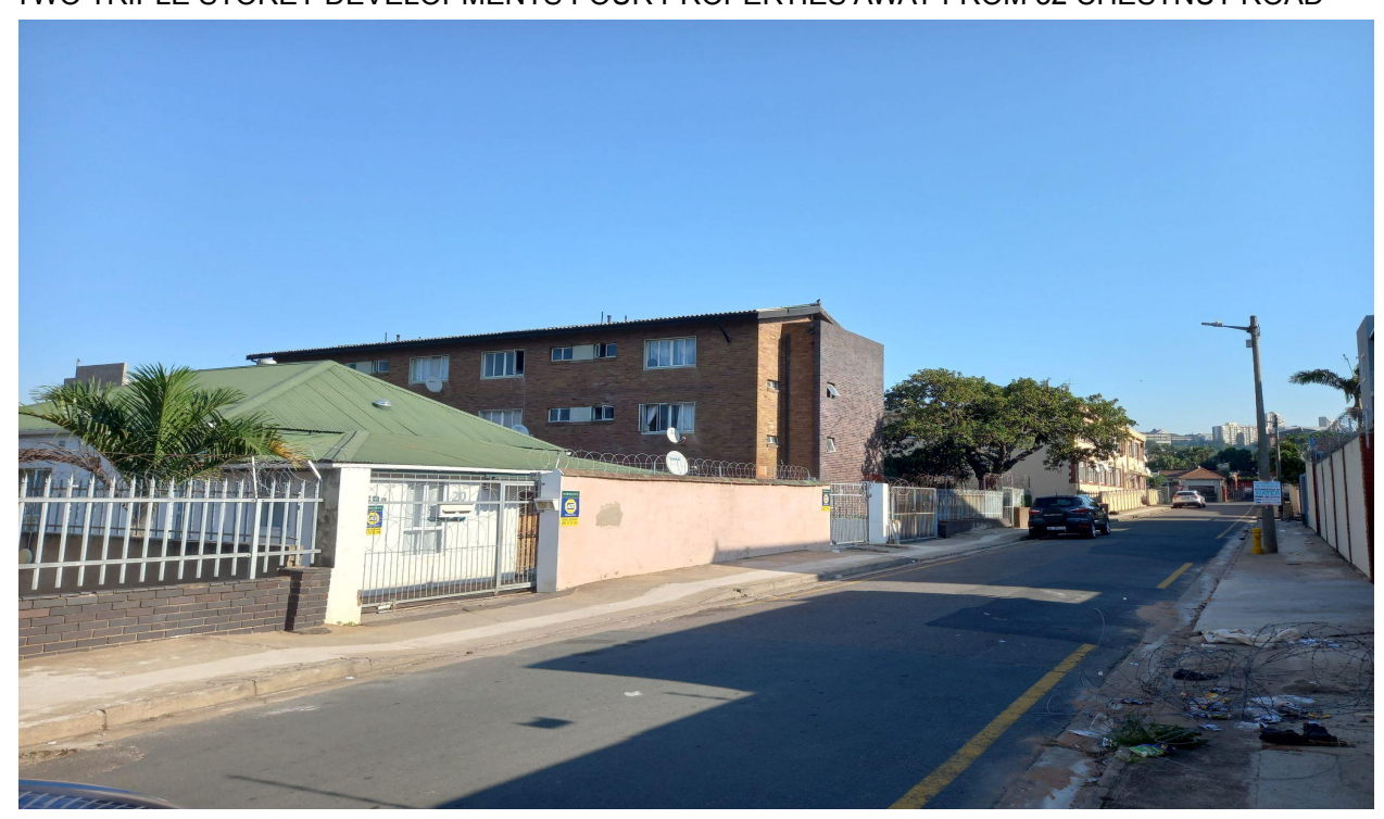
THREE STOREY BLOCK OF FLATS 3 PROPERTIES AWAY FROM OURS ON THE LEFT HAND SIDE