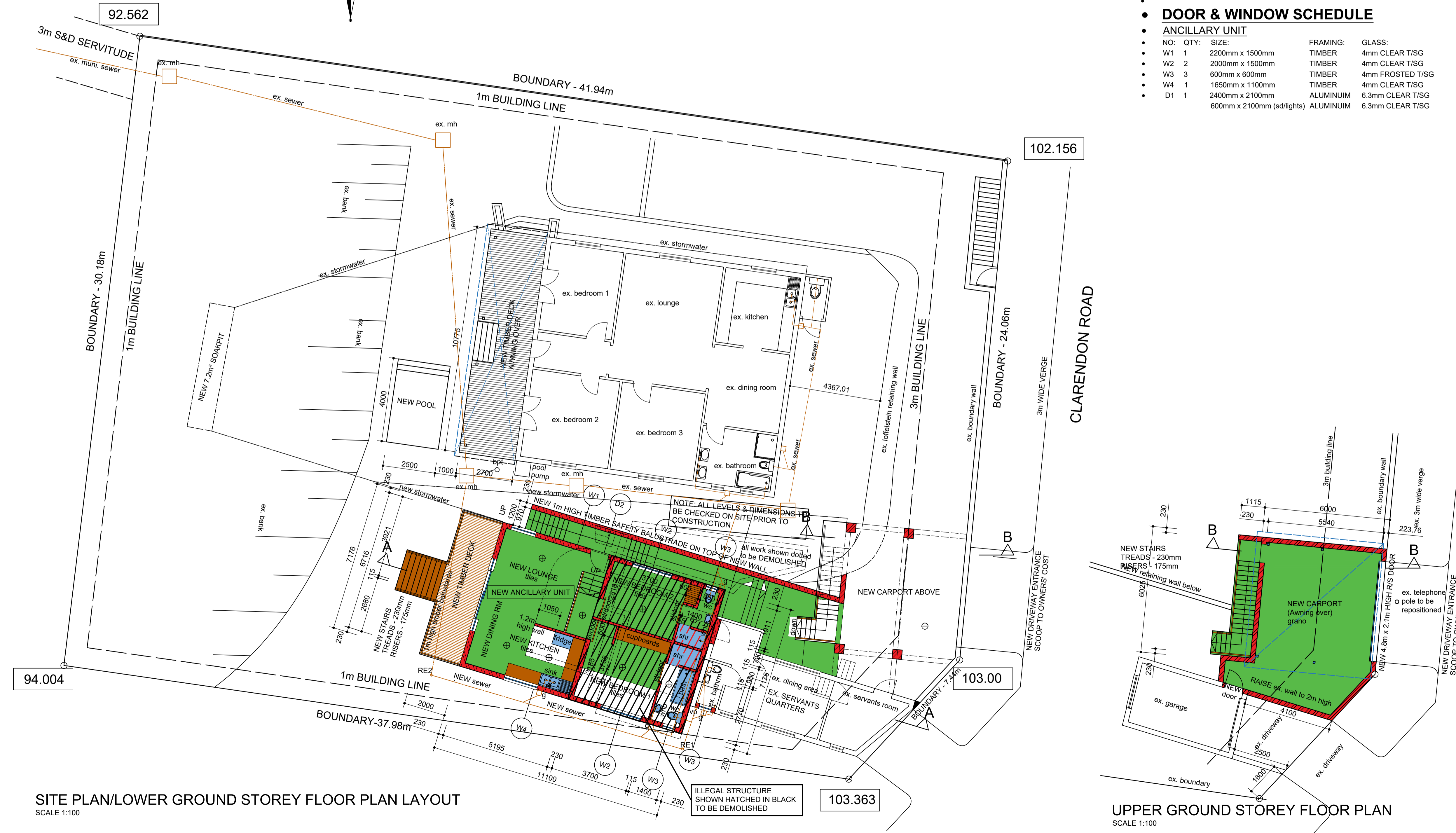
SITE PLAN/LOWER GROUND STOREY FLOOR PLAN LAYOUT SCALE 1:100