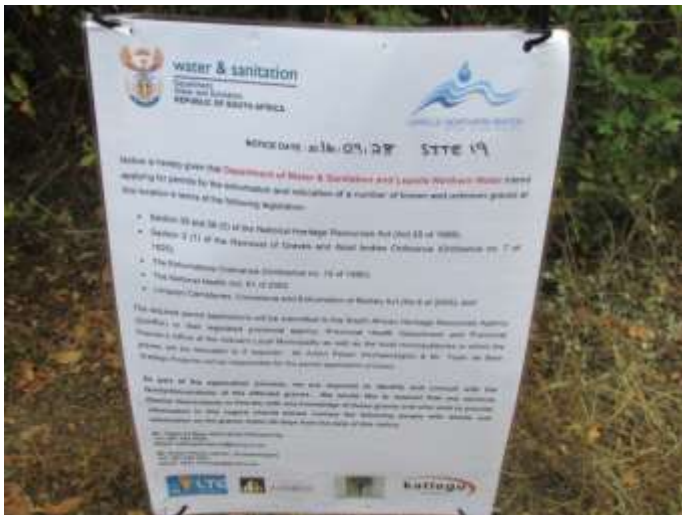
Site 19 Notice close-up