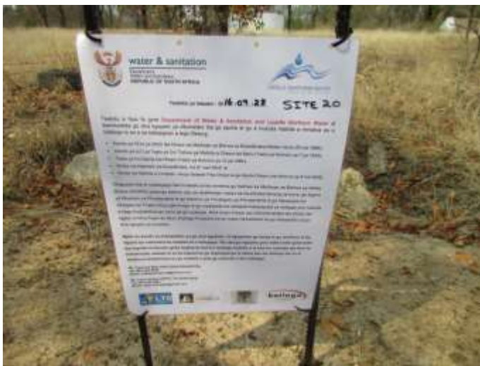
Site 20 close-up