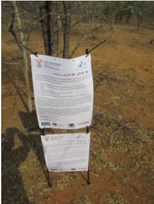
Site 24 close-up