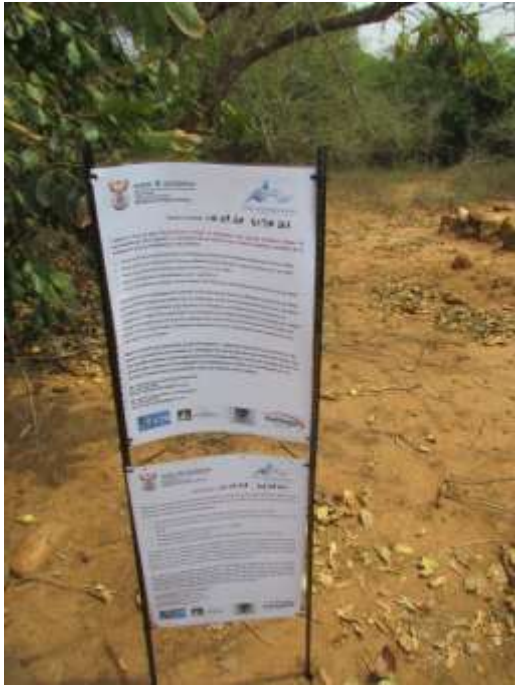
Site 21 close-up