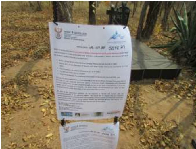
Site 27 close-up