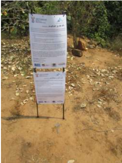
Site 22 close-up