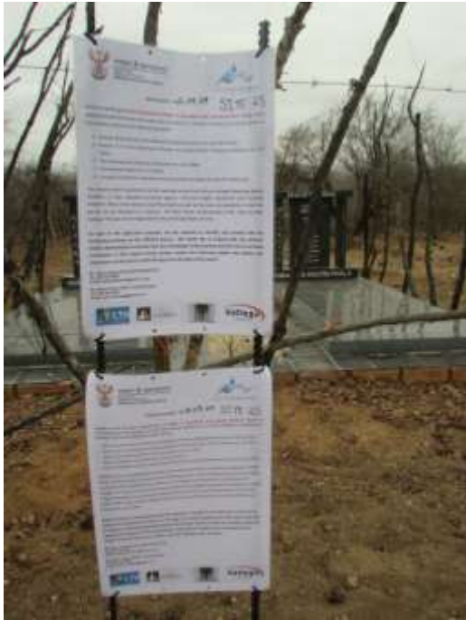
Site 25 close-up