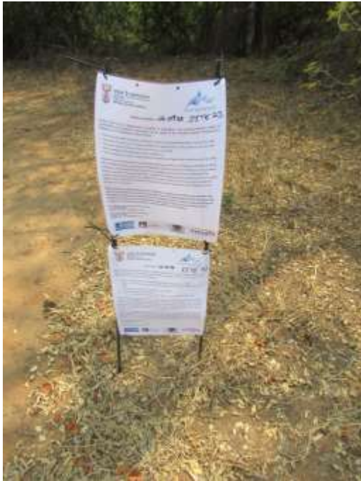
Site 23 close-up