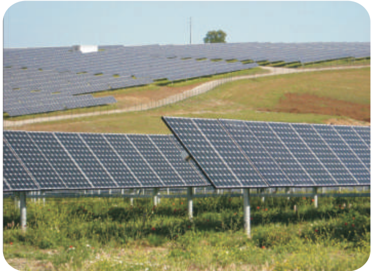
Figure 1: Illustration of a photovoltaic solar facility

The PV panels are designed to operate continuously for more than 20 years, unattended and with low maintenance.