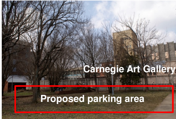
Image 20: View towards proposed parking area and Carnegie Art Gallery At Eastern side of site