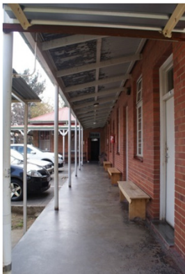
Image 5: Street View of Family Court Verandah (this part is a later addition).