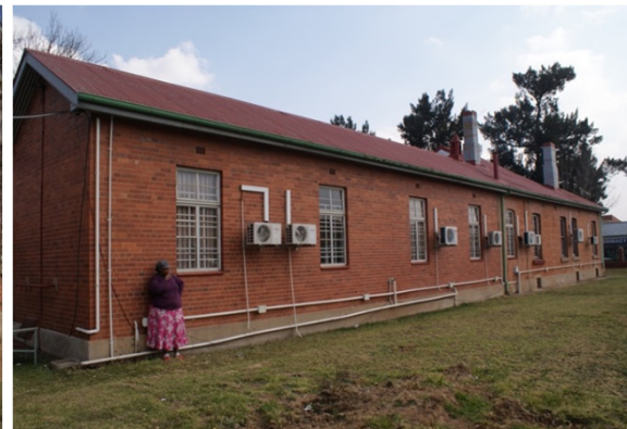
Image 7: Northern view of Family Court building – original building