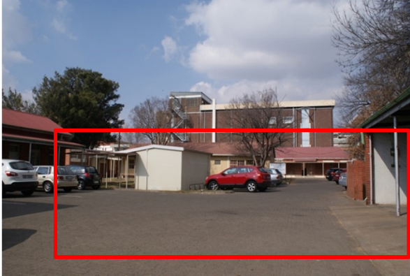
Image 16: Proposed area on site for new building – Note neighboring building at the back (3 to 4 storeys in height)