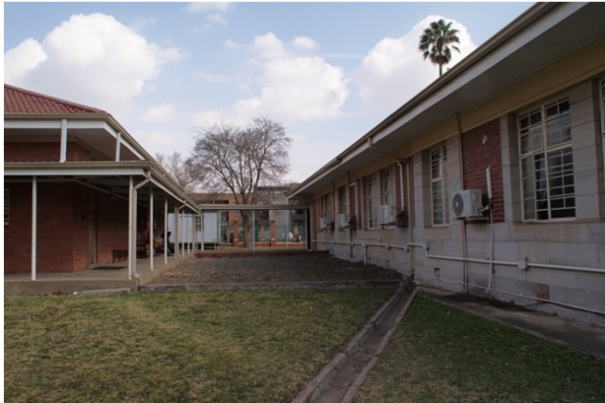
Image 13: North Eastern elevation of Magistrates Court and added Regional Court Building