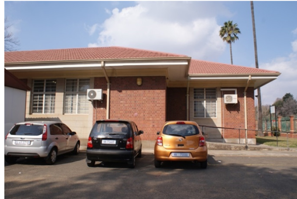
Image 14: View from parking area towards Magistrates Court – South Western view