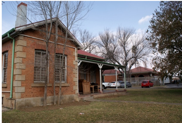
Image 19: View from Murchison street (main entrance) towards existing buildings