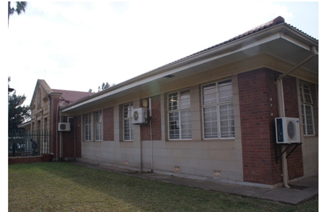
Image 12: South Easter Elevation – link between regional court building (later addition) and Magistrates Court