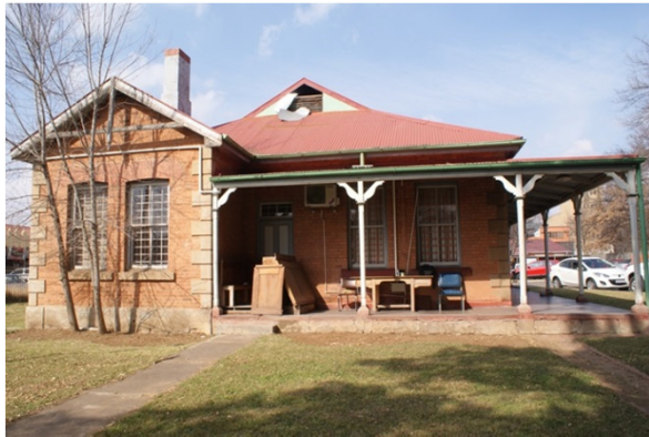
Image 2: Street view of existing Family Court (Old Police Station)