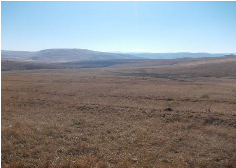
Fig 1. General view of proposed development area

General GPS co-ordinate: S30° 11' 39.8" E29° 50' 19.2"