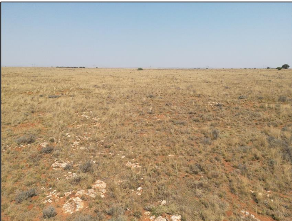
Figure 1.6: General conditions of the site