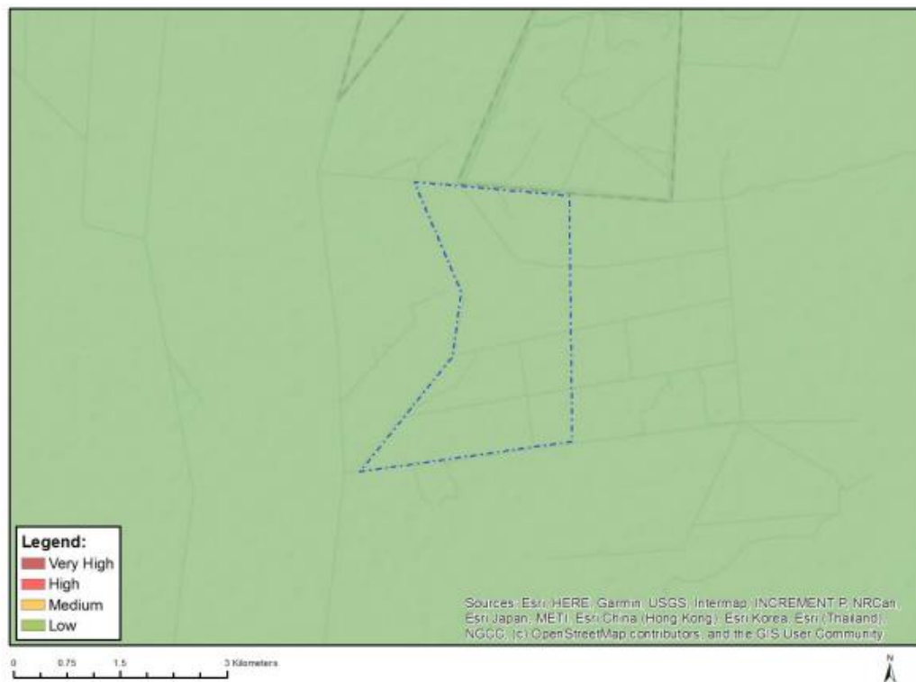
MAP OF RELATIVE CIVIL AVIATION (SOLAR PV) THEME SENSITIVITY

The site sensitivity is classified as low, and no major or other types of civil aviation aerodromes are present. Refer to Figure 1.1.