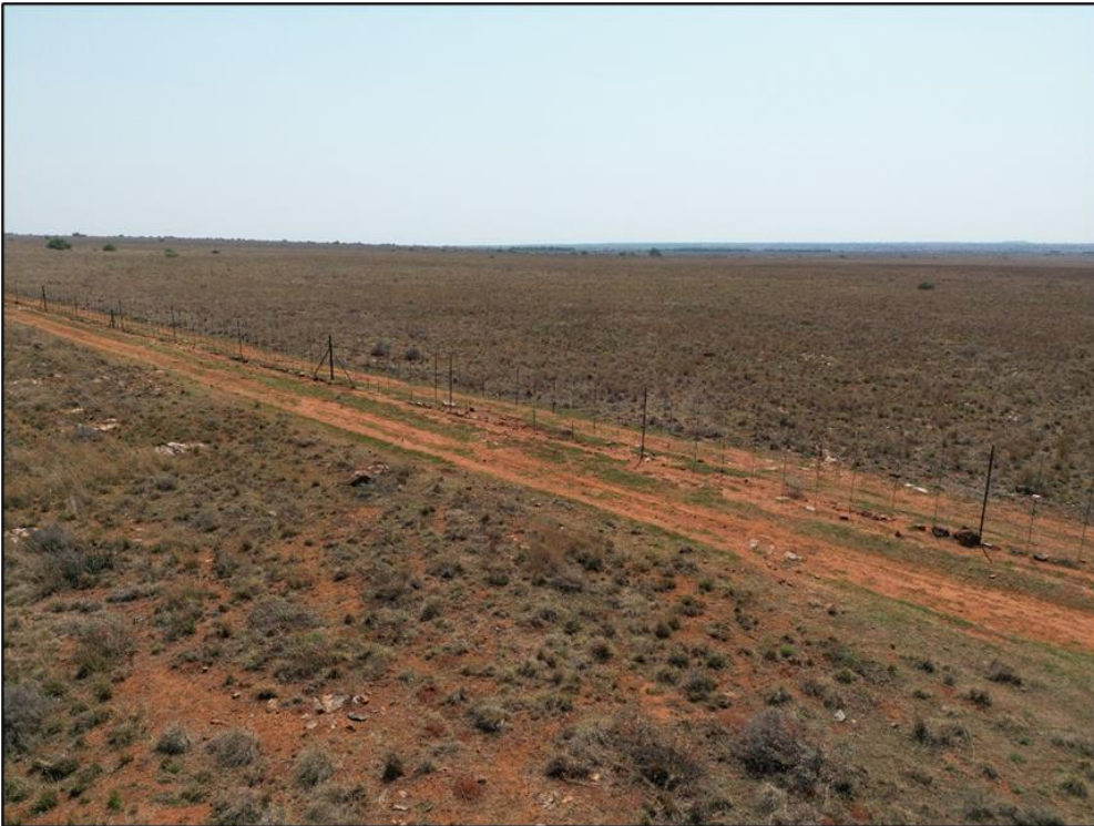
Figure 1.8: General conditions of the site