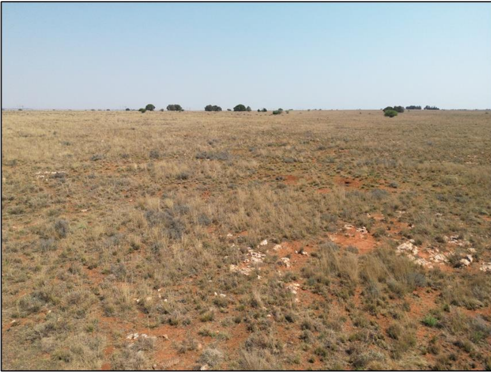
Figure 1.7: General conditions of the site