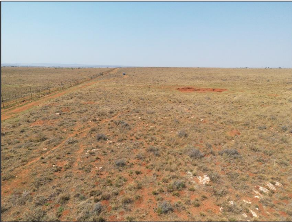
Figure 1.5: Aerial view of the centre of the site