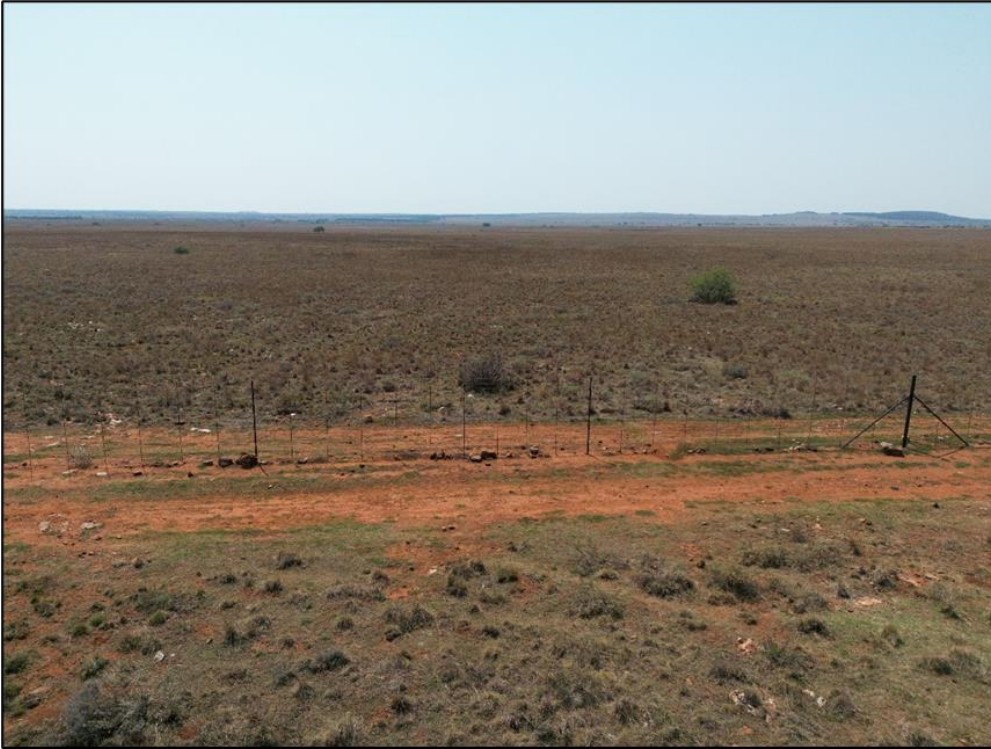
Figure 1.4: Aerial view of the centre of the site

Refer to Figures 1.4 – 1.8 for photographs of the site under assessment.