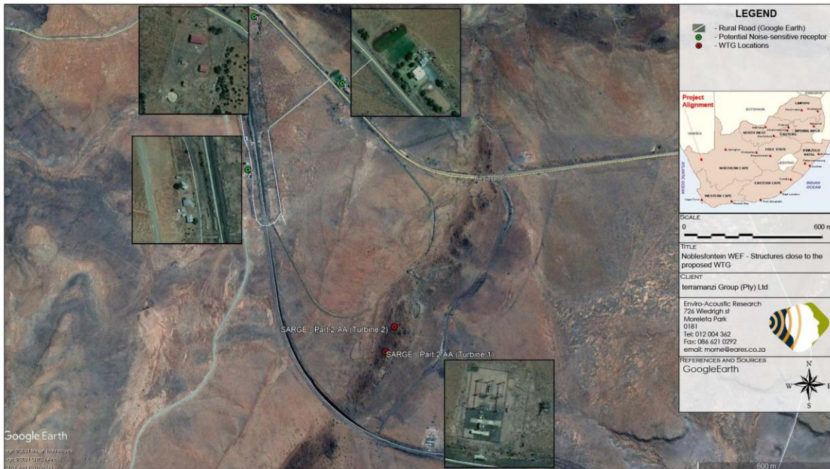
Figure D.1: Aerial Image dated from Google Earth