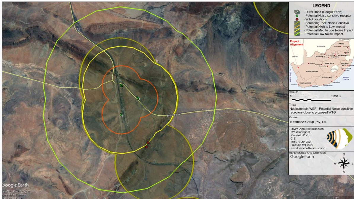
Figure D.1: Screening tool indicating potential area with a very high noise sensitivity