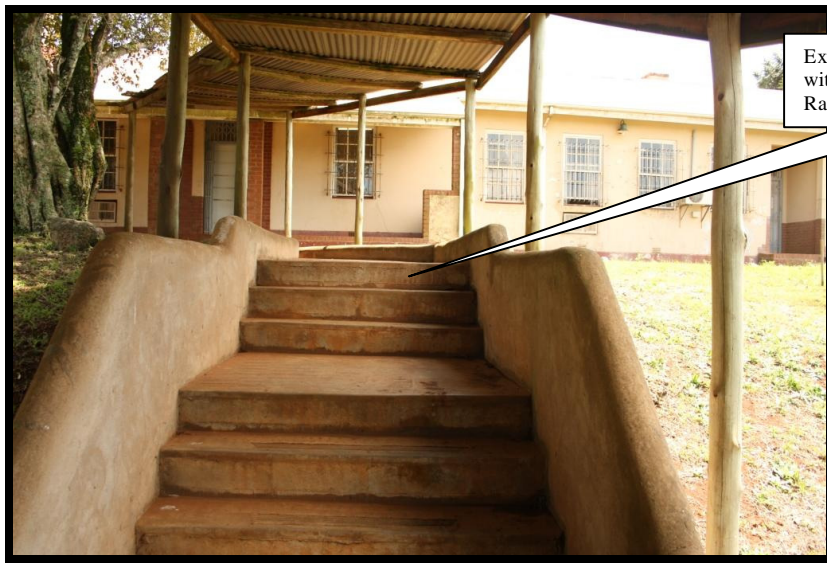
Existing Staircase to be replaced with New Staircase and Disabled Ramp