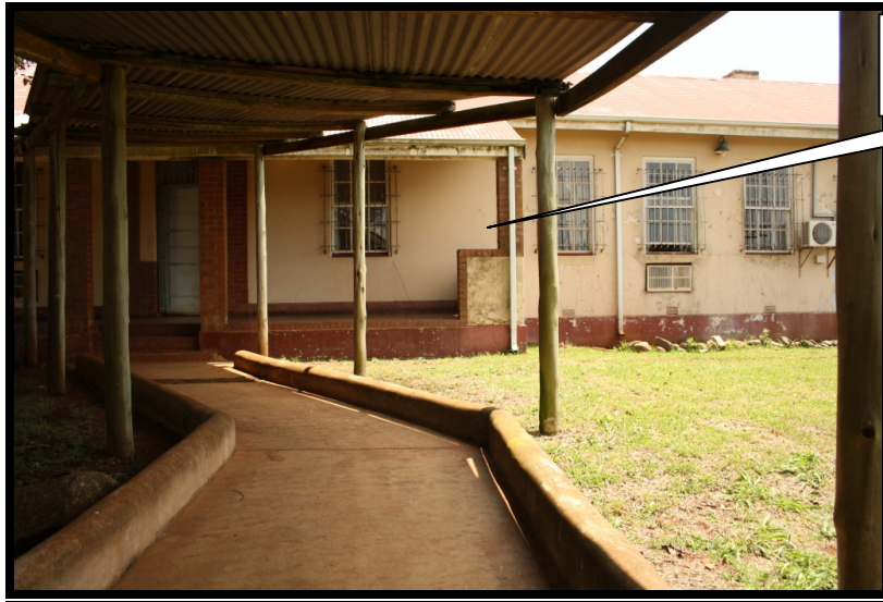
Existing Entrance to be replaced with New Walkway and Disabled Ramp

Provide New Covered Walkway and Ramp for Disabled to comply with NRB