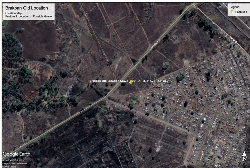
Figure 1. Google Earth© Image

G&A Heritage, Lesley Gaigher 015 516 1561 082 551 5082 pp@gaheritage.co.za PO Box 522, Louis Trichardt, 0920