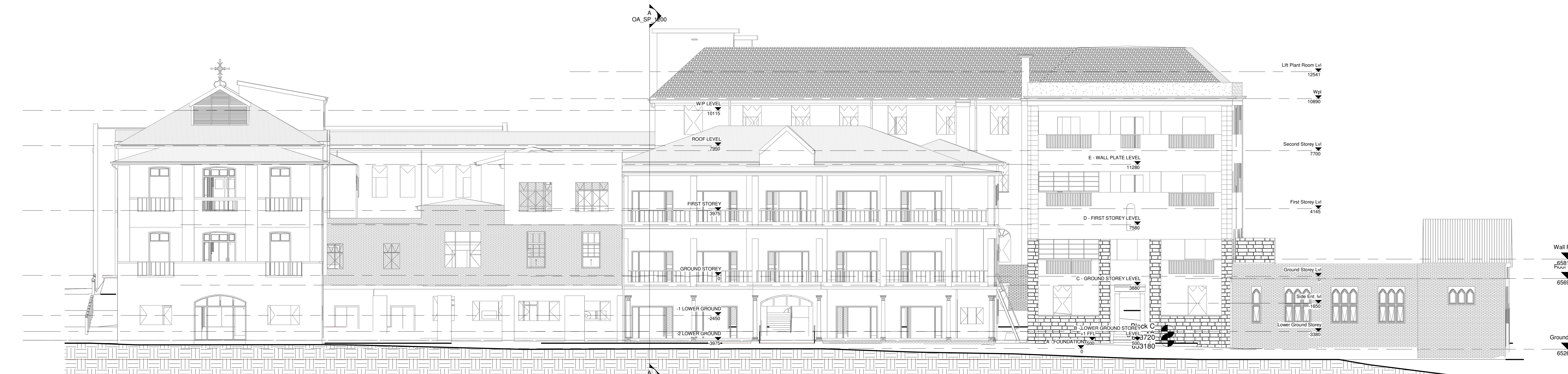
2 South-East Elevation 1 : 100