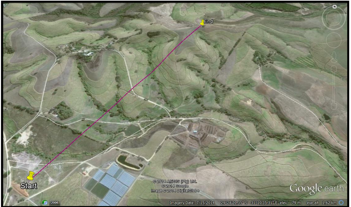
Figure 1: Locality Map showing the location of the Proposed Pipeline Route