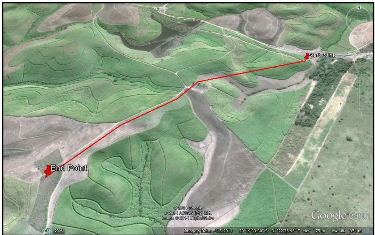
Figure 1: Google Image showing the location of the Proposed Pipeline Route