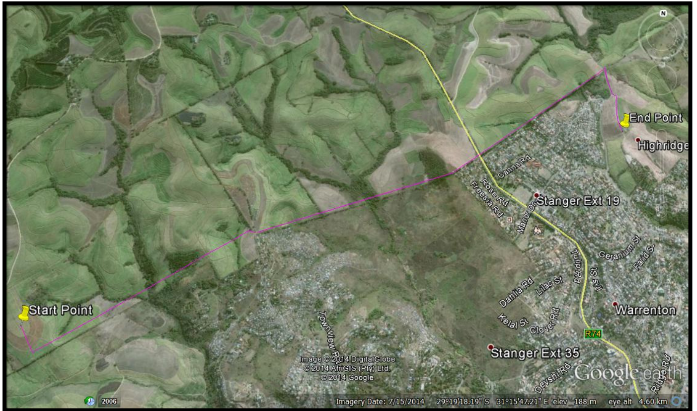
Figure 1: Locality Map showing the location of the Proposed Pipeline Route