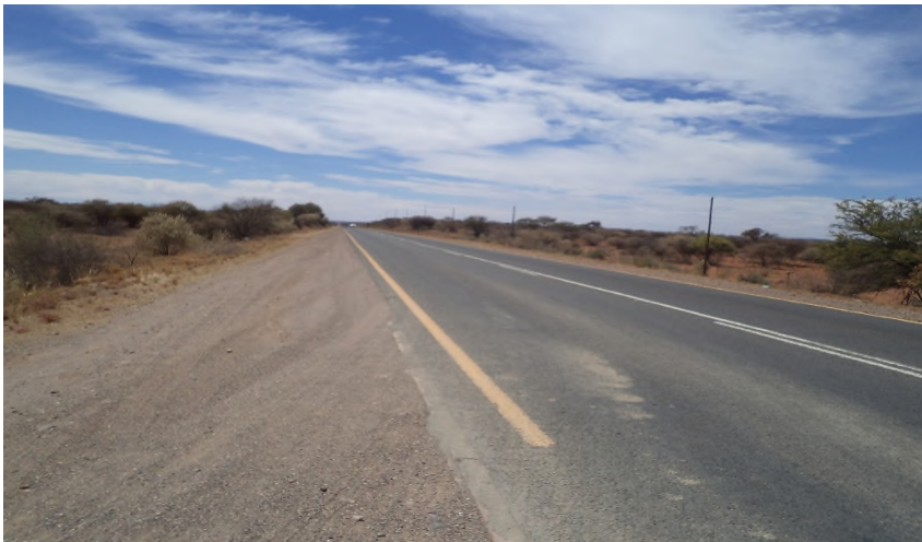
The N14 from Kathu toward the Industrial road which provides entrance to the new Olifantshoek substation preferred location