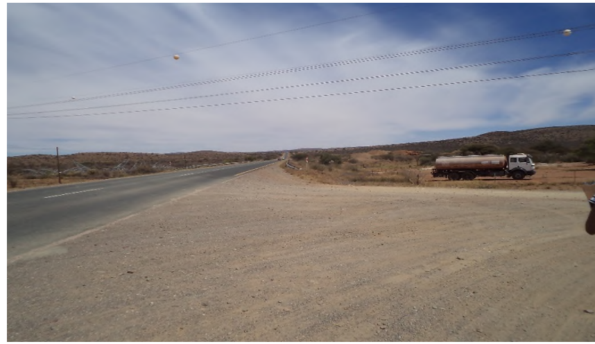
Exit off the N14 onto the Industrial Road.