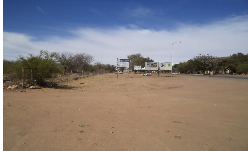
At the site entrance to the existing Olifantshoek Substation