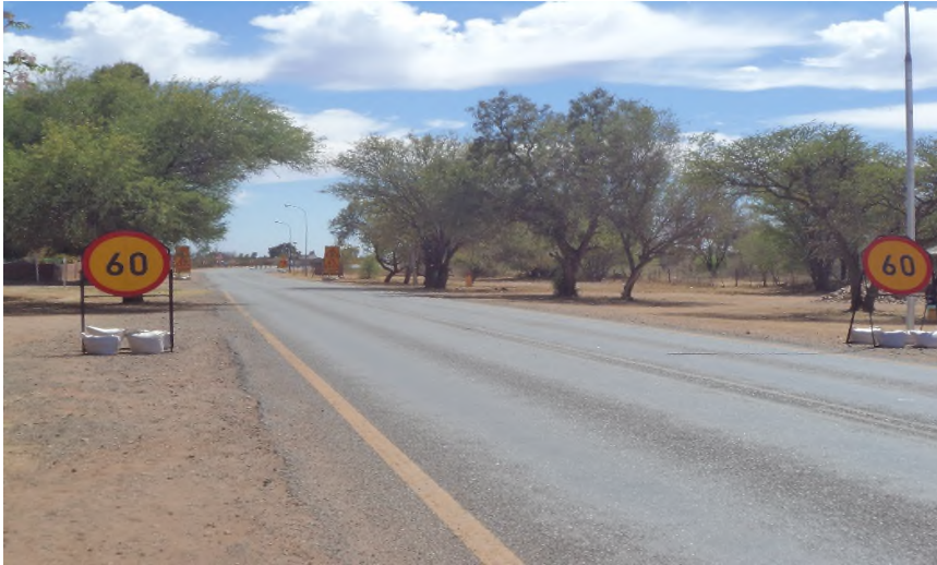
Access road leading to the existing Olifantshoek Substation