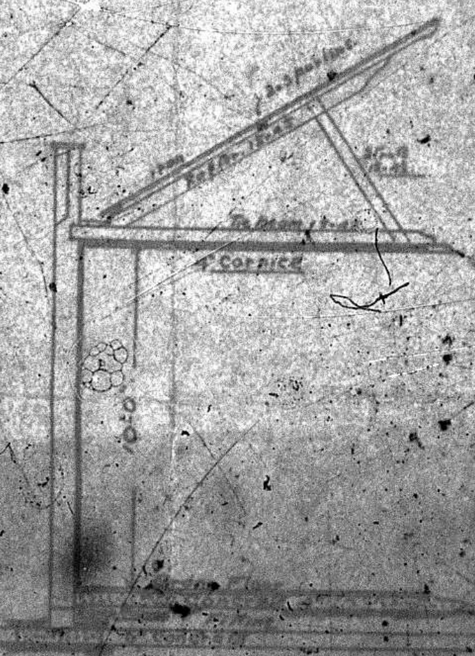
Front Wall Section