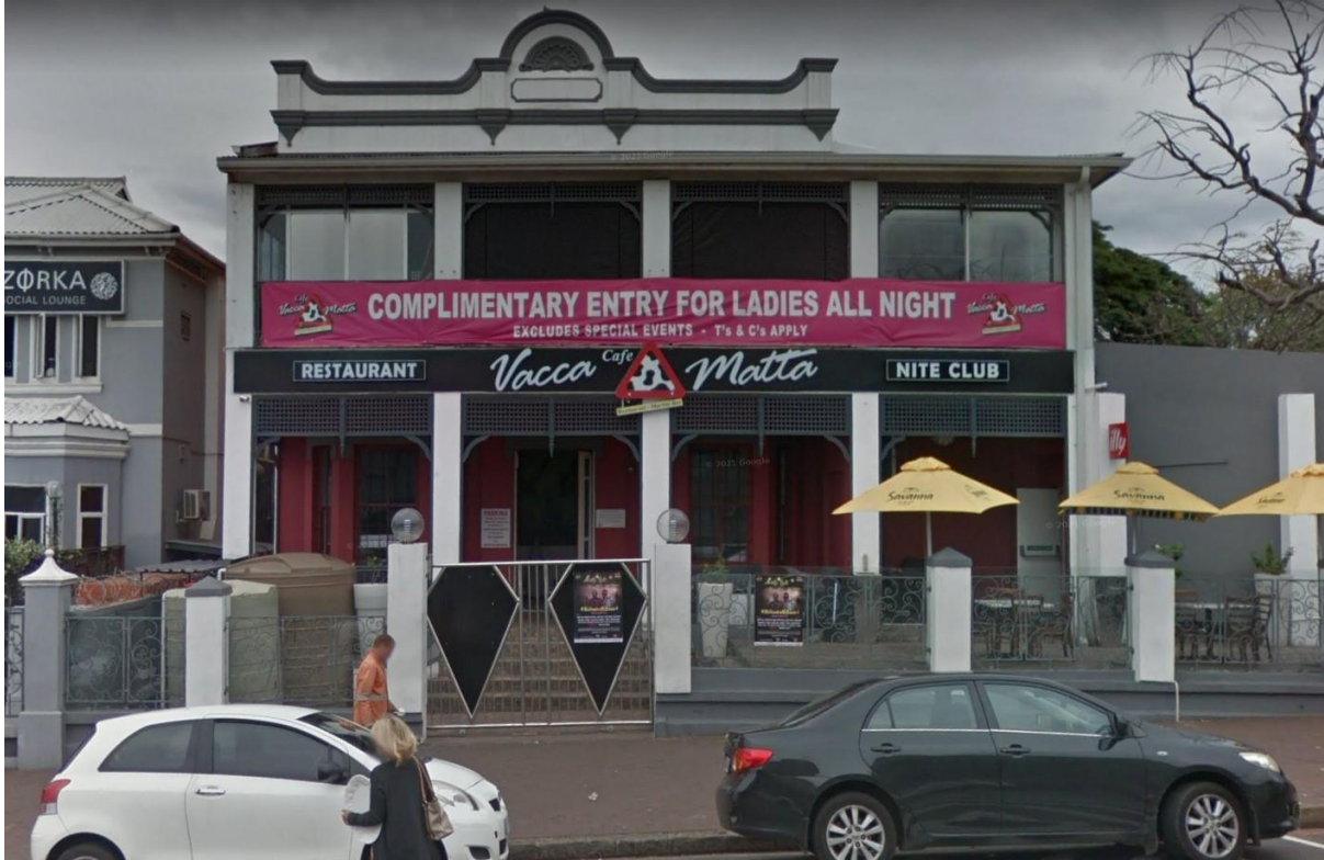
Image A (current view from Florida Road) – Shows the historic relevant façade that has previously been repainted. The façade features a front covered patio with square columns that extend to the roof on the first floor. The patio also feature symmetrical bay windows with timber frames. Decorative framework can be seen in between columns above head height on both floors.