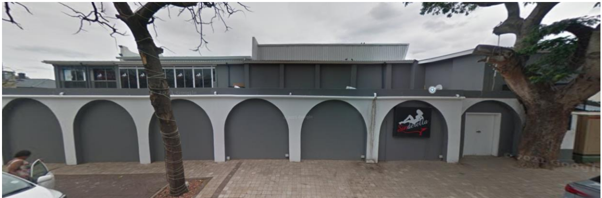
Image D (Current view from Ninth Avenue) – Shows the boundary wall of the site which also serves as the envelope wall of the previous entertainment area addition. The elevation also shows the main entrance into the open space entertainment area. The proposed changes seek to divert all site visitors to the front of the site and entrance to the original historic structure.