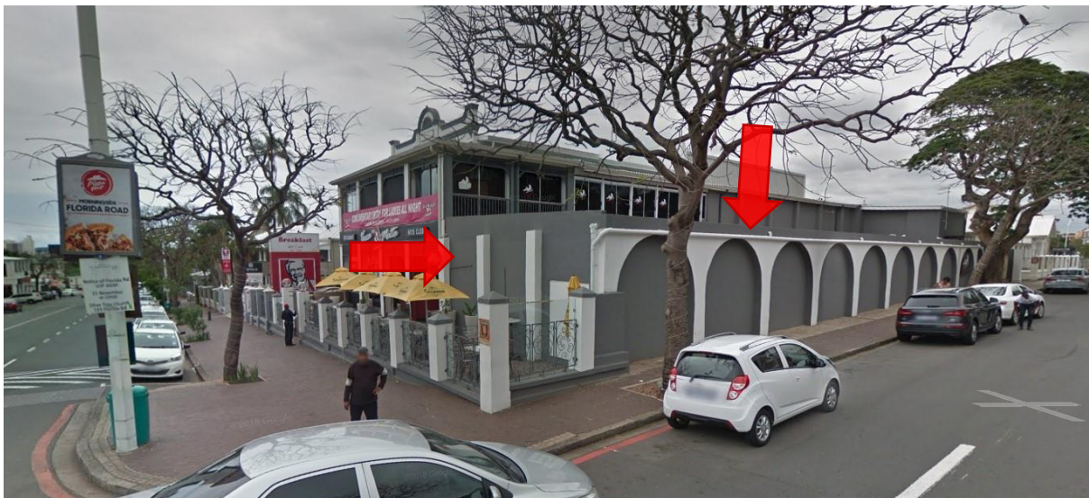
Image C (Current view from the corner of Florida Road and Ninth Avenue) – Shows the previous addition from the original historic structure to boundary wall. The Boundary wall/enveloping wall of enclosed space features arches that will be omitted with the wall made to look more consistent with the architecture of the original historic structure.