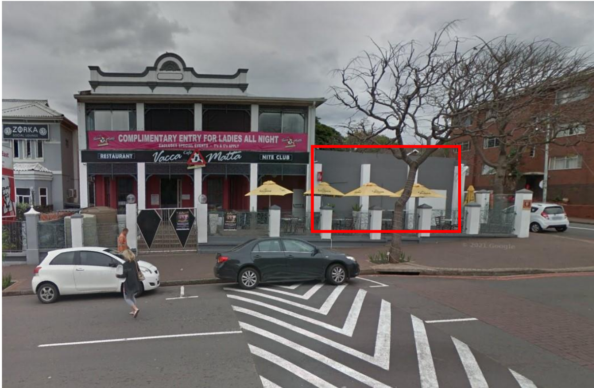
Image B (current view from Florida Road) – Shows the addition of an entertainment area via the enclosing and roof slab (beam and block) addition over the on-site parking lot. The new proposed works looks to demolish the black front wall of this addition and rebuild a new facade in addition with french doors in keeping with the historic language of the original building. This new façade will be separated from the original historic structure via a small courtyard as per proposed plans.