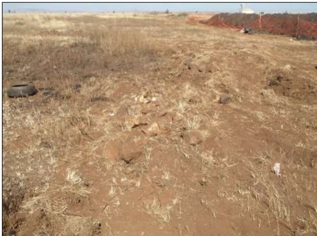
Figure 3: Stone mounds closer to construction activities