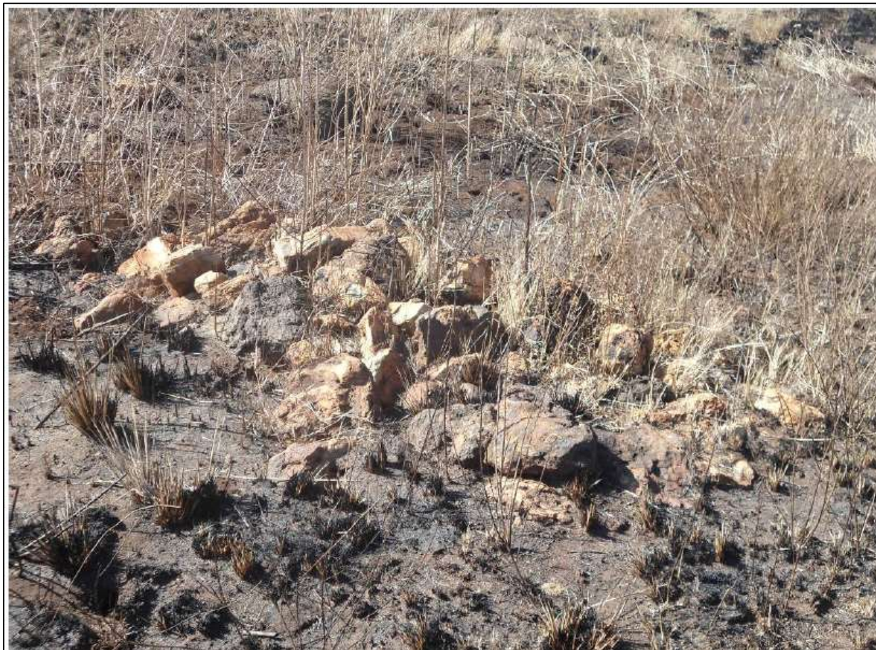
Figure 1: One of the possible grave dressings on site

Refer to photographic evidence taken (Figure 1 -3).