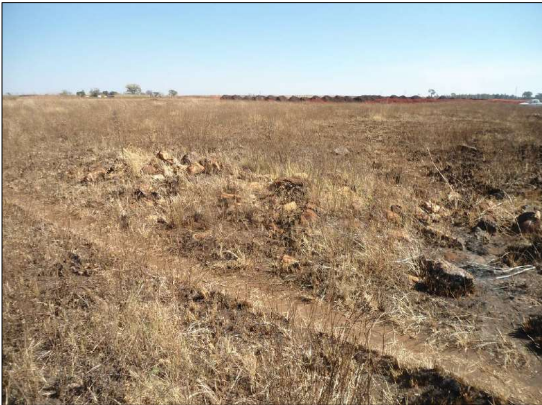
Figure 2: Stone mounds in foreground