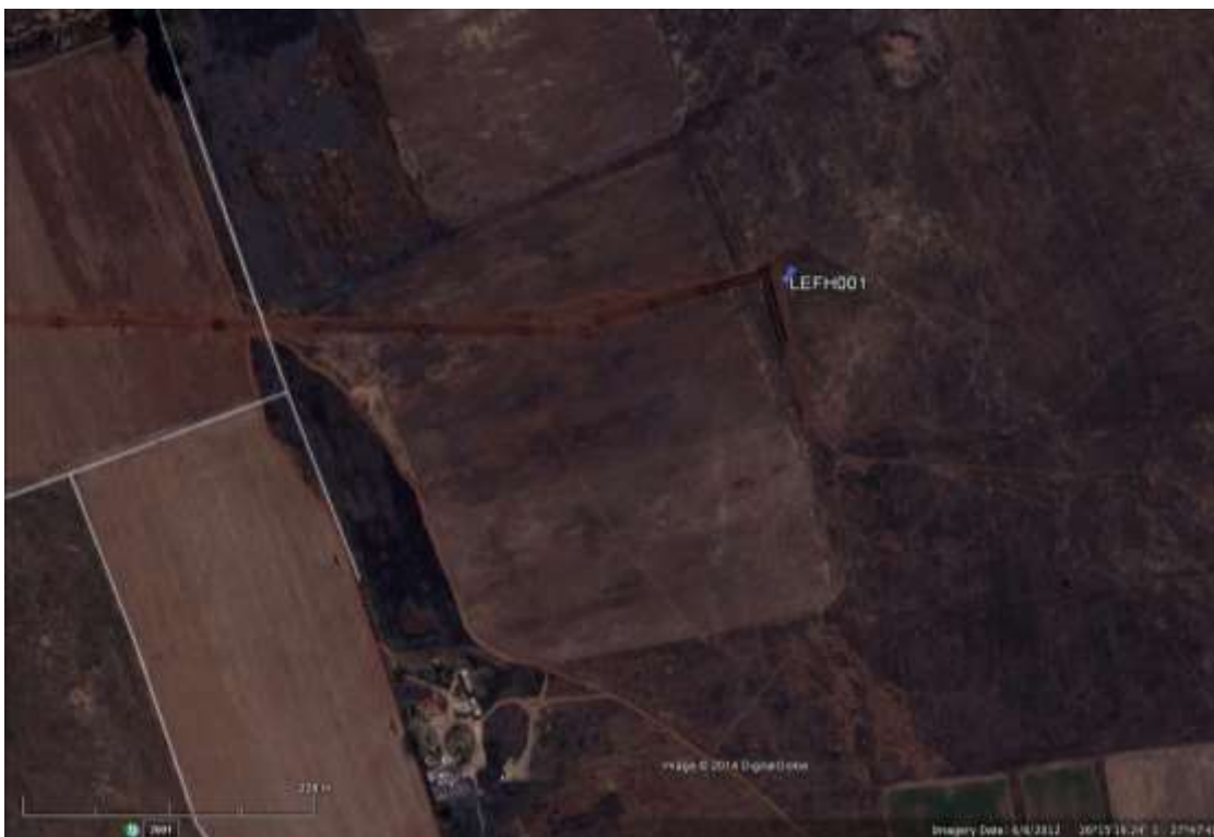
Figures 5. & 6. Approximate location of the cemetery (red polygon) and the area with the uncovered burials (yellow marker).