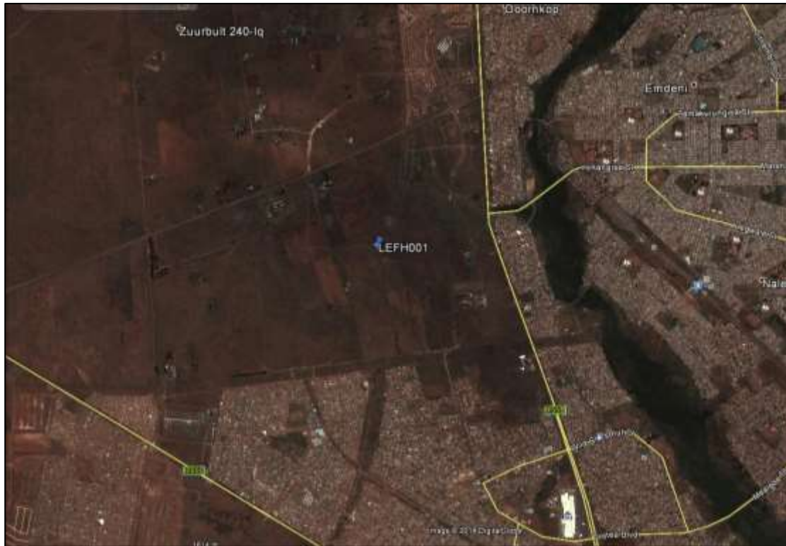
Figure 4. The position of the site marked on Google Earth.

At this stage the presence of grave needs to be determined and no age has yet been determined.