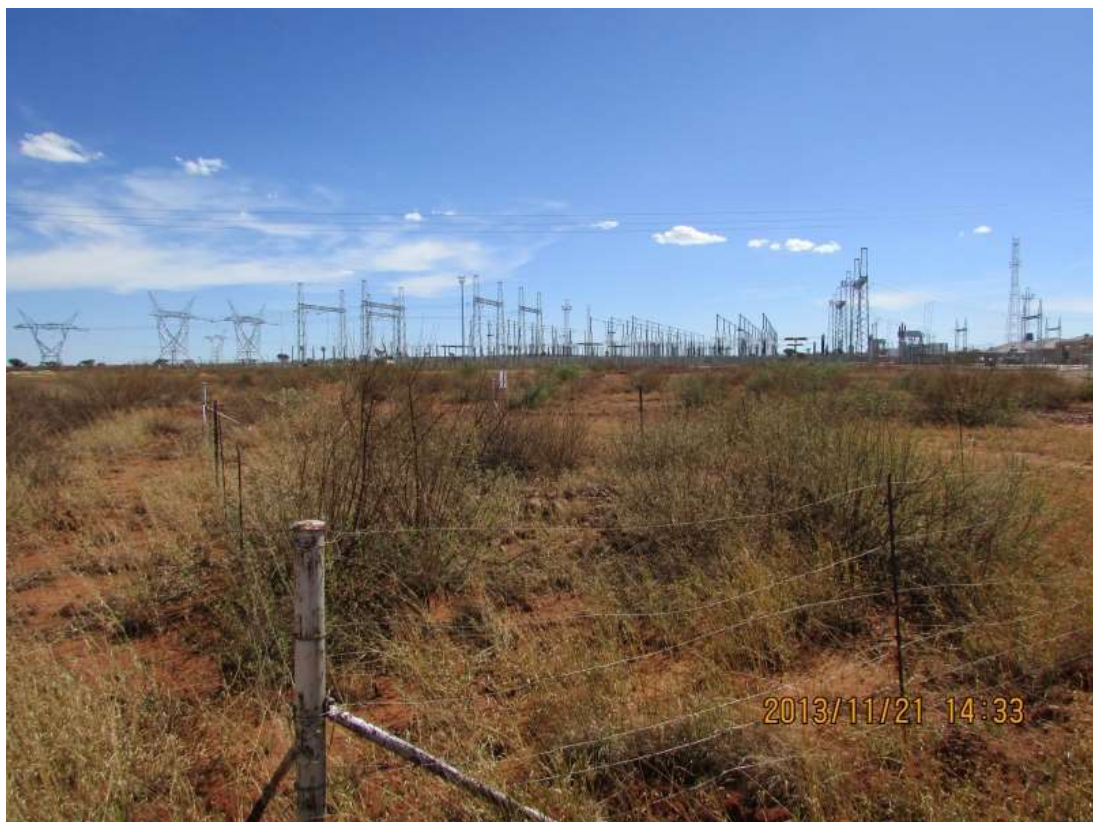
Plate 4 – Cemetery, viewed from the east the Mookodi sub-station in the background.

None of the graves in this cemetery contain dates or details of who was buried here. No material culture was found in association with the graves that indicates the date at which these individuals were buried or their origins. It will then be assumed that the graves are older than 60 years.