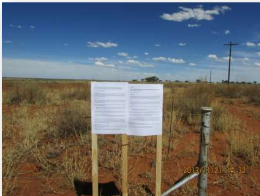
Plate 9 – Site notices placed at cemetery – close-up