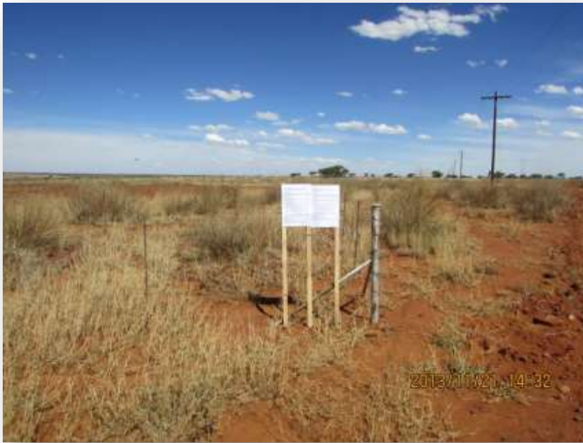
Plate 7 – Site notices placed at cemetery