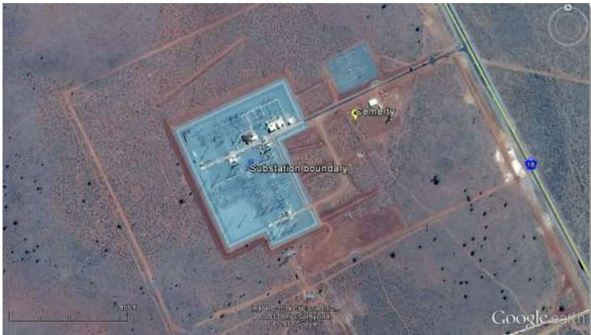
Plate 3 - Google Earth image showing the cemetery within its local context.