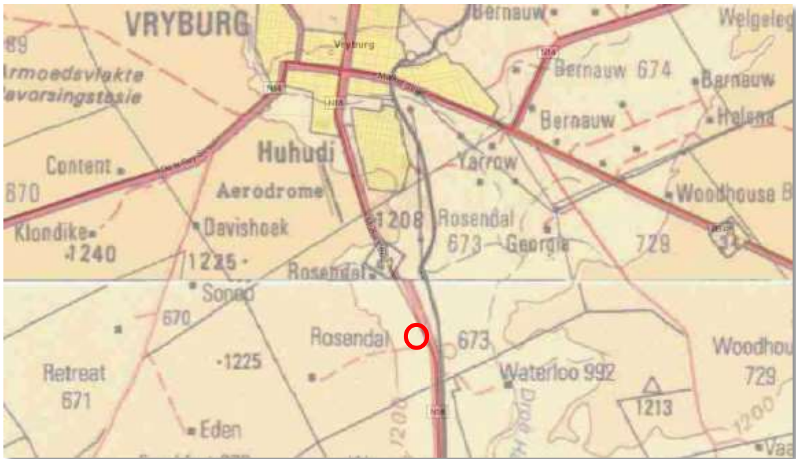
Plate 1 - The cemetery within its regional context