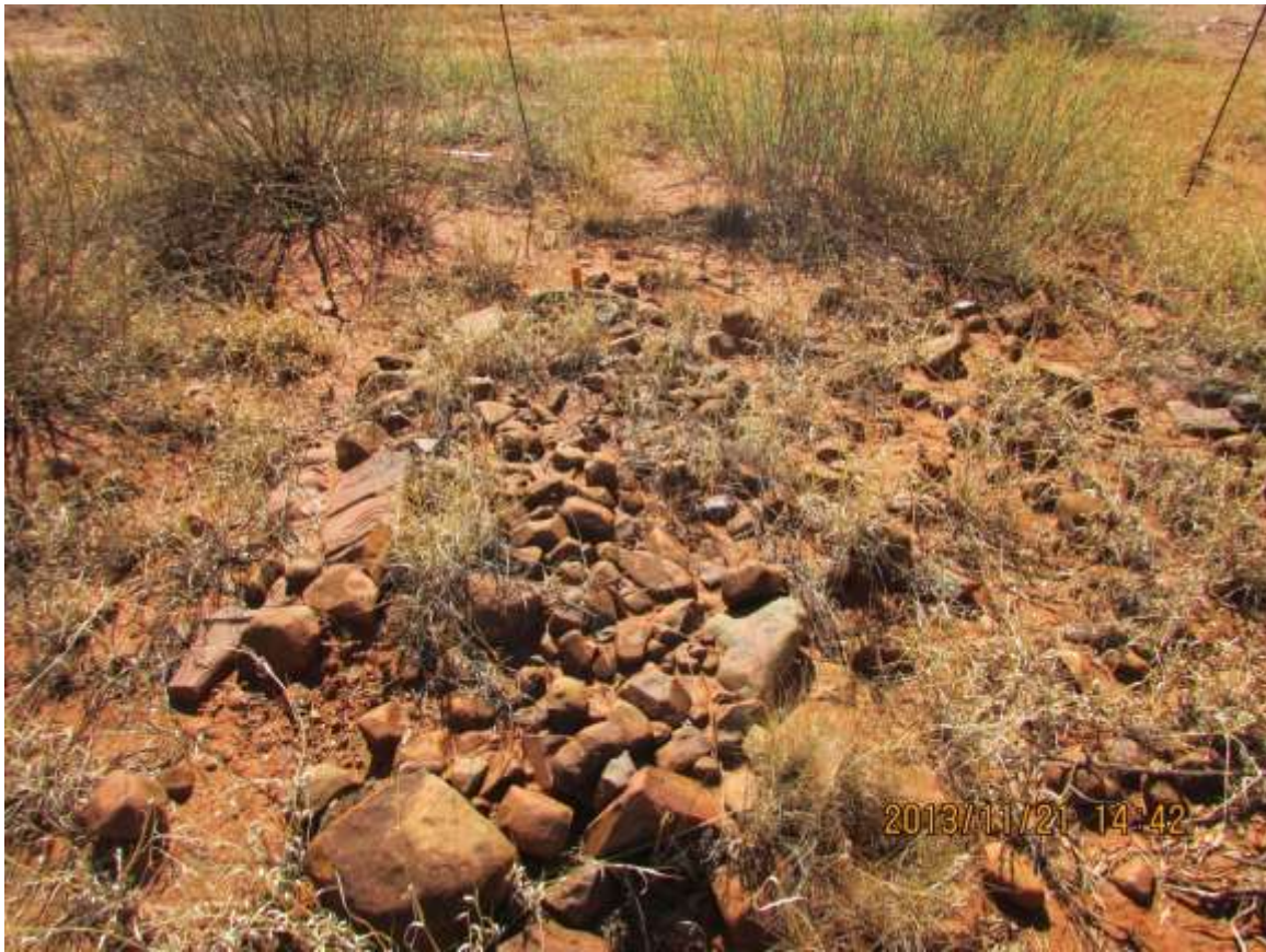
Plate 5 – One of the stone packed graves.