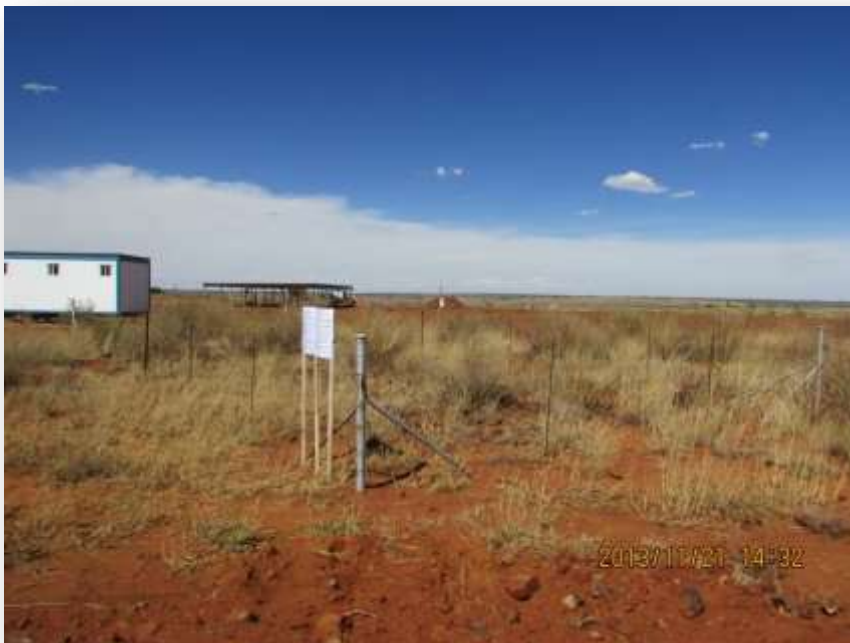
Plate 8 – Site notices with construction office in background