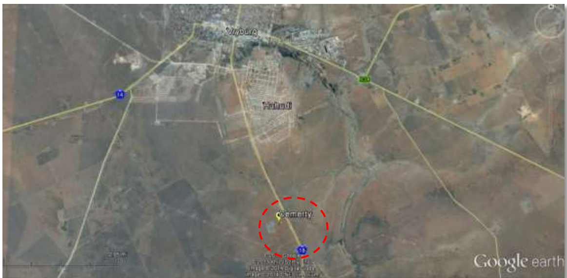
Plate 2 - Regional Setting of site