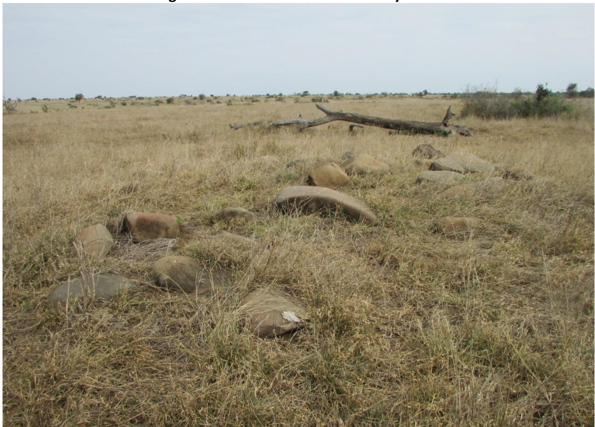
Figure 13: The unknown stone cairn close to Mavumbye.