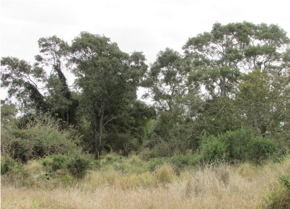
Figure 11: Another view showing the dense vegetation close to and around the Mavumbye Spruit.