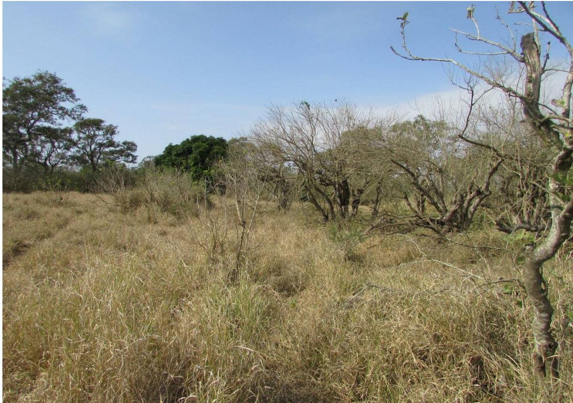
Figure 6: General view of the Mananga study area again showing the dense vegetation that limited visibility on the ground in most parts.