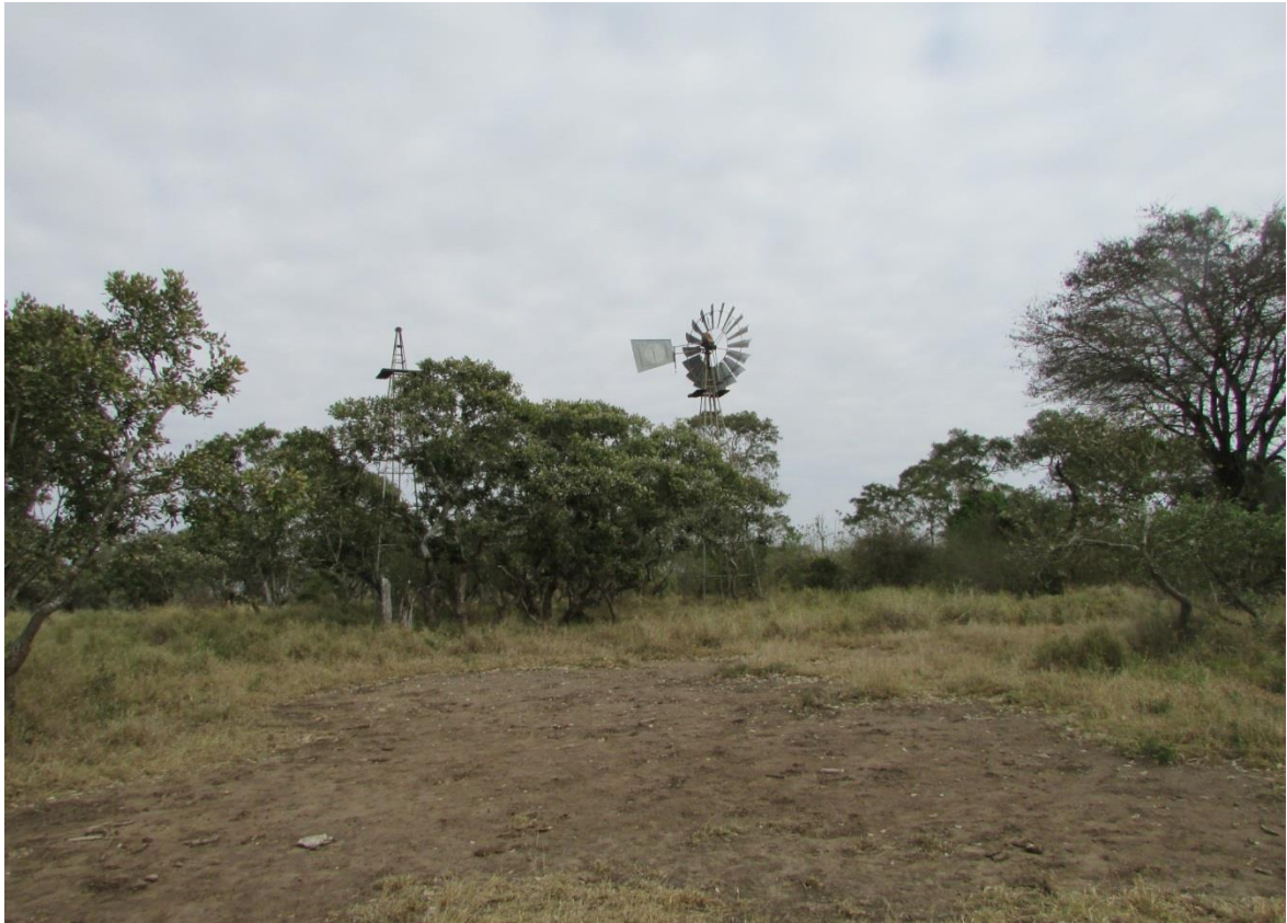
Figure 8: Some open eroded sections occur around Mananga, but these are located outside of the development footprint.