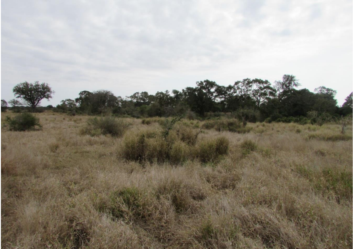
Figure 10: General view of the area around the Satara Mavumbye site.