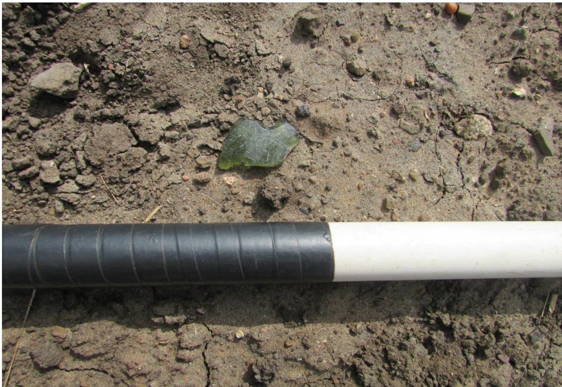
Figure 9: Piece of late 19 th /early 20 th century glass liquor bottle found at Mananga.