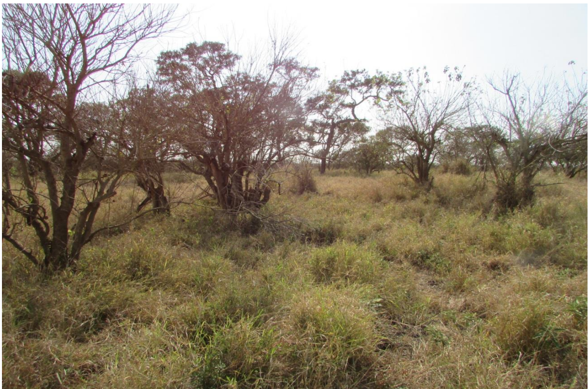
Figure 5: Another view of part of the area.