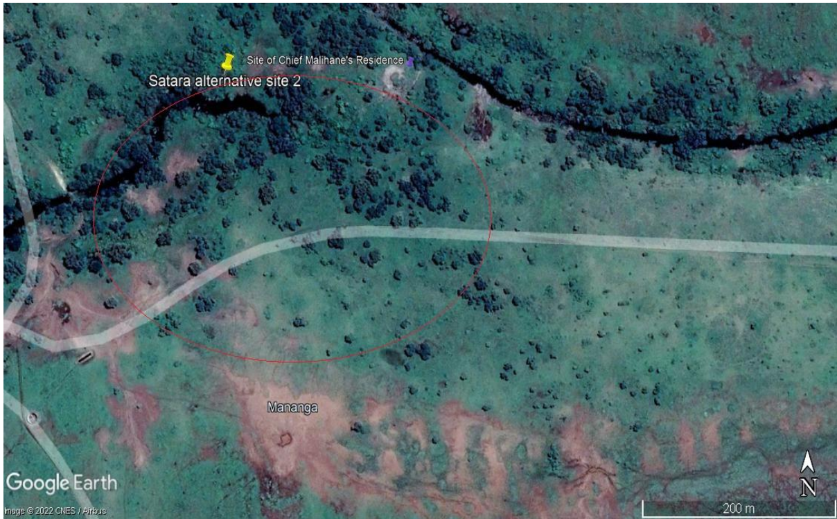
Figure 2: Closer view of the Alternative 2 (Mananga) Camp Site Location. The area circled was assessed during the August 2022 fieldwork (Google Earth 2022). The site of Chief Malihane’s residence is indicated, but falls outside the development footprint area.