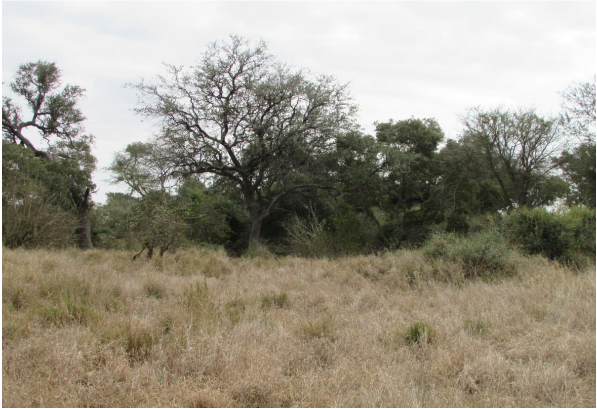
Figure 12: Another view of the study area.