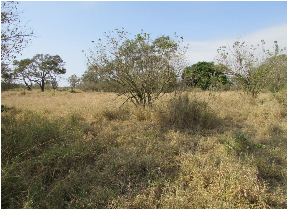
Figure 4: View of a section of the Satara Mananga study area. Note the dense grass cover.