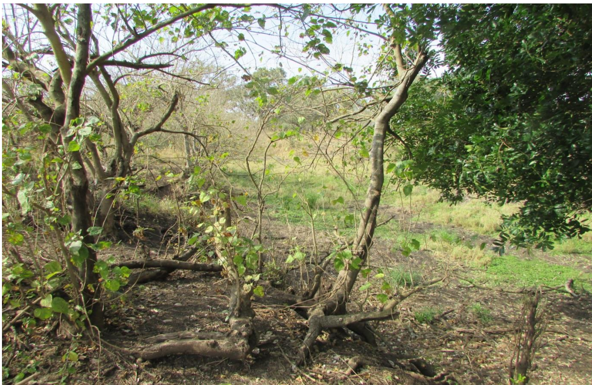
Figure 7: A view of the vegetation around the Spruit.