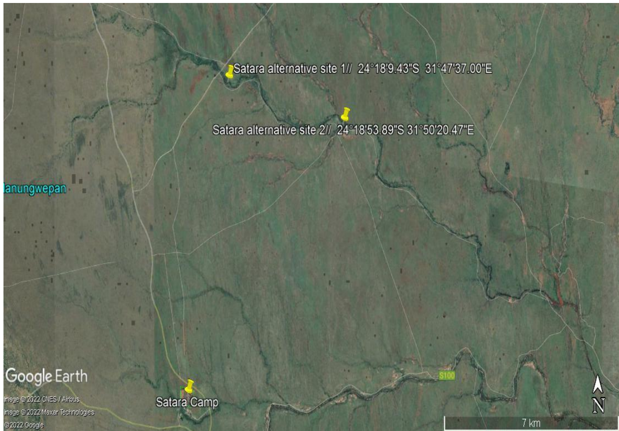
Figure 1: Locality of the two proposed Camp Sites (Google Earth 2022). Alternative Site 1 is Mavumbye & Site 2 is Mananga.

are both characterized by tall trees especially around the river bank (riverine forest). There are some open eroded (caused by water and animal trampling) areas close to the Mananga Site.