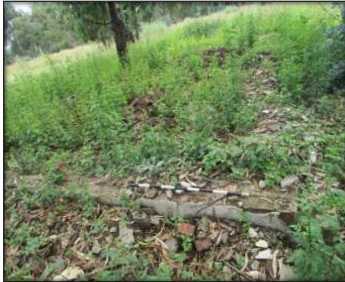
Fig.23: Another view of the homestead remains.