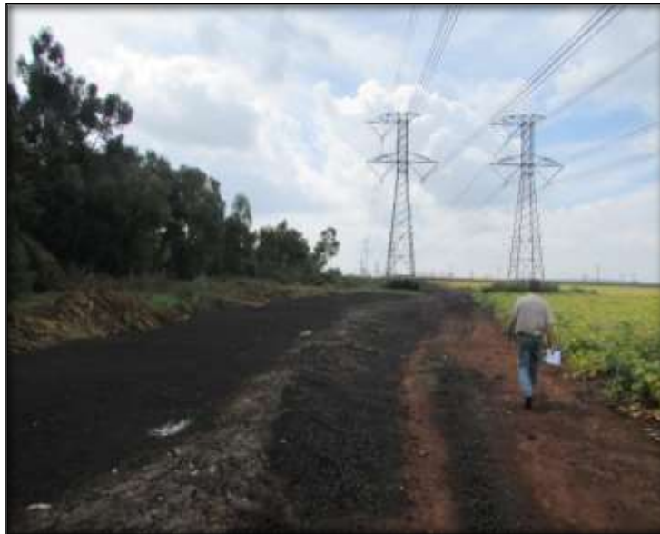
Fig.6: Dumping of human and other waste occurs throughout the area.