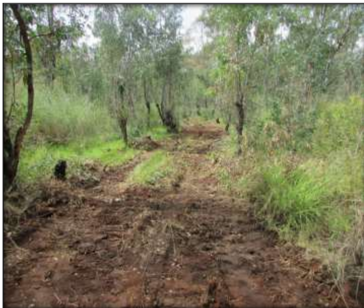
Fig.8: Recent access tracks for surveying & geotechnical work was used to access and survey the area.