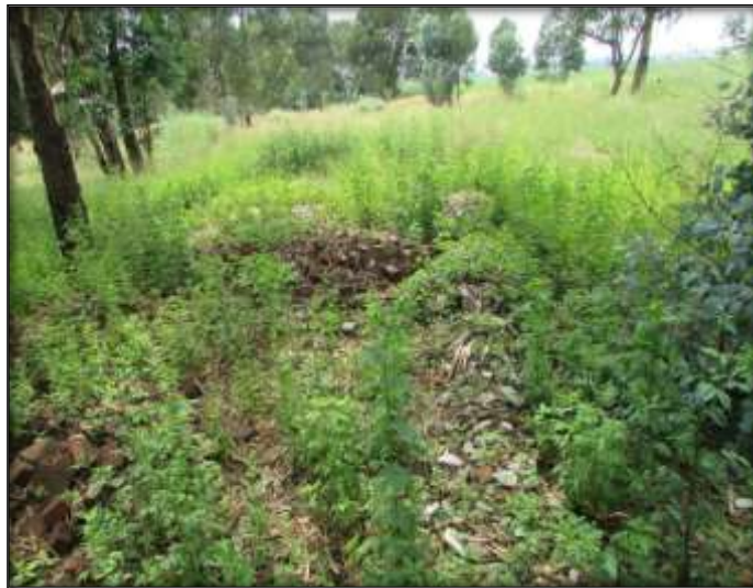
Fig.24: More remains.