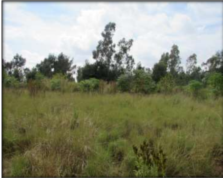
Fig.5: Dense grass cover also made visibility difficult.