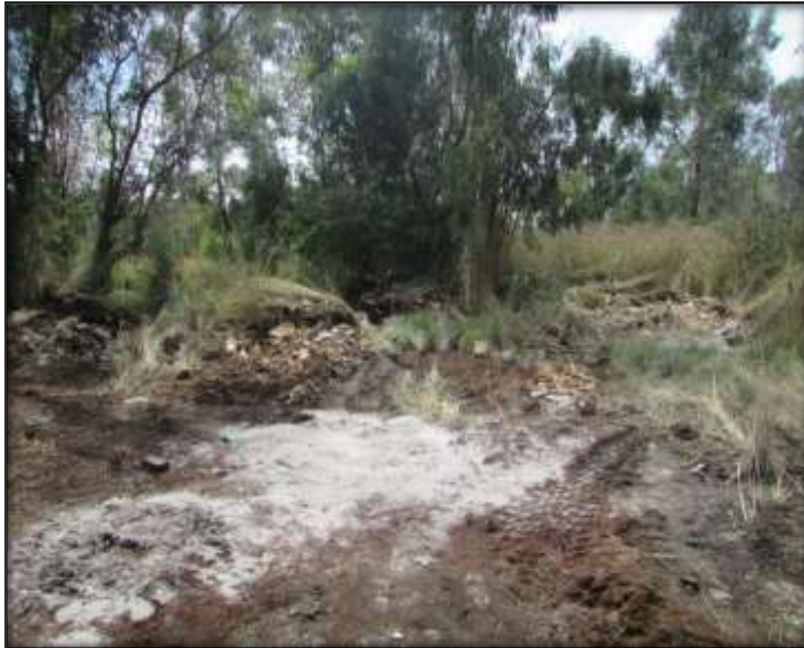
Fig.7: Informal dumping of building rubble & household refuse occurs on a large scale.