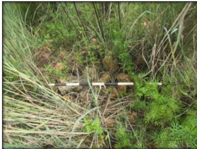
Fig.16: One of the stone-packed graves at Site 2.