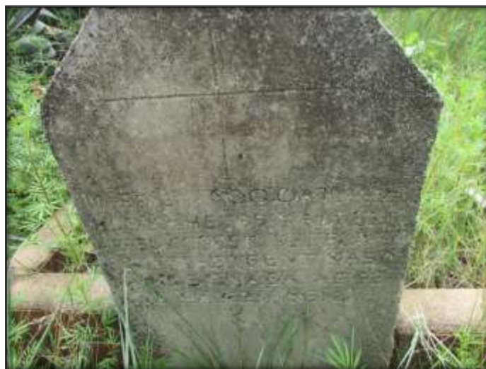
Fig.21: Another grave with formal dressing & headstone at Site 2. The inscription is difficult to read.