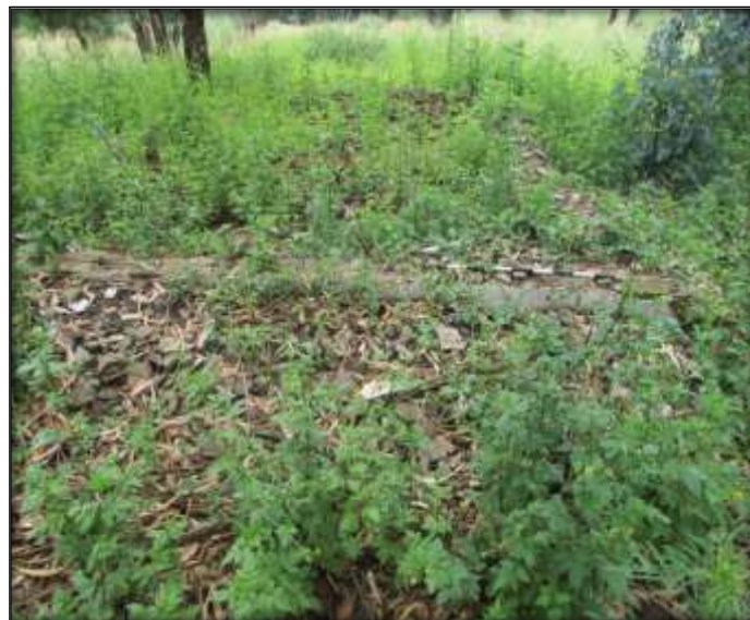
Fig.22: Some of the homestead remains on Site 3.

Mitigation: No further mitigation required. Care should be taken when the structures are demolished as there is always the possibility of unmarked/unknown burials of still-born babies and young infants being associated with these homesteads.