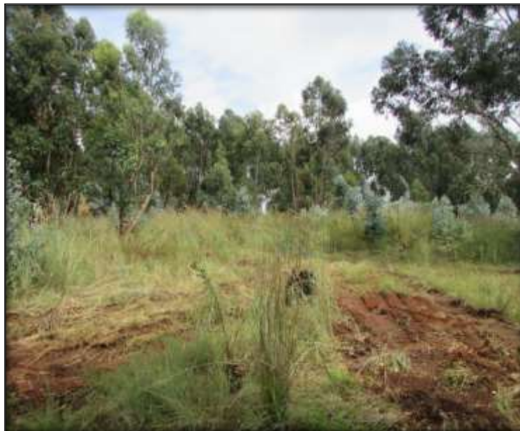
Fig.4: Another view. Note the bluegum trees.