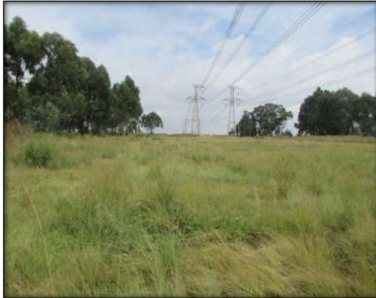
Fig.3: View of section of study area. Note the Powerlines.