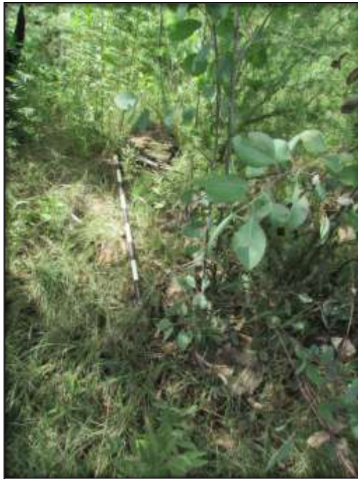
Fig.12: One of the stone-packed graves at Site 1.