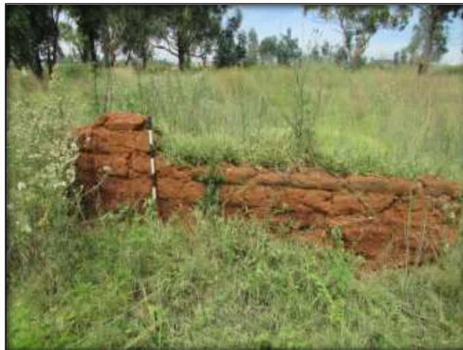
Fig.25: Remains of a clay-brick structure (Site 4).