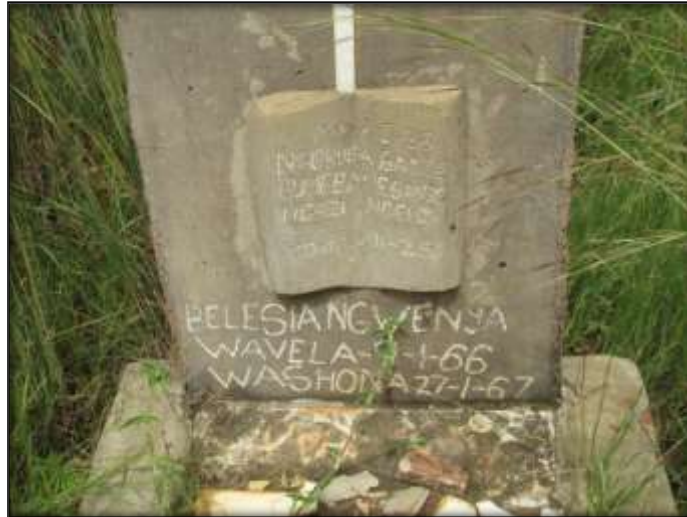
Fig.19: The grave of Belesia Ngwenya at Site 2.