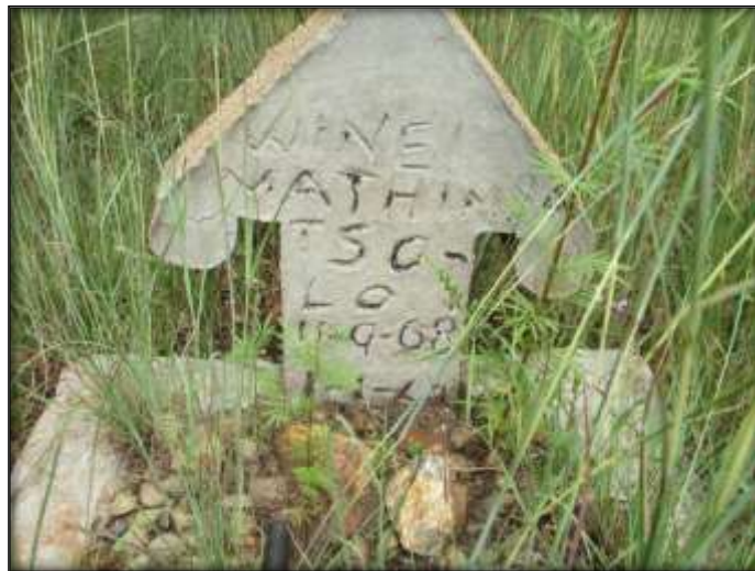
Fig.20: The grave of Winei Mathimbatsolo.