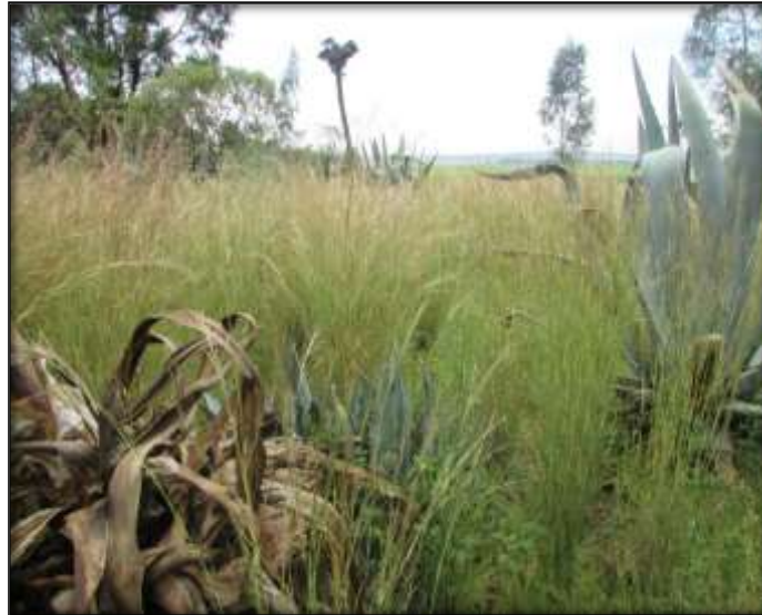
Fig.15: The location of Site 2.