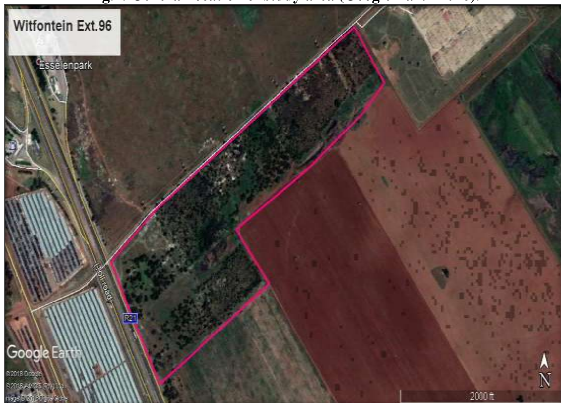
Fig.2: Closer view of study area.