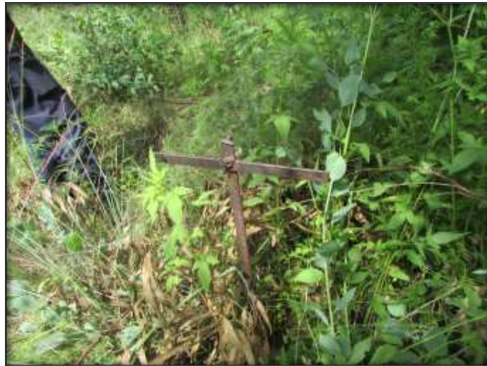
Fig.14: The grave with the metal cross at Site 1.