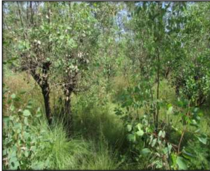
Fig.11: The location of Site 1.