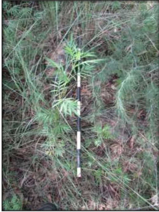
Fig.13: Another of the stone-packed graves here.