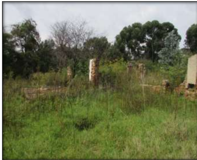
Fig.27: Another view of Site 5.