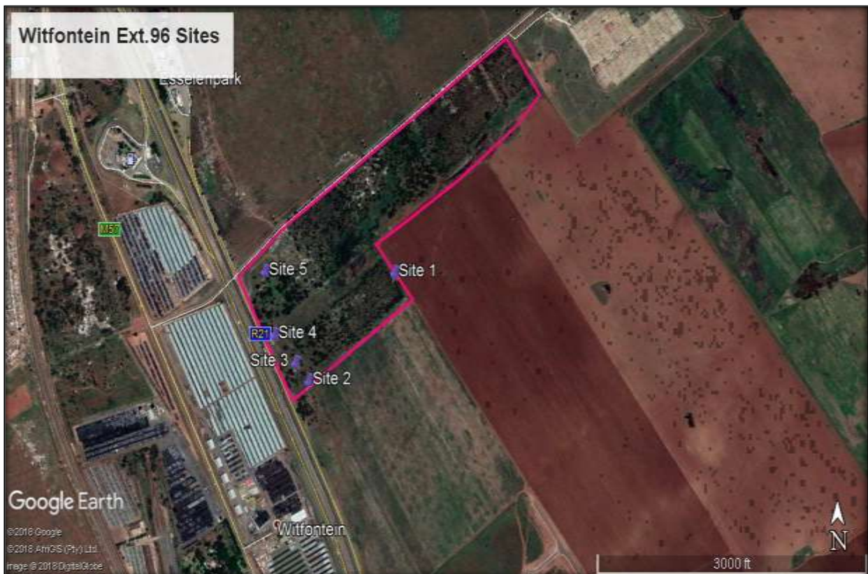
Fig.29: Distribution of Sites found during the assessment (Google Earth 2018).

Based on the assessment it is therefore recommended that the development can continue, taking consideration of the recommendations made at the end of this report. Furthermore it should be noted that although all efforts were made to cover the total area and therefore to identify all possible sites or features of cultural (archaeological and/or historical) heritage origin and significance, that there is always the possibility of something being missed. This will include low stone-packed or unmarked graves. This aspect should be kept in mind when development work commences and if any sites (including graves) are