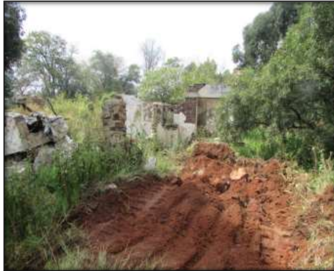
Fig.28: A closer view of the demolished ruins of the Site 5 farmstead.