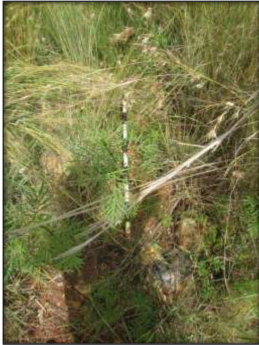
Fig.17: Another stone-packed grave Site 2.