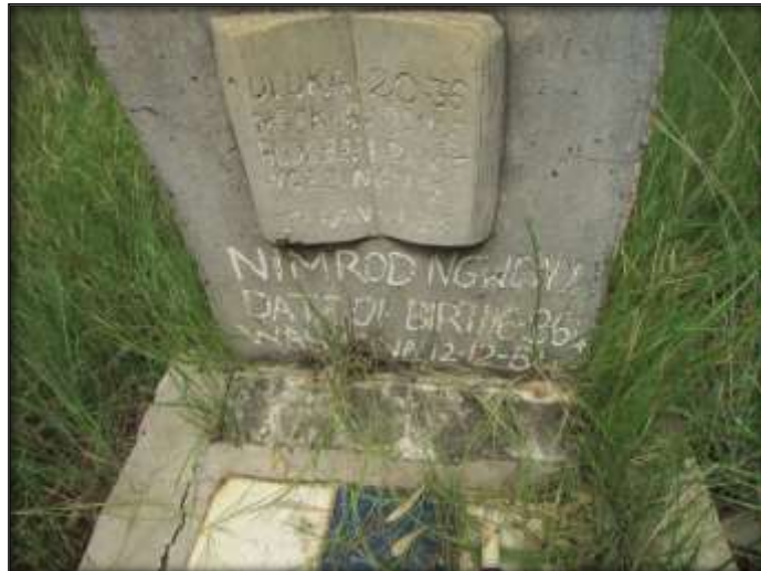
Fig.18: The grave of Nimrod Ngwenya.