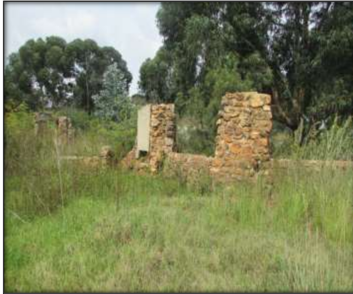
Fig. 26: Partial view of Site 5 farmstead ruins.