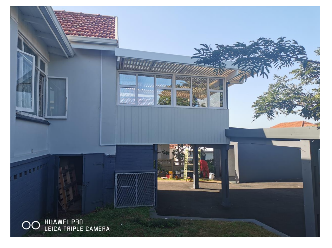
RIGHT VIEW WITH COVERED SUNDECK