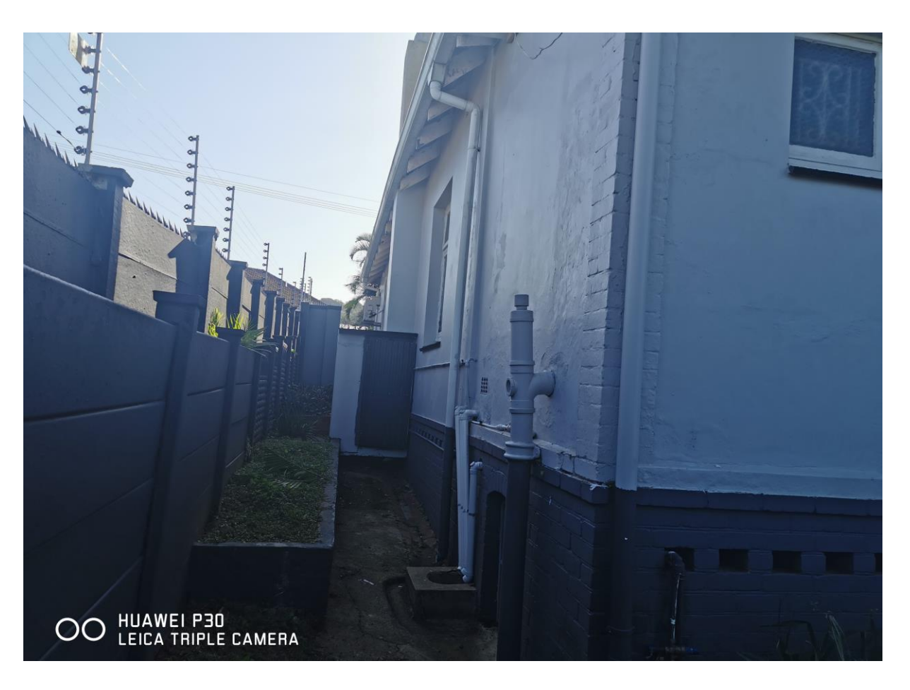
REAR VIEW OF OUTBUILDING