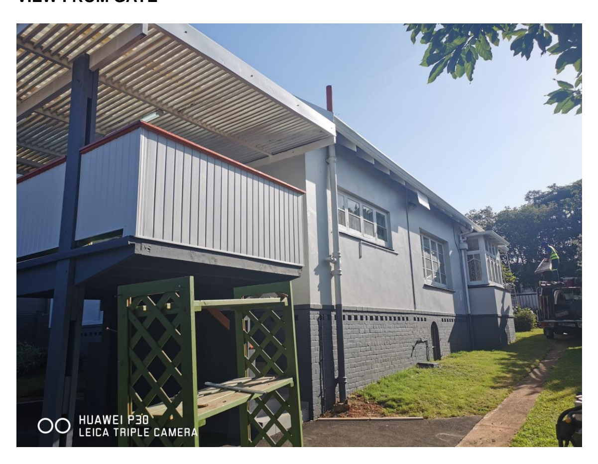
PARTIAL REAR VIEWWITH COVERED SUNDECK