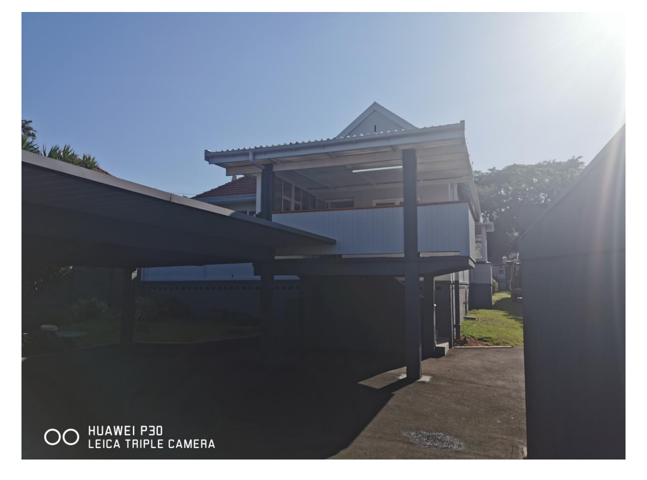
REAR VIEW WITH COVERED SUNDECK AND CARPORT