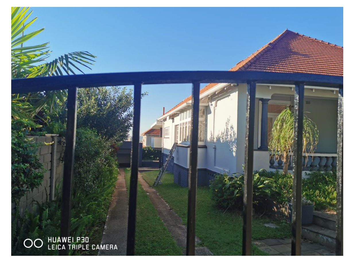
VIEW FROM GATE