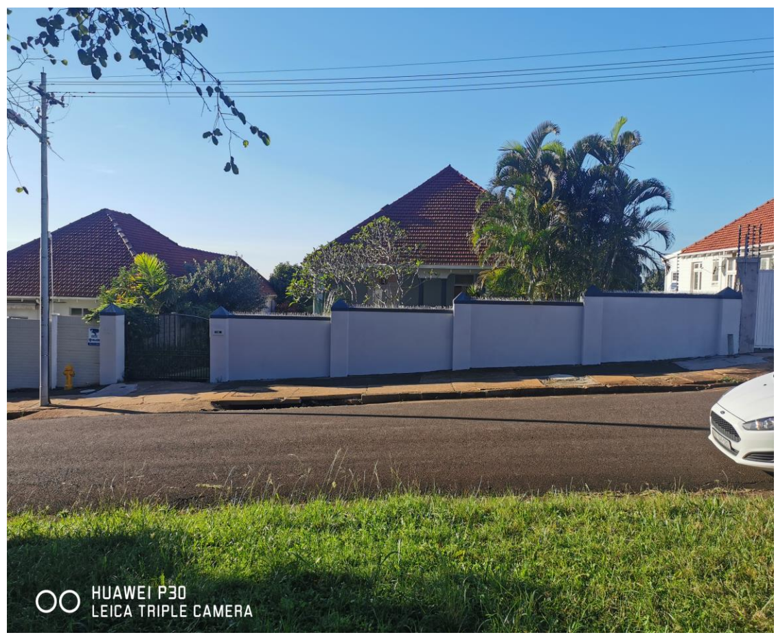
OPPOSITE VIEW Edmonds Road