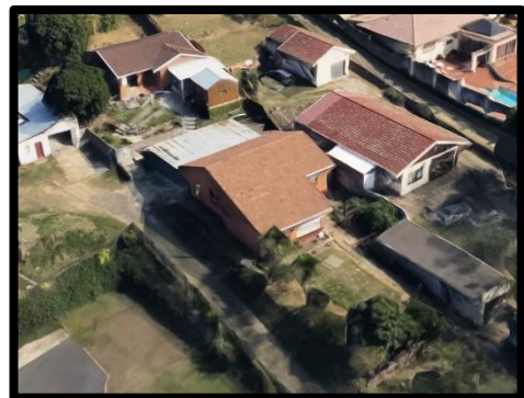
Figure 06: Site overview indicating, Ex. Outbuilding at rear, Ex. Dwelling with Carport and Ex. Shed structure in front