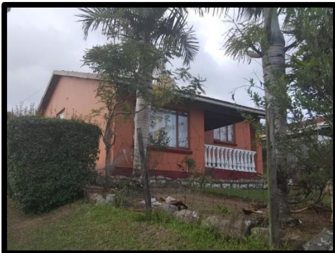
Figure 05: Ex. Dwelling – Dated 2020