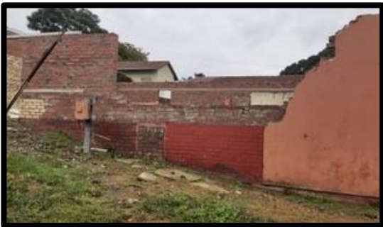
Figure 09: Ex. Dwelling – January 2022 Remaining building