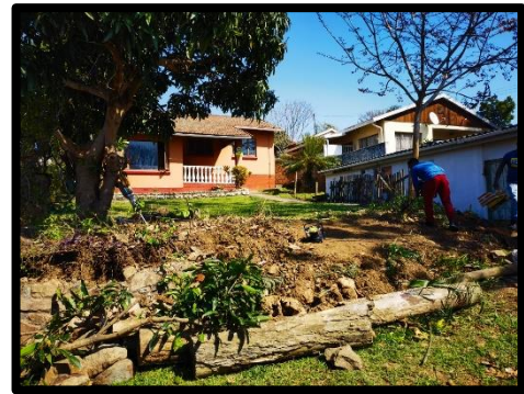
Figure 02: Ex. Dwelling – Dated 2020