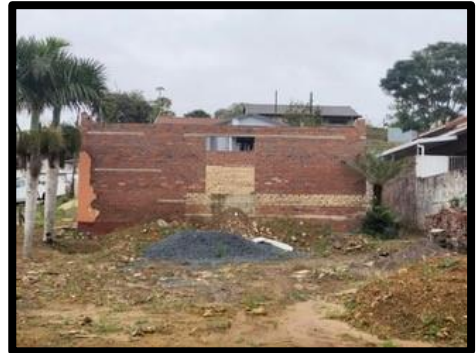
Figure 08: Ex. Dwelling – January 2022 roof structure and windows and doors stolen.