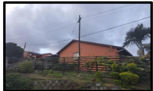
Figure 04: Ex. Dwelling – Dated 2020