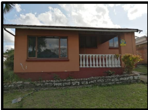
Figure 03: Ex. Dwelling -Dated 2020.