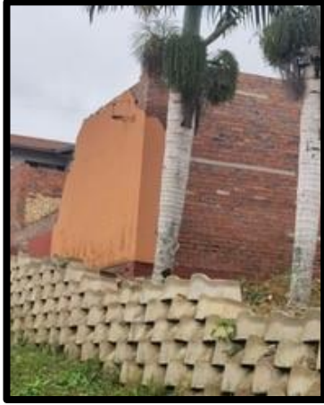
Figure 07: Ex. Dwelling – January 2022 Vandalized