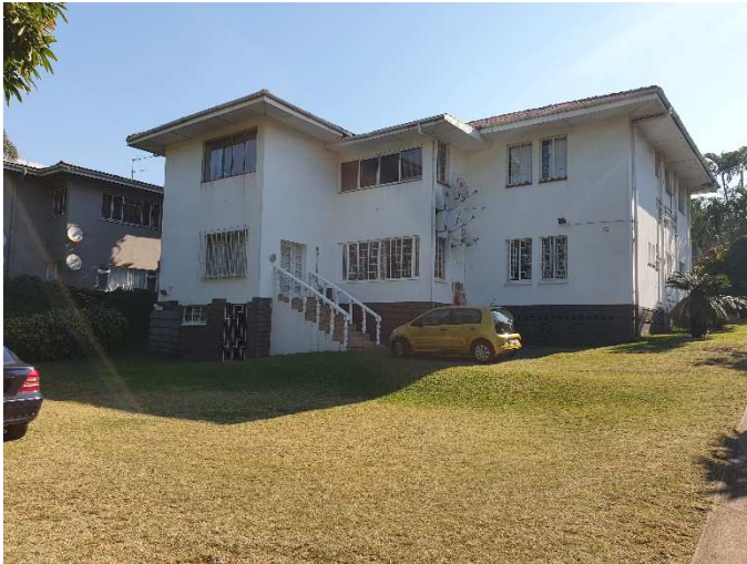
Fig 7. Main House -Rear