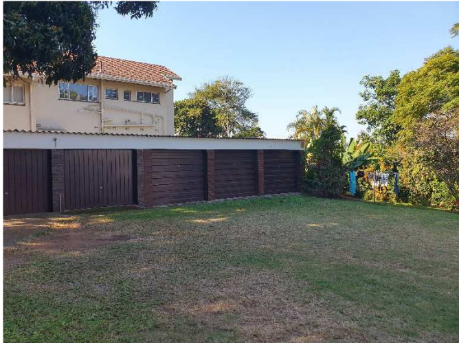
Fig 12. Garages