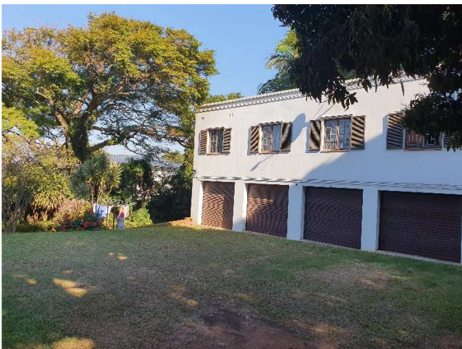
Fig 9. Outbuilding