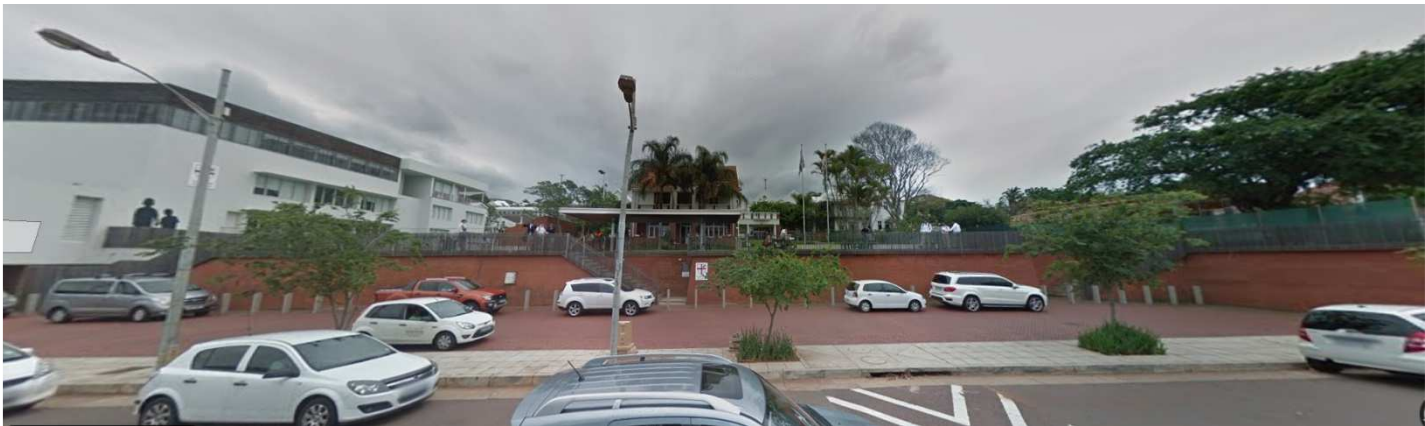
Fig 14. Street Elevation across the Plot