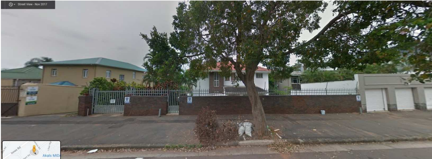
Fig 13. Street Elevation facing the Plot