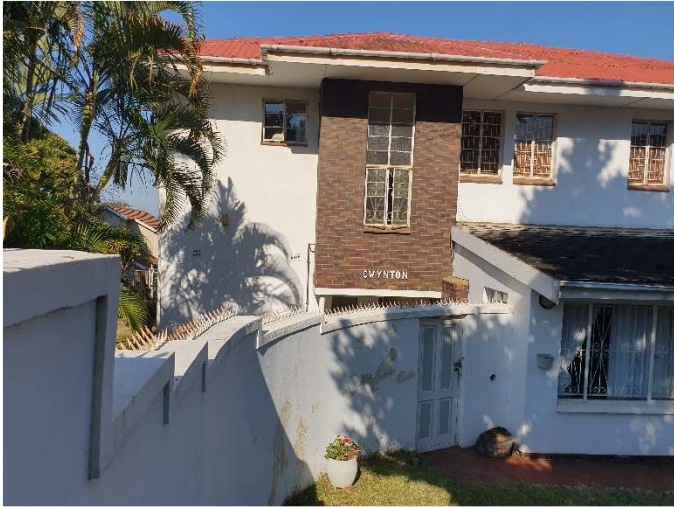
Fig 5. Main House -Street