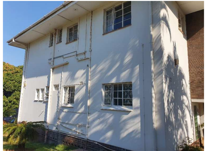
Fig 8. Main House -left Side