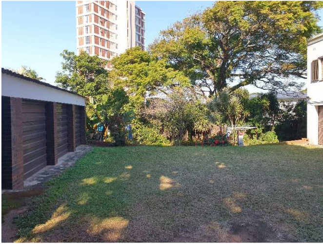
Fig 11. Garages