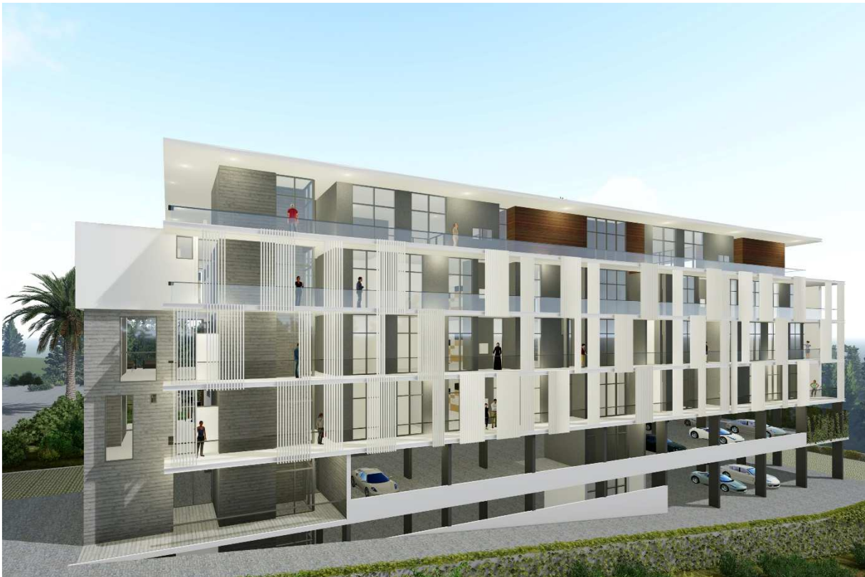
Fig 18. Southwest elevation – access elevation to parking and unit entrances