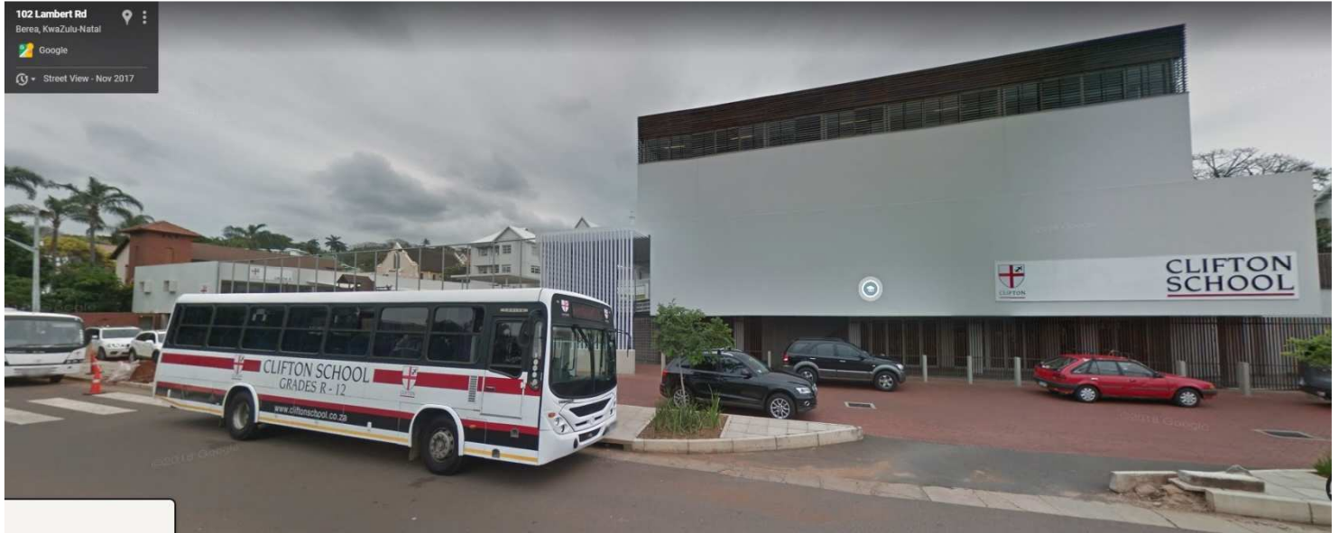
Fig 15. Clifton across the road, to the left