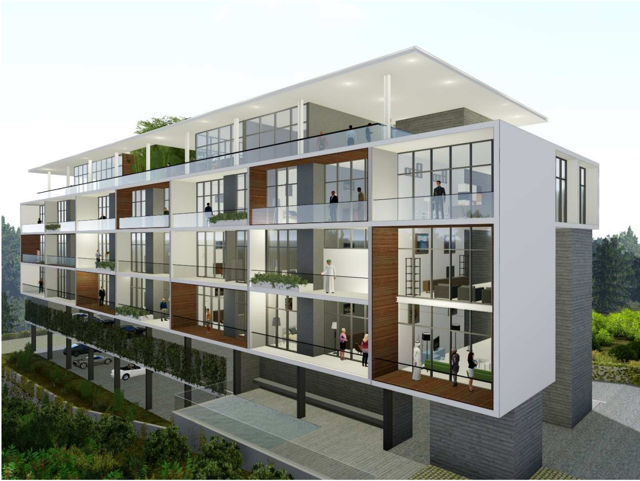
Fig 17. Northeast elevation –Living space elevations- adjacent to panhandle driveway.