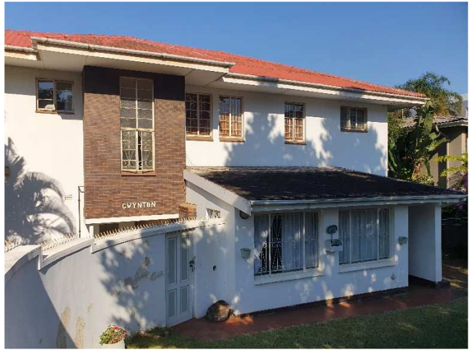
Fig 6. Main House -Street