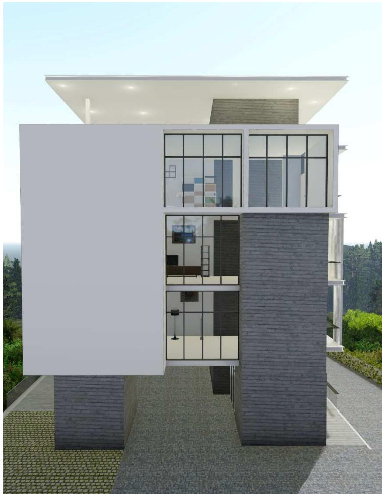
Fig 16. Street Elevation of proposal. Ties in with the language façade of Clifton School With the intention of proposing a minimalistic architecture façade