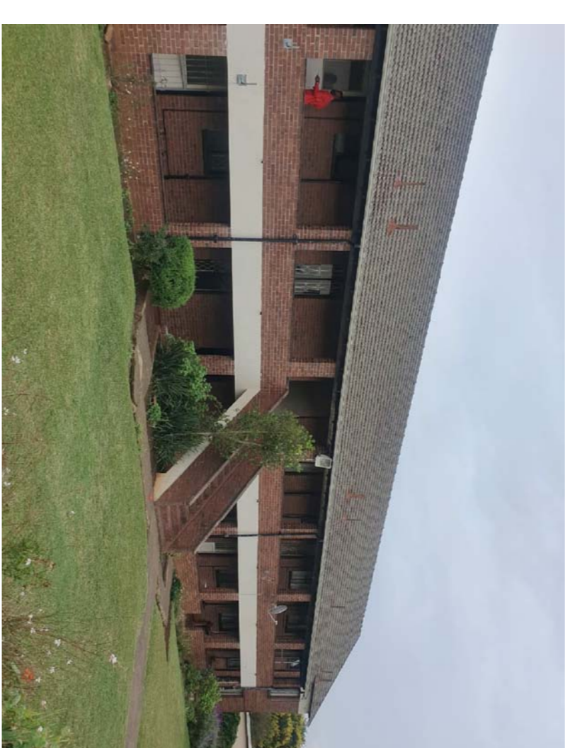
EXIST BLDG : BACK ELEVATION