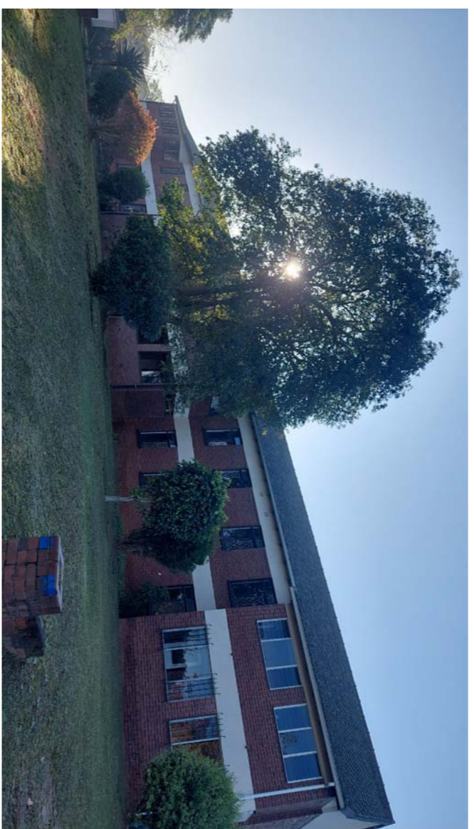
EXIST BLDG : STREET ELEVATION