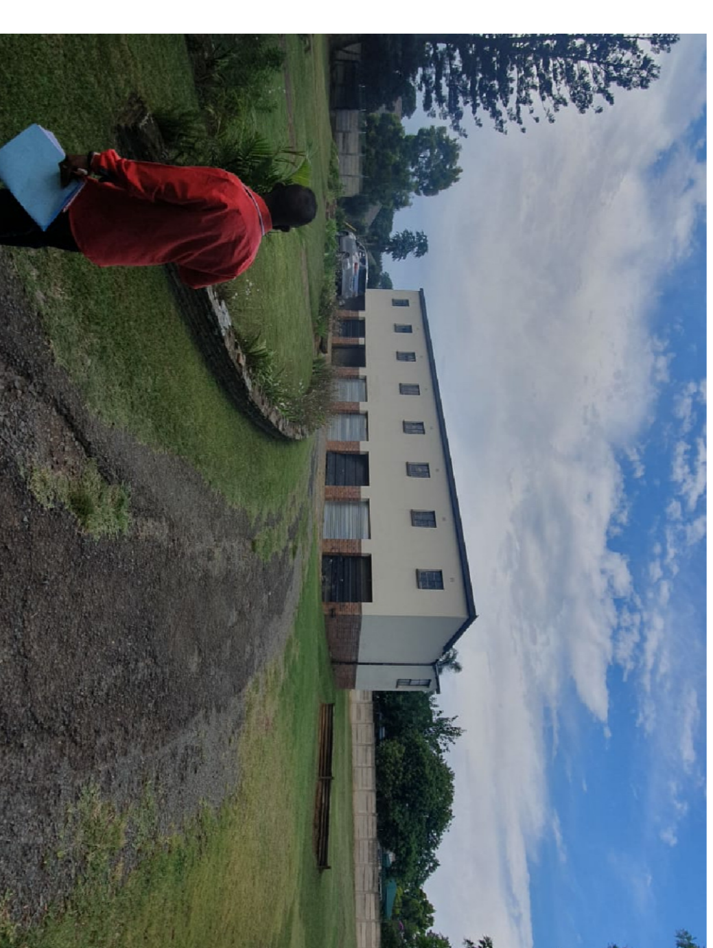
EXISTING OUTBUILDING - TO BE DEMOLISHED