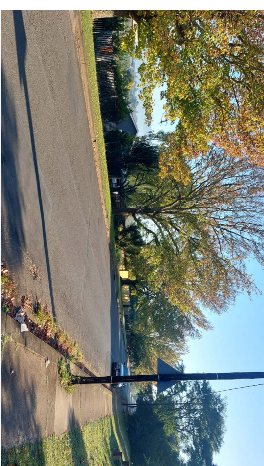
STREETSCAPE : S.W VIEW ALONG CHRISTIE ROAD