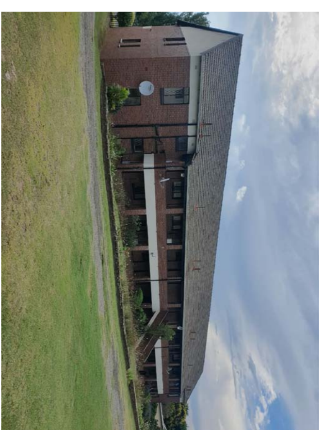
EXIST BLDG : BACK ELEVATION