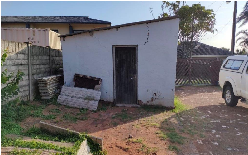
EAST ELEVATION EXISTING GARAGE (To be demolished).