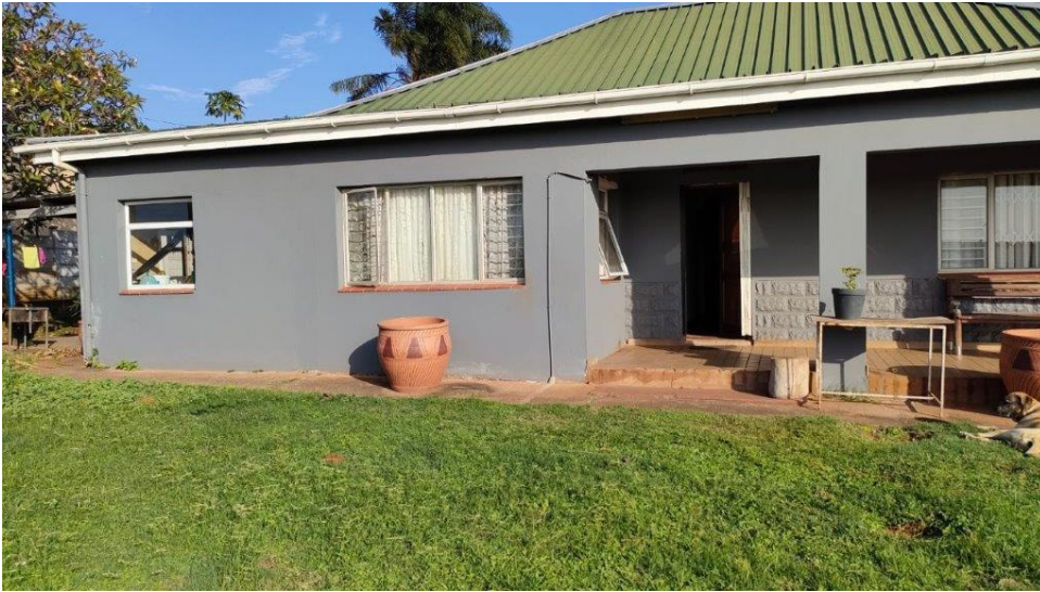
PART SOUTH ELEVATION OF THE EXISTING DWELLING