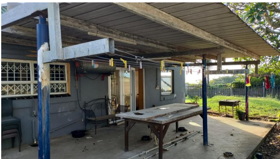
PART EAST ELEVATION OF THE EXISTING DWELLING