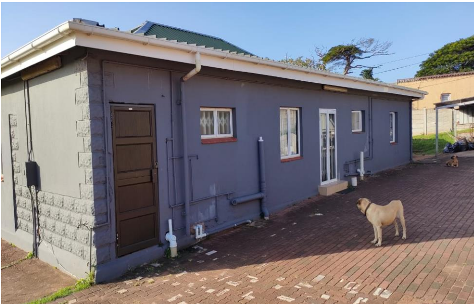
NORTH ELEVATION OF THE EXISTING DWELLING