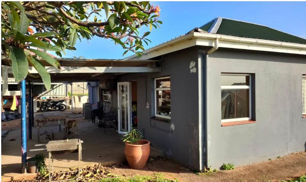
PART EAST ELEVATION OF THE EXISTING DWELLING