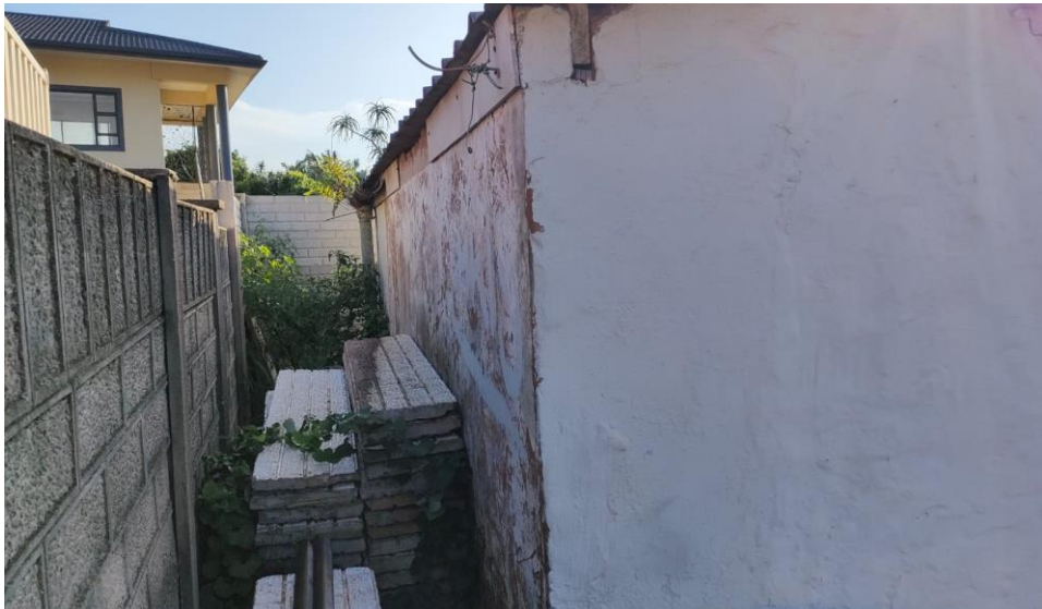
NORTH ELEVATION OF THE EXISTING GARAGE (To be demolished)