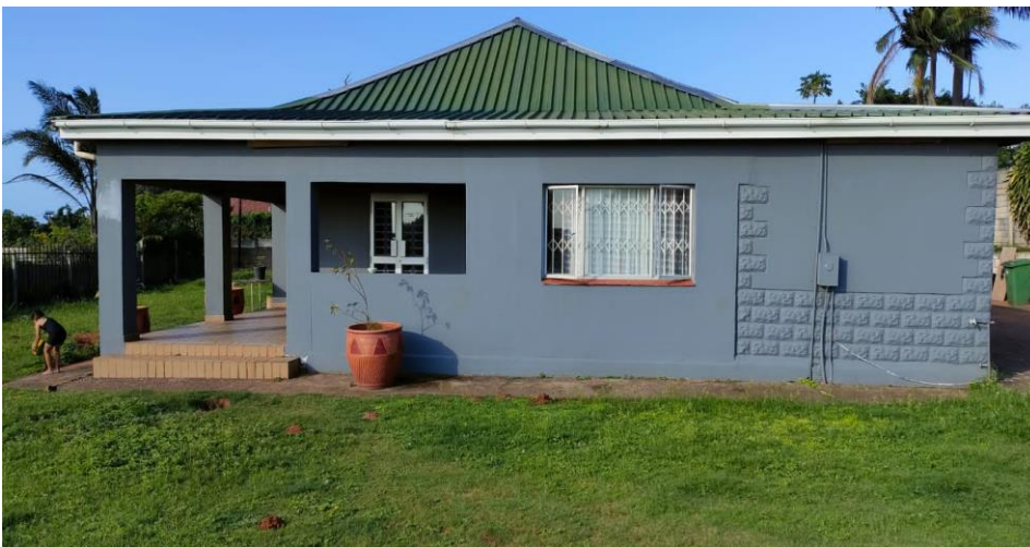
WEST ELEVATION OF THE EXISTING DWELLING