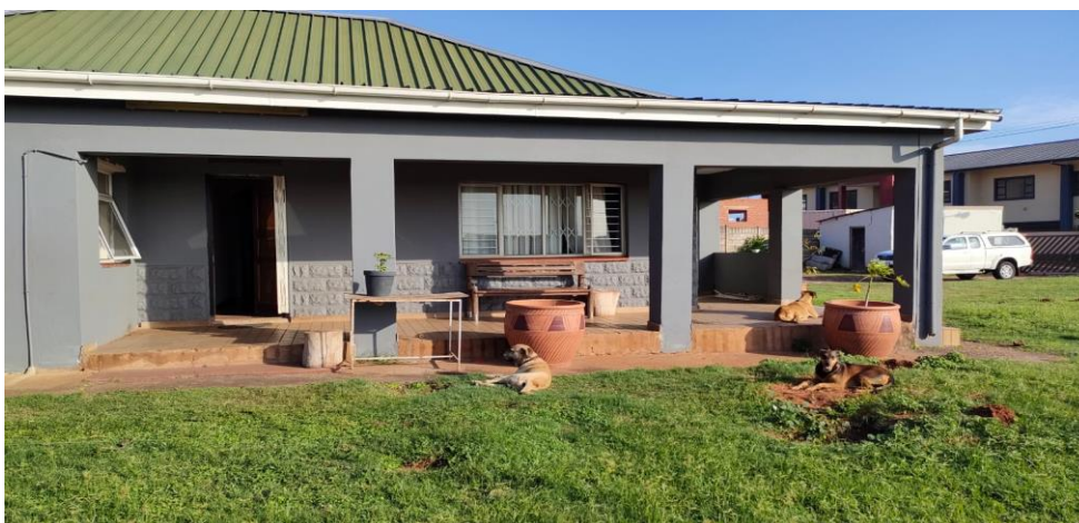
PART SOUTH ELEVATION OF THE EXISTING DWELLING