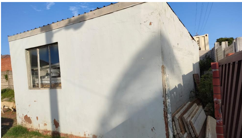
SOUTH ELEVATION OF THE EXISTING GARAGE (To be demolished).