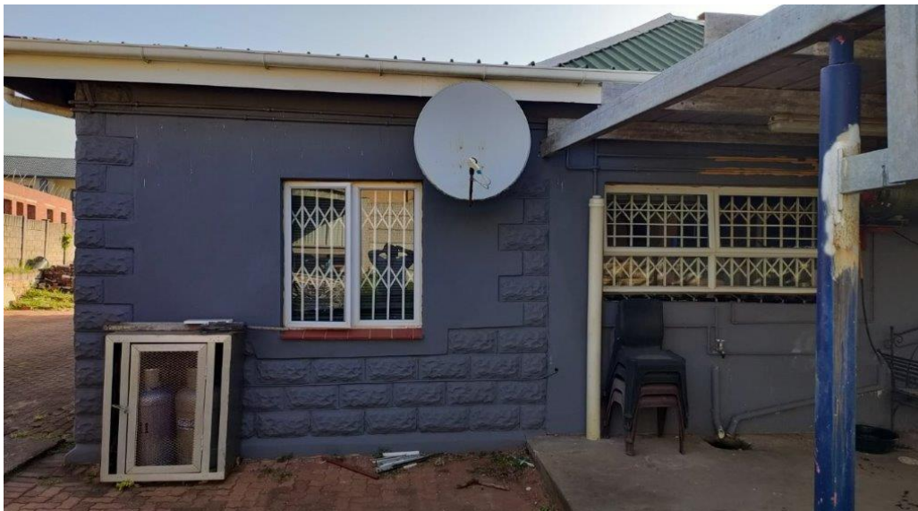
PART EAST ELEVATION OF THE EXISTING DWELLING