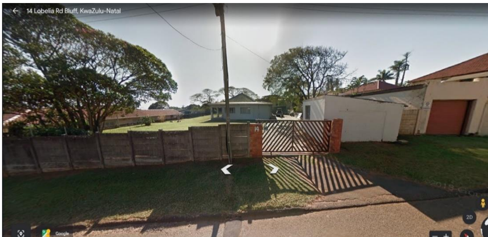
ROAD FRONTAGE OF THE EXISTING DWELLING – WEST ELEVATION