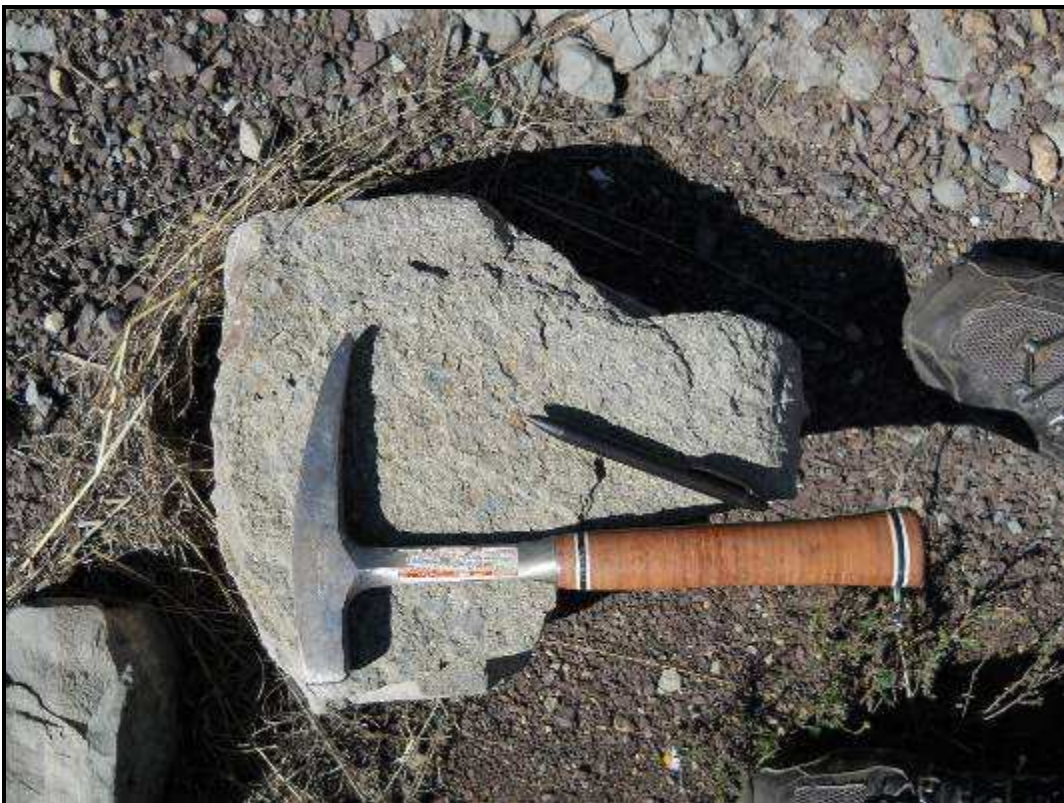
Figure 6.7 Clay pellet conglomerate with small bone fragments in Katberg Formation (Road cutting ref. S31.35864; E25.01345)