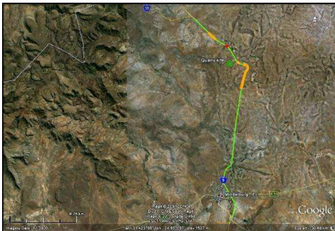
Figure 8.1 Palaeontological impact of the proposed rehabilitation of Section 7 of the N9 National Road