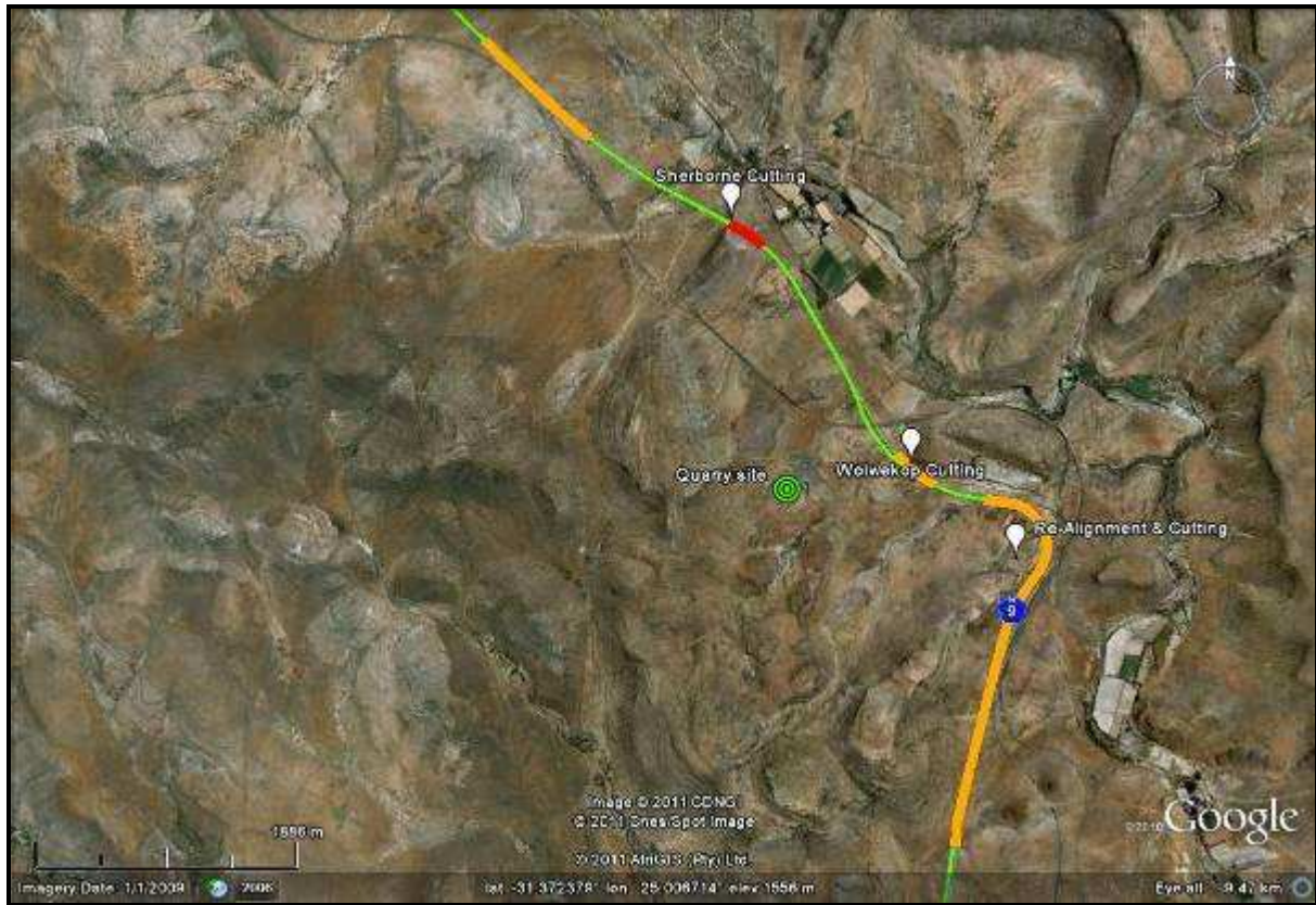
Figure 8.2 Site specific palaeontological impact of the proposed rehabilitation of Section 7 of the N9 National Road

The proposed rehabilitation of Section 7 of the N9 National Road will require excavations into the present road reserves to widen the existing road. This excavation has the potential to impact directly on fossil heritage if the Katberg Formation’s mudstone is exposed especially in the current road cuttings. From Figure 8.2 the following mitigation measures are recommended: