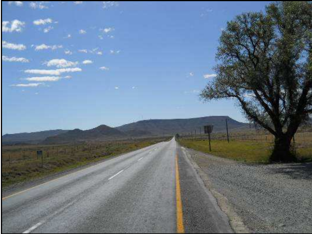
Figure 6.1 Level valley floors with rugged hill topography of interbedded sandstone and mudstone of the Katberg Formation (S31.34467; E24.99154)