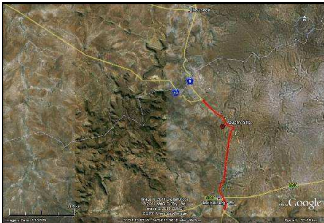
Figure 2.1 Location and Layout of the Proposed Road Upgrade at Middelburg Eastern Cape

South African National Roads Agency Ltd, builds, operates and maintains National Roads in South Africa and plans to upgrade section 7 of the N9 National Road between Middelburg and Carlton Heights to the north of the town of Middelburg in the Eastern Cape Province of South Africa (Figure 2.1)