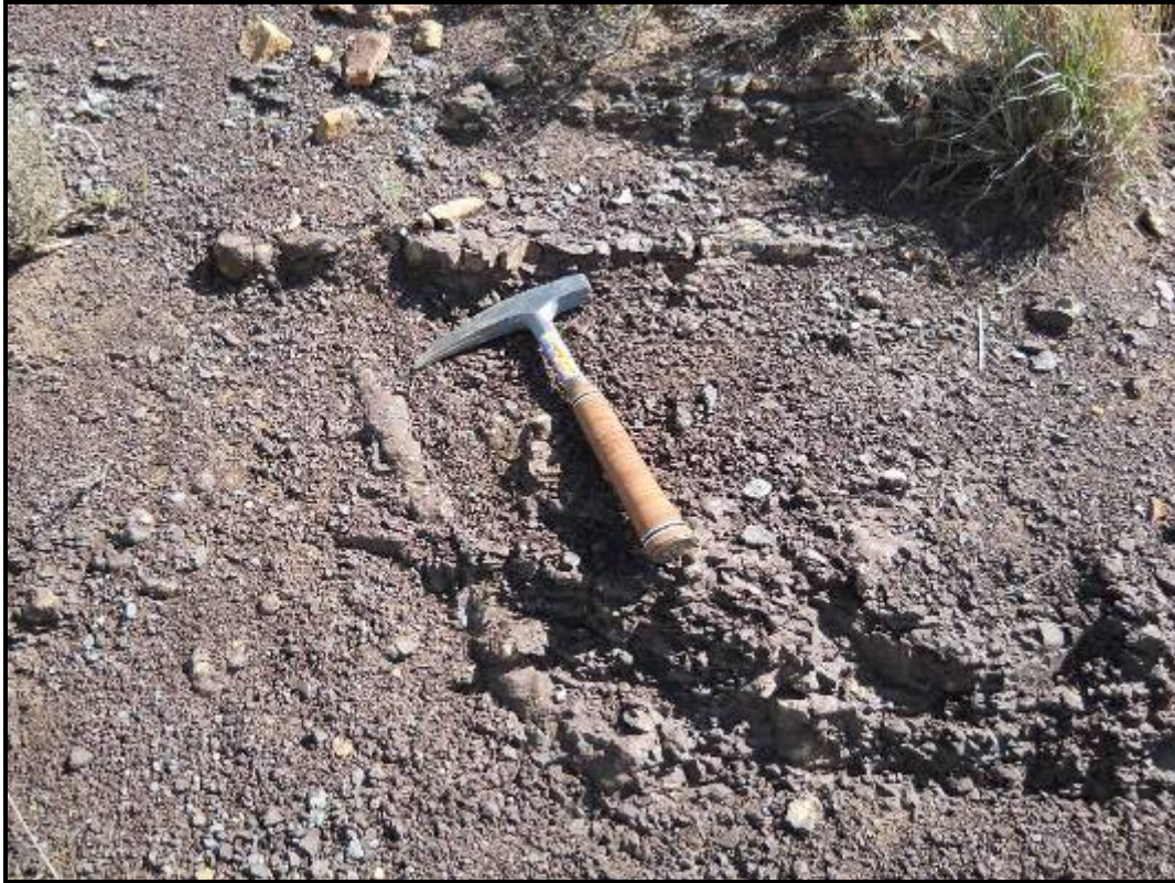
Figure 6.4 Well-preserved vertebrate burrows associated with the Lystrosaurus and Procolophon fauna (Road cutting ref. S31.35864; E25.01345)