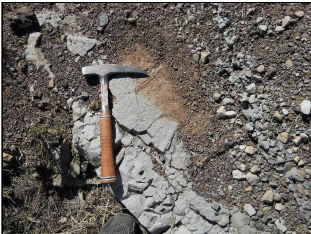
Figure 6.5 Trace fossils in thinly bedded siltstone in the mudstone units of the Katberg Formation (Road cutting ref. S31.35864; E25.01345)