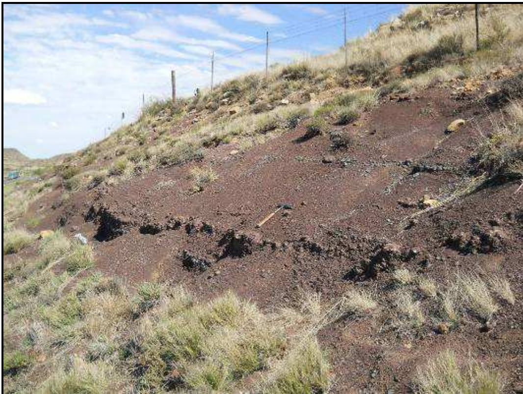
Figure 6.2 Characteristic yellowish-grey to light greenish-grey sandstones and bluish-grey and reddish-grey mudstones of the Katberg Formation (S31.35864; E25.01345)