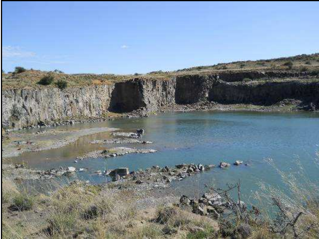
Figure 6.3 Dolerite sill at the Quarry Site (S31.37452 E25.01846)

The ridges and higher topography of the study area consist of dolerite sills and dykes with some prominent outcrops. The quarry site is also situated in one of these sills (Figure 6.3)