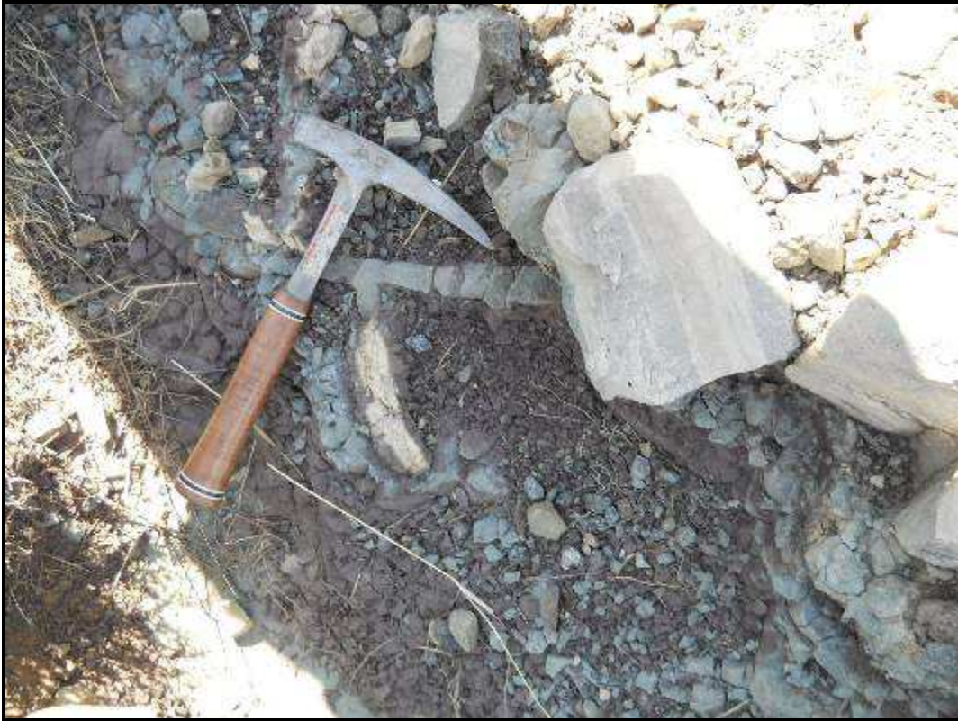
Figure 6.6 Desiccation crack structures at the base of clay-pellet conglomerates. Clay pellet conglomerate contains bone fragments (Road cutting ref. S31.35864; E25.01345).