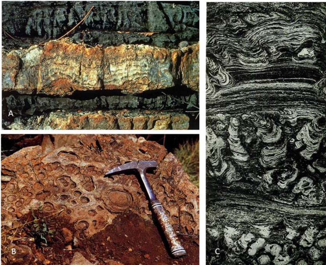
Figure 5: examples of stromatolites, a - in the field in side view; b – surface view in the field; c – side view in section. (Photographs from MacRae, 1999. Life etched in Stone).