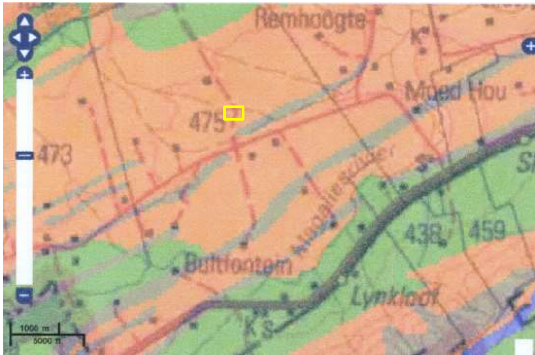
Figure 4: SAHRIS palaeosensitivity map for the site for the proposed Skeerpoort Farm mast on Farm Bultfontein 475 JQ shown within the yellow rectangle. Background colours indicate the following degrees of sensitivity: red = very highly sensitive; orange/yellow = high; green = moderate; blue = low; grey = insignificant/zero.