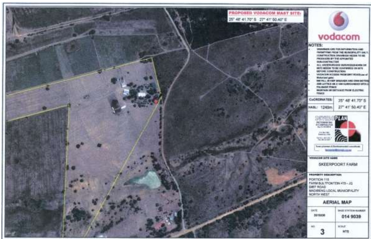
Figure 1: Google Earth map of the proposed site for the Skeerpoort Farm mast on Portion 115 of Farm Bultfontein 475 JQ with the site as indicated. Map supplied by HCAC.